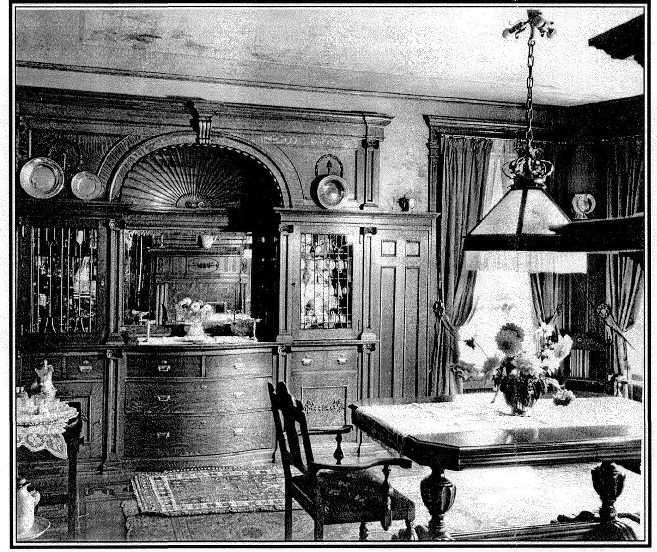
Fig. 1 The diningroom of the Wells House, c. 1907, showing the ortiginal mahogany built-in sideboard, the wall finishes, etc.