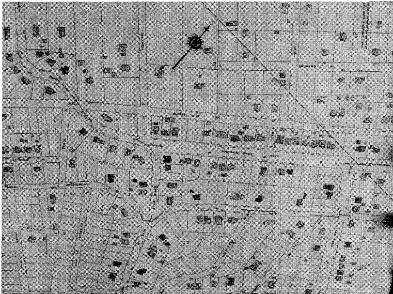
1941 Sanborn map showing park and much of the district.

143.) Boulevards, street landscape, streetscape, park. These elements date from the 1920s and are considered a contributing site.