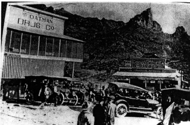
Oatman Drug Company Building, ca. 1917-1918

The only recorded modification to the interior involved the 1916 installation of a concrete vault on the ground floor in 1916 when the building housed the Arizona Central Bank. More recently (within the last two decades) the Main Street facade of the lower story, including the front porch posts, has been painted.