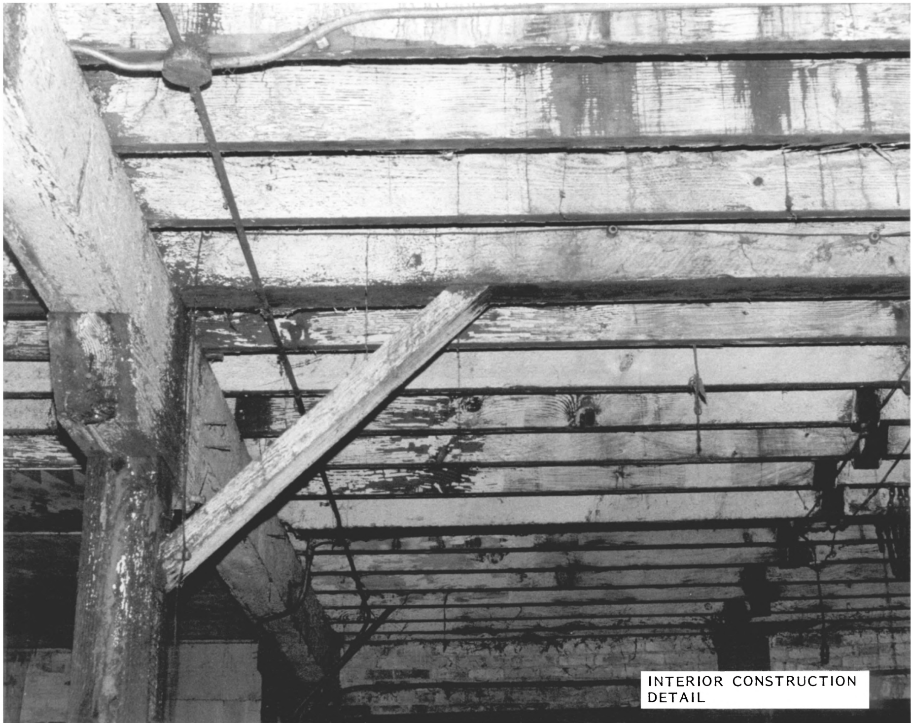
INTERIOR CONSTRUCTION DETAIL