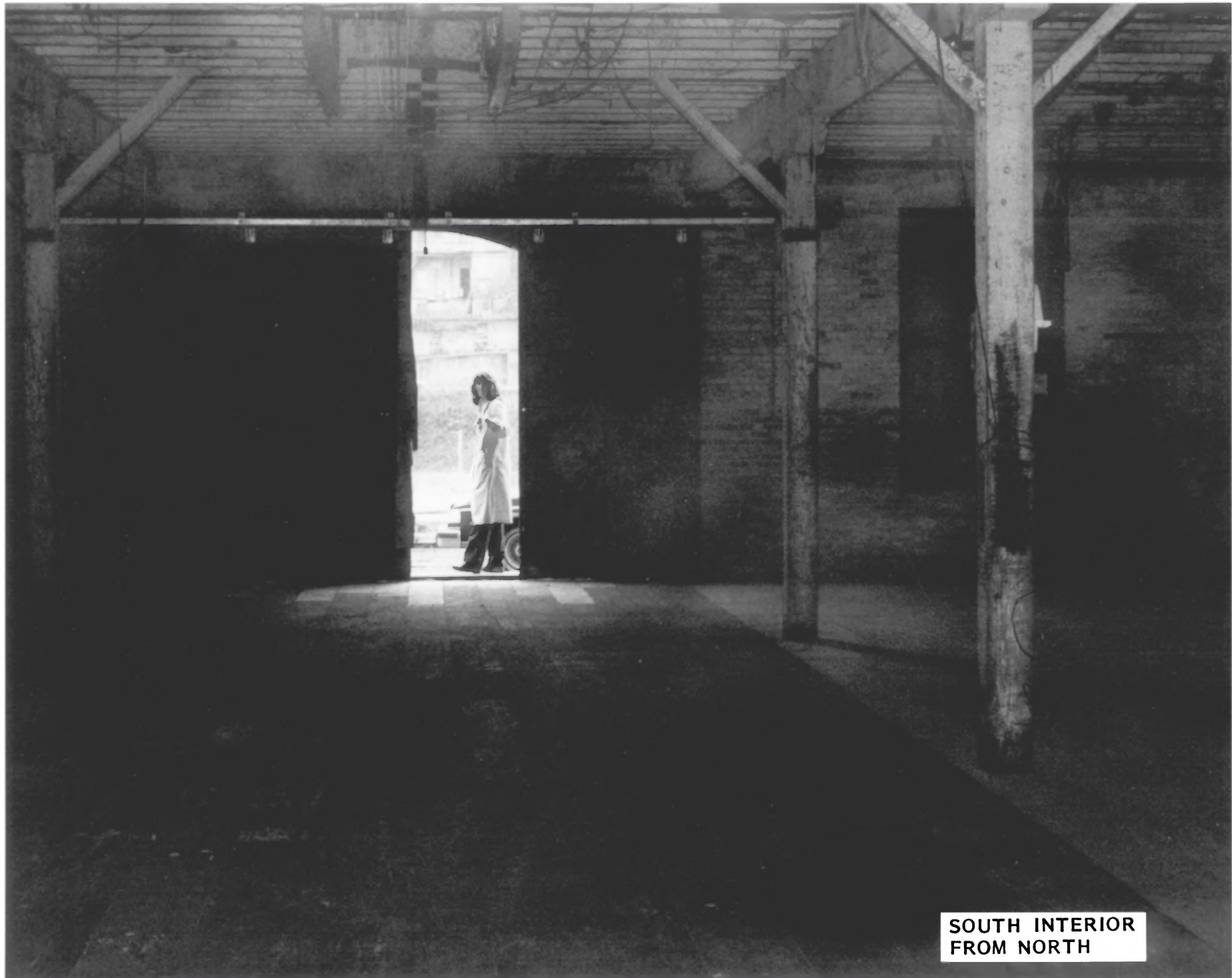
SOUTH INTERIOR FROM NORTH