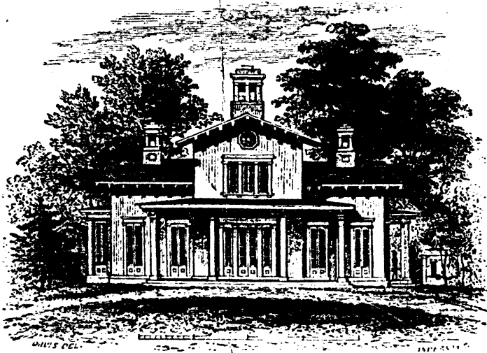
[Fig. 125. Small Classical Villa.]

DESIGNS FOR VILLAS OR COUNTRY HOUSES. 293