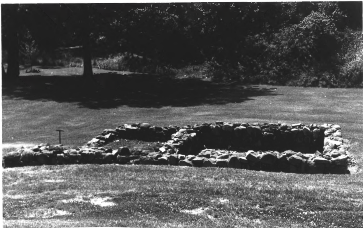
BETHABARA Winston-Salem, North Carolina Stabilized foundations of Doctor's House