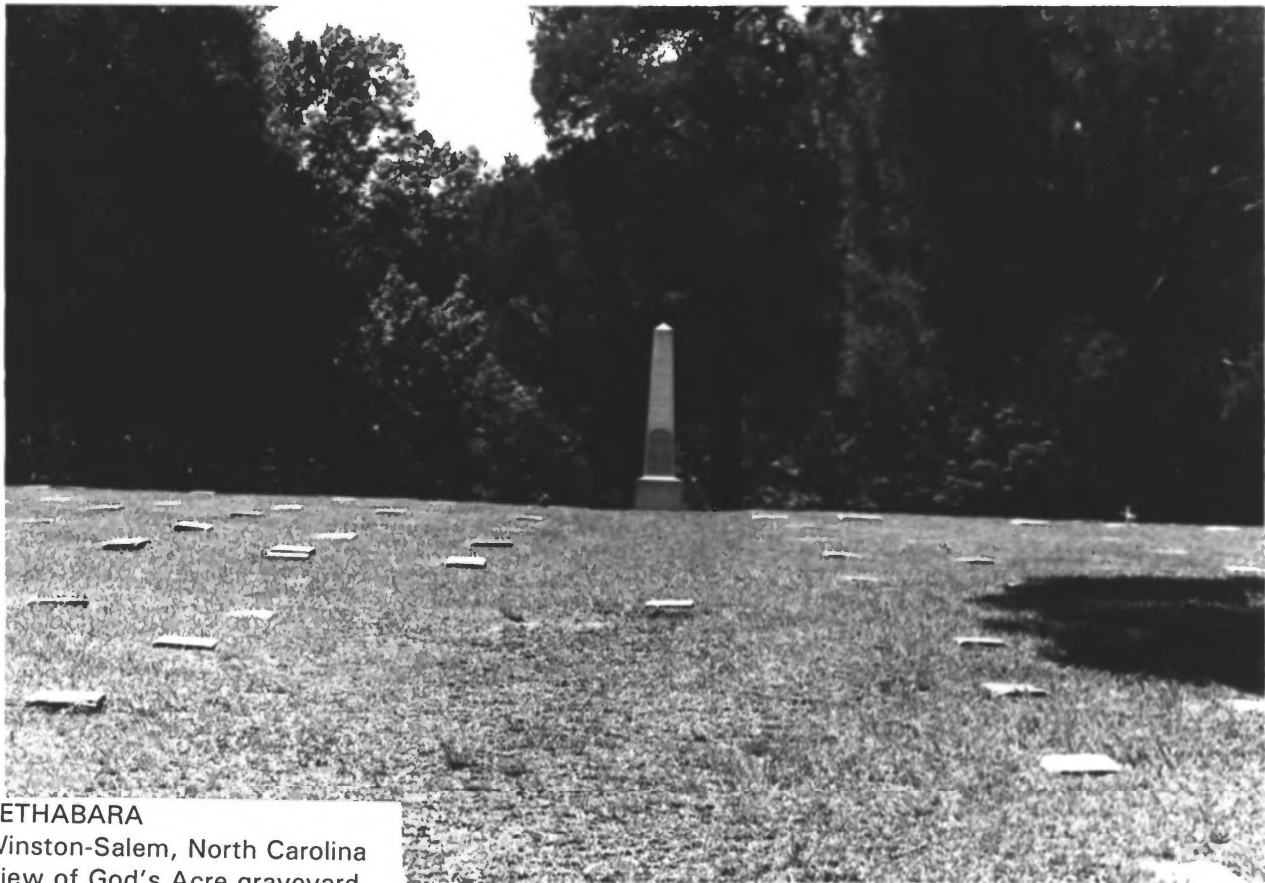
BETHABARA Winston-Salem, North Carolina View of God's Acre graveyard