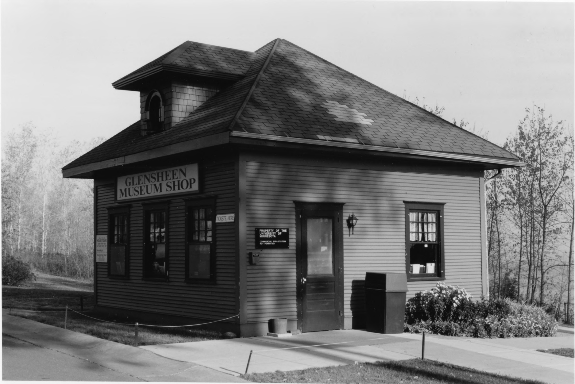
Congdon, Chester + Clara, Estate, MUSEUM SHOP St. Louis County, MN 010664-4 #7 - NON-CONTRIBUTING