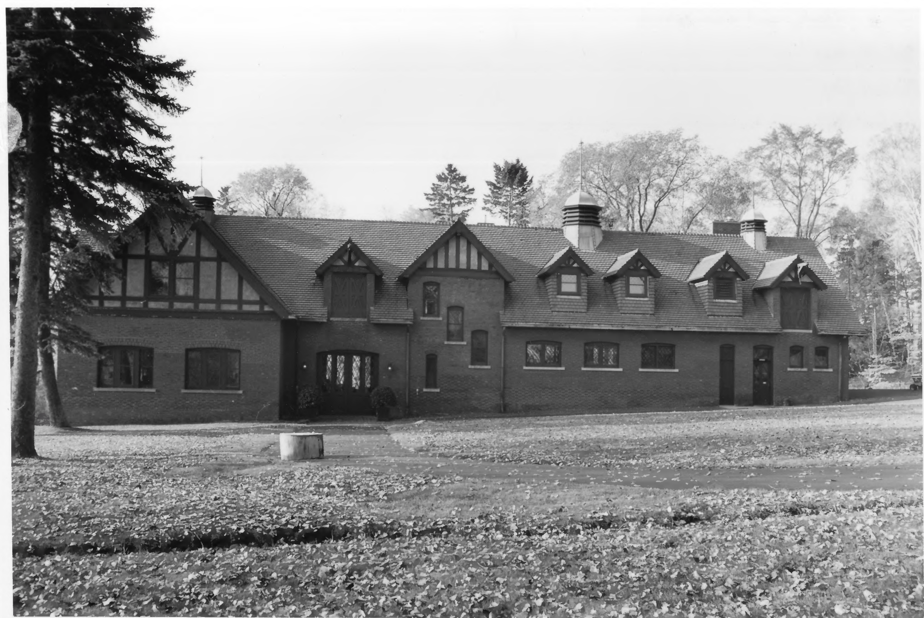
Compton, Chester & Clara, Estate, CARRIAGE HOUSE St. Louis County, MN