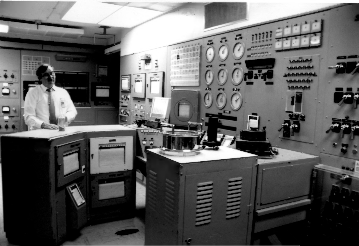
Figure 5. The Control Room of the 100-B Reactor as It Appears Today.