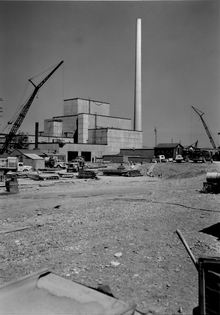
Figure 2. The Hanford B Reactor Under Construction, 1944.