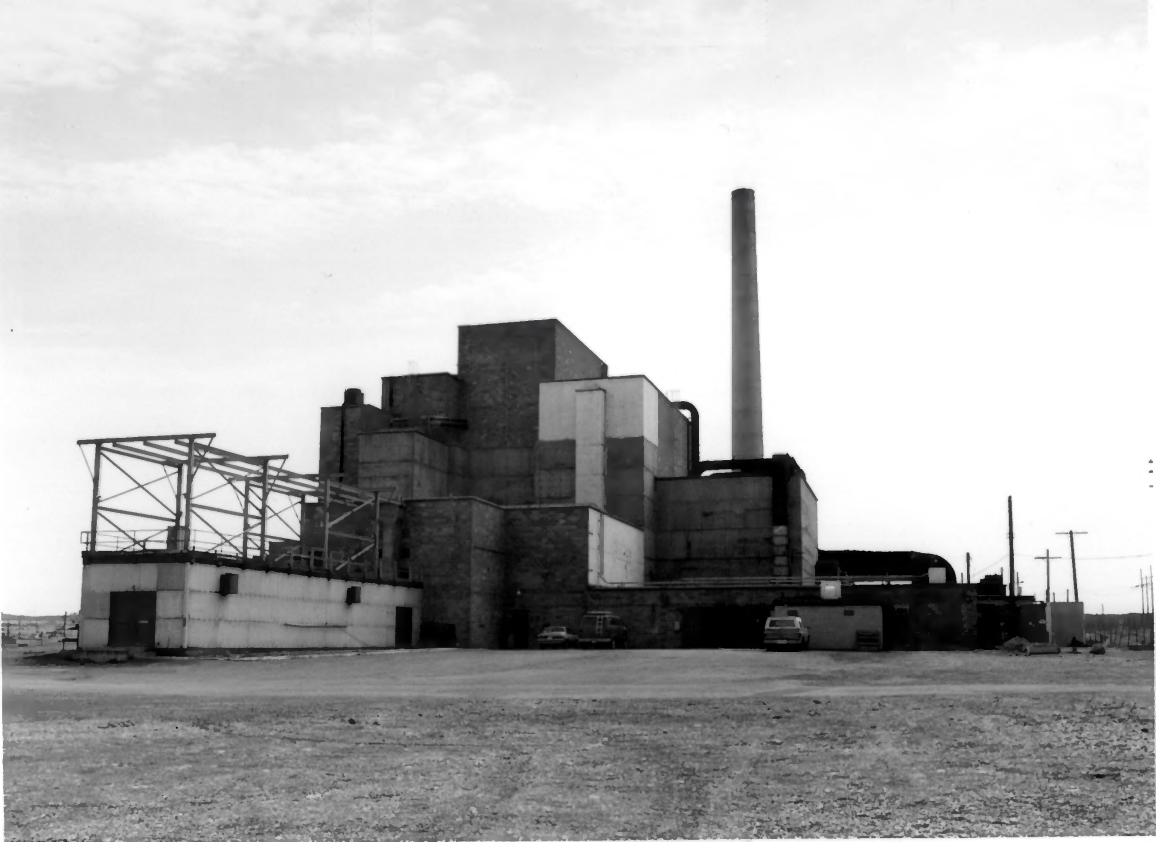
Figure 4. The 100-B Reactor in Its Present Condition, April, 1990.