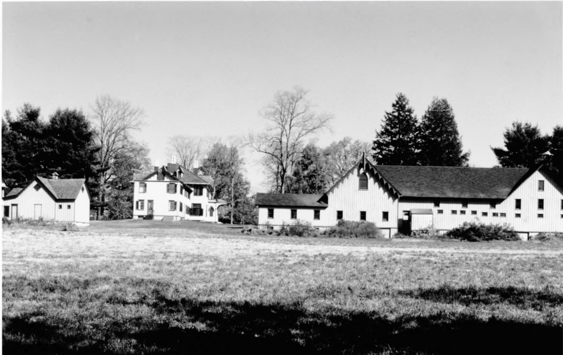
BOWEN, HENRY C., HOUSE (Roseland Cottage) Woodstock, Connecticut Ice house (left), west facade of house, barn & bowling alley (right)