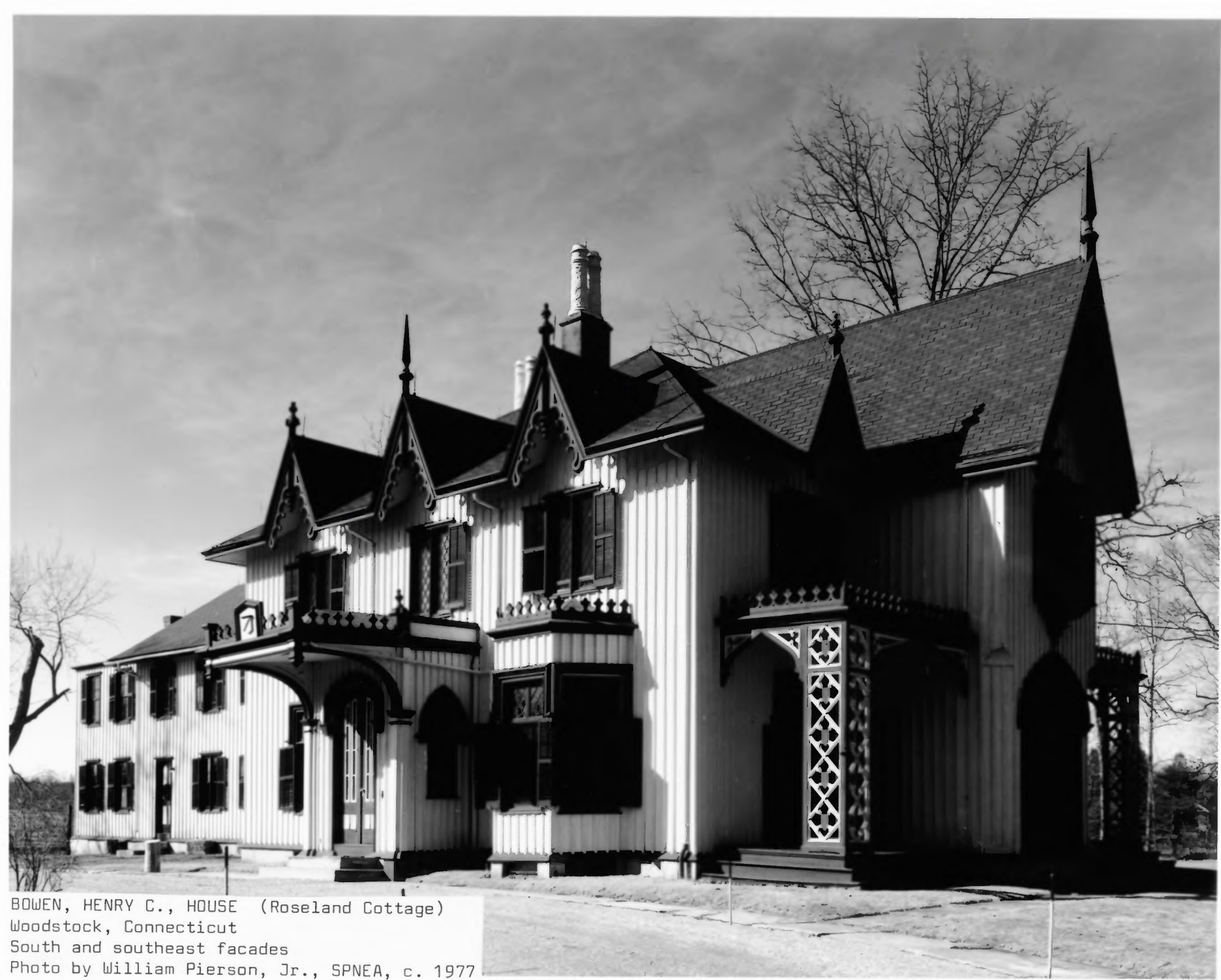
BOWEN, HENRY C., HOUSE (Roseland Cottage) Woodstock, Connecticut South and southeast facades