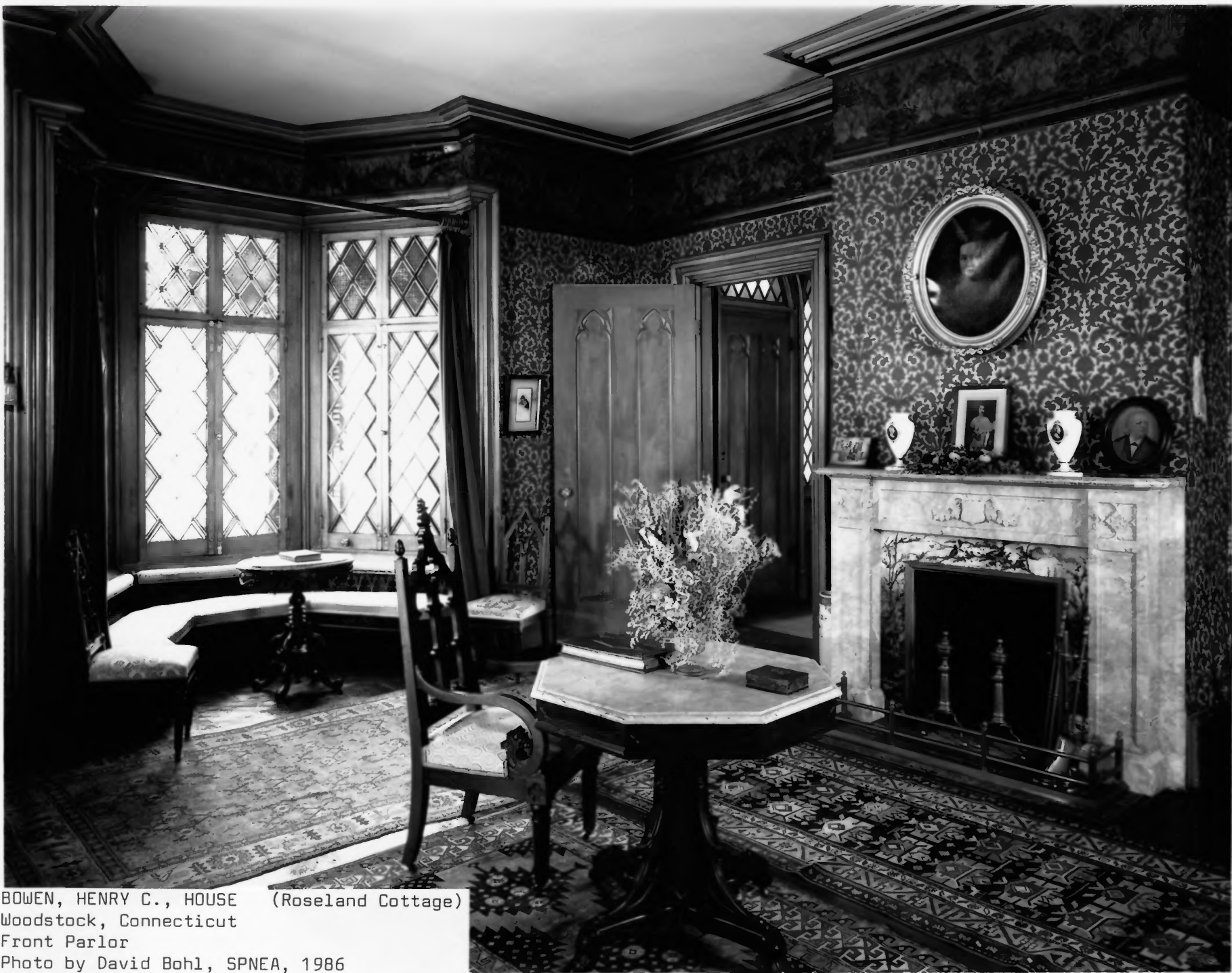
BOWEN, HENRY C., HOUSE (Roseland Cottage) Woodstock, Connecticut Front Parlor