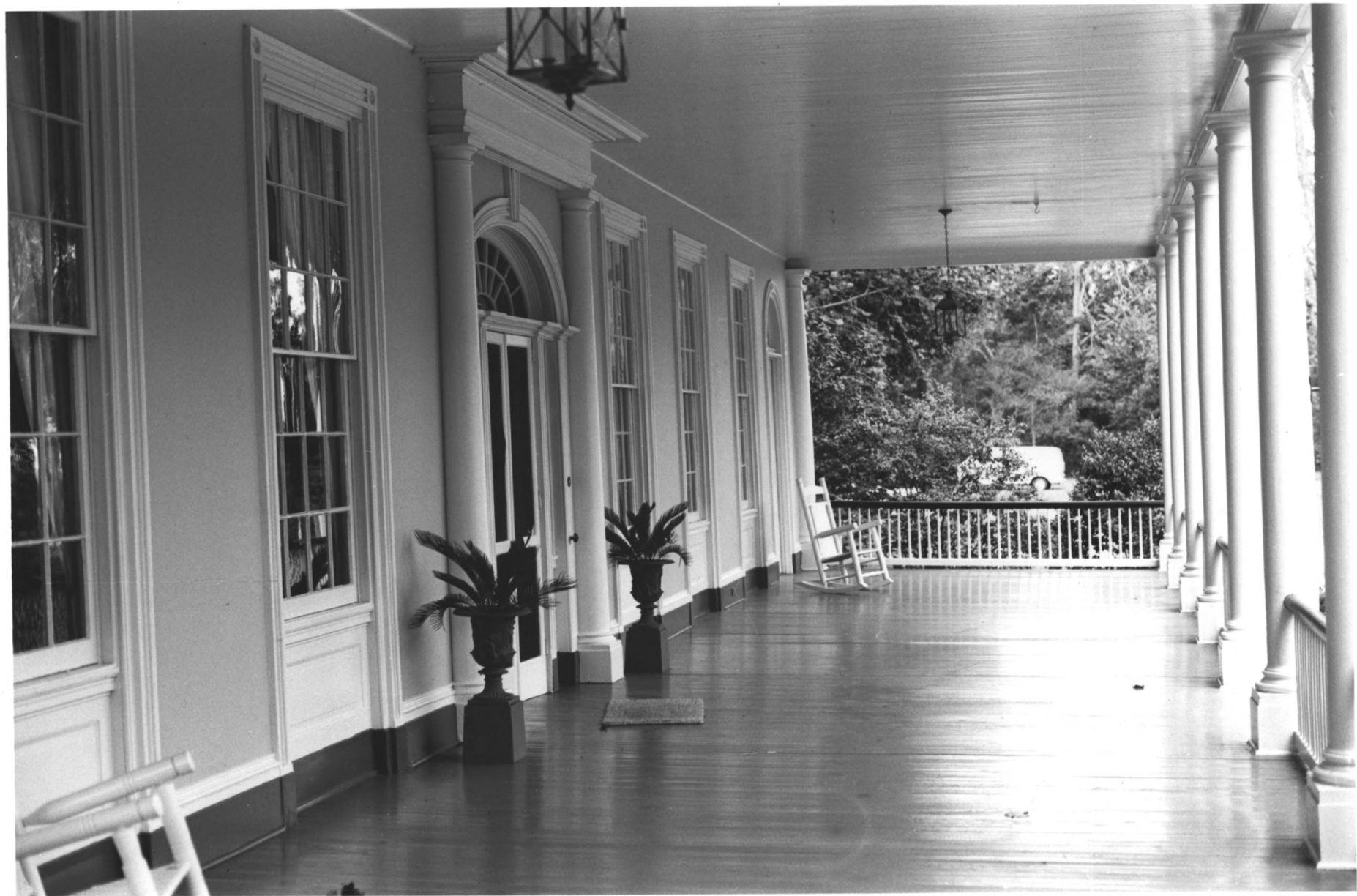
THE BRIERS, 1975 PHOTO