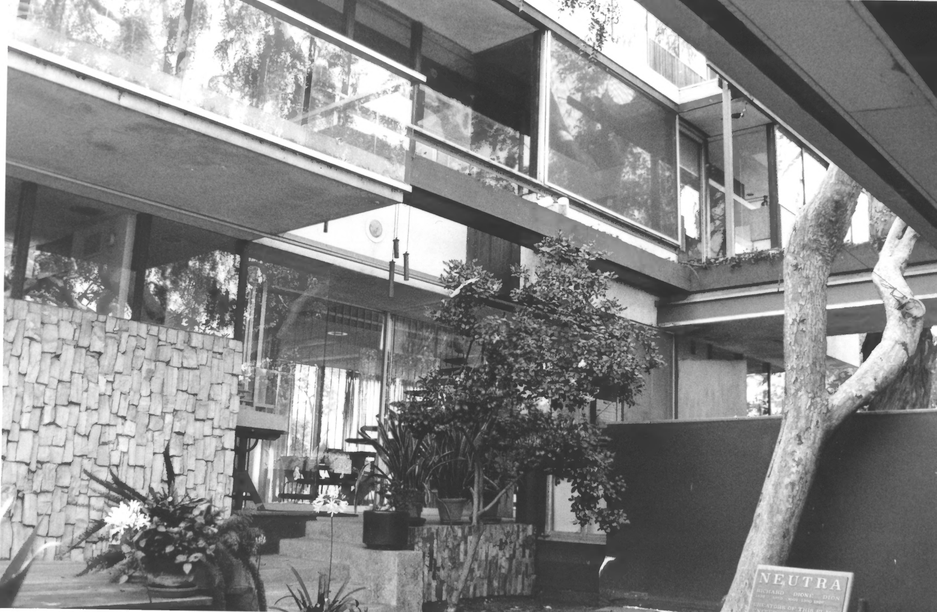
NEUTRA RICHARD DIONIS DION 1907 - 1990 1907 - 1990 DESIGNER OF THIS HOUSE