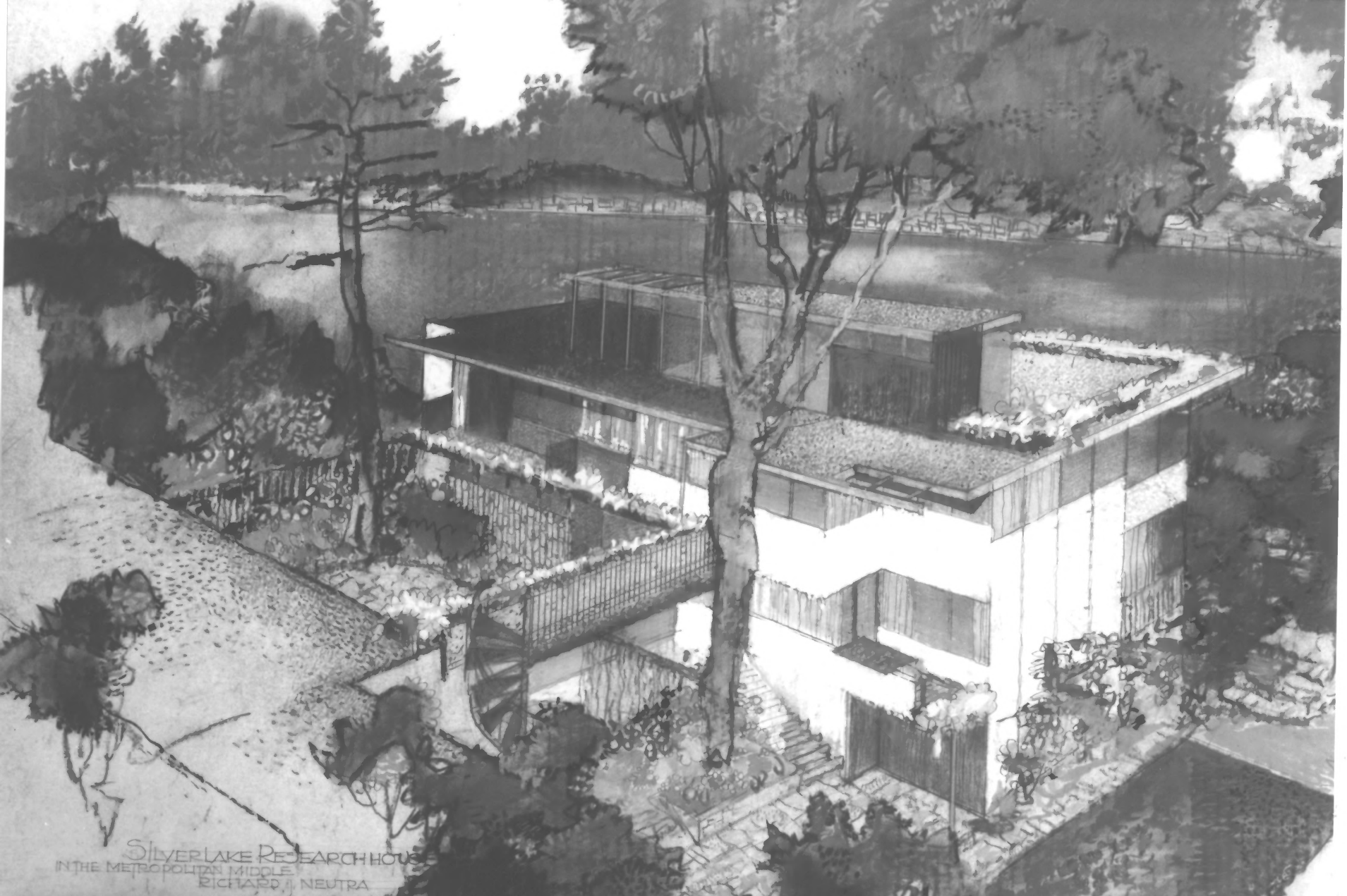
SILVERLAKE RESEARCH HOUSE IN THE METROPOLITAN HILLS RICHARD J. NEUTRA