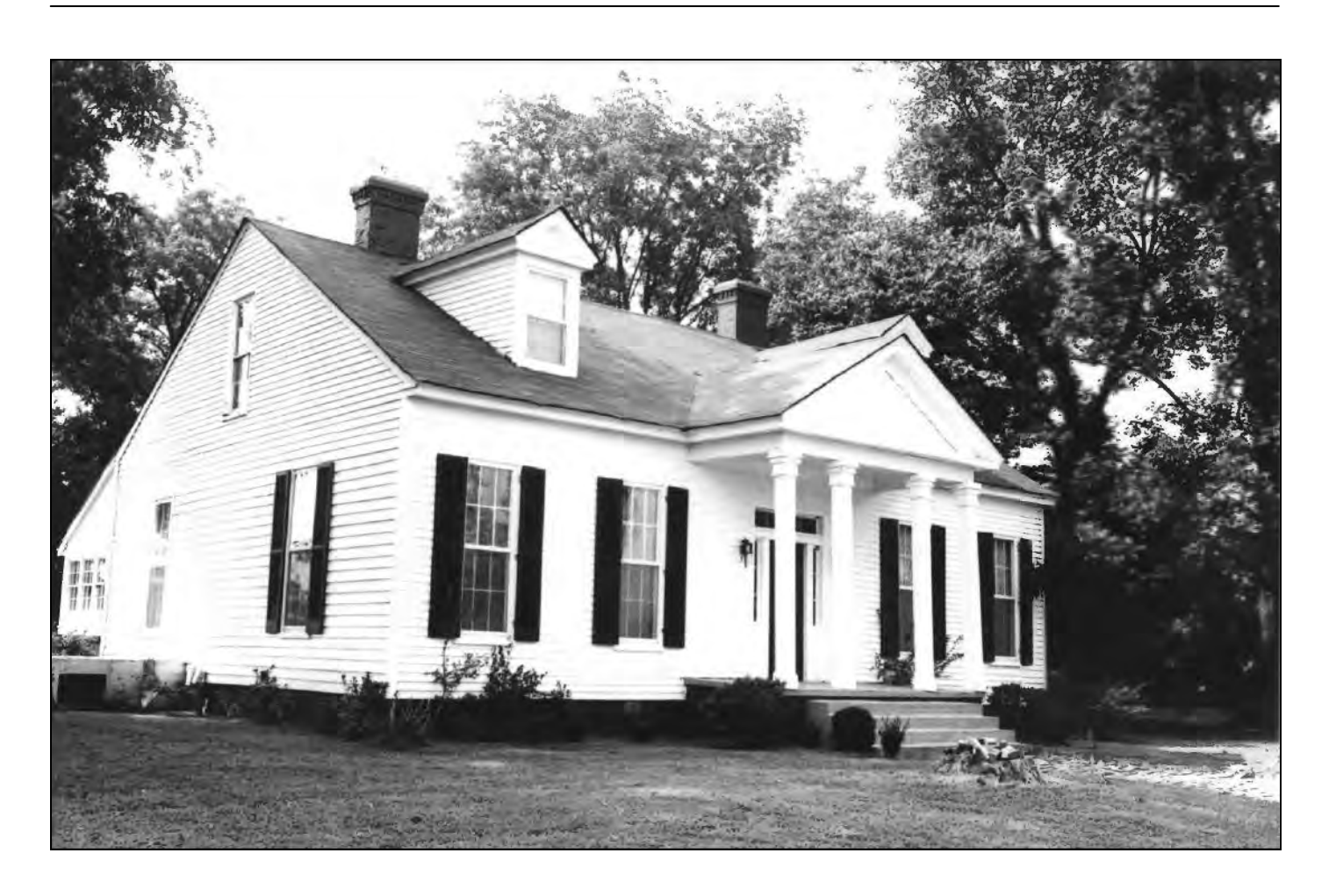
Figure 1: Cedar Grove South Elevation and Façade, August 1979. From Cedar Grove National Register Nomination, 1980.