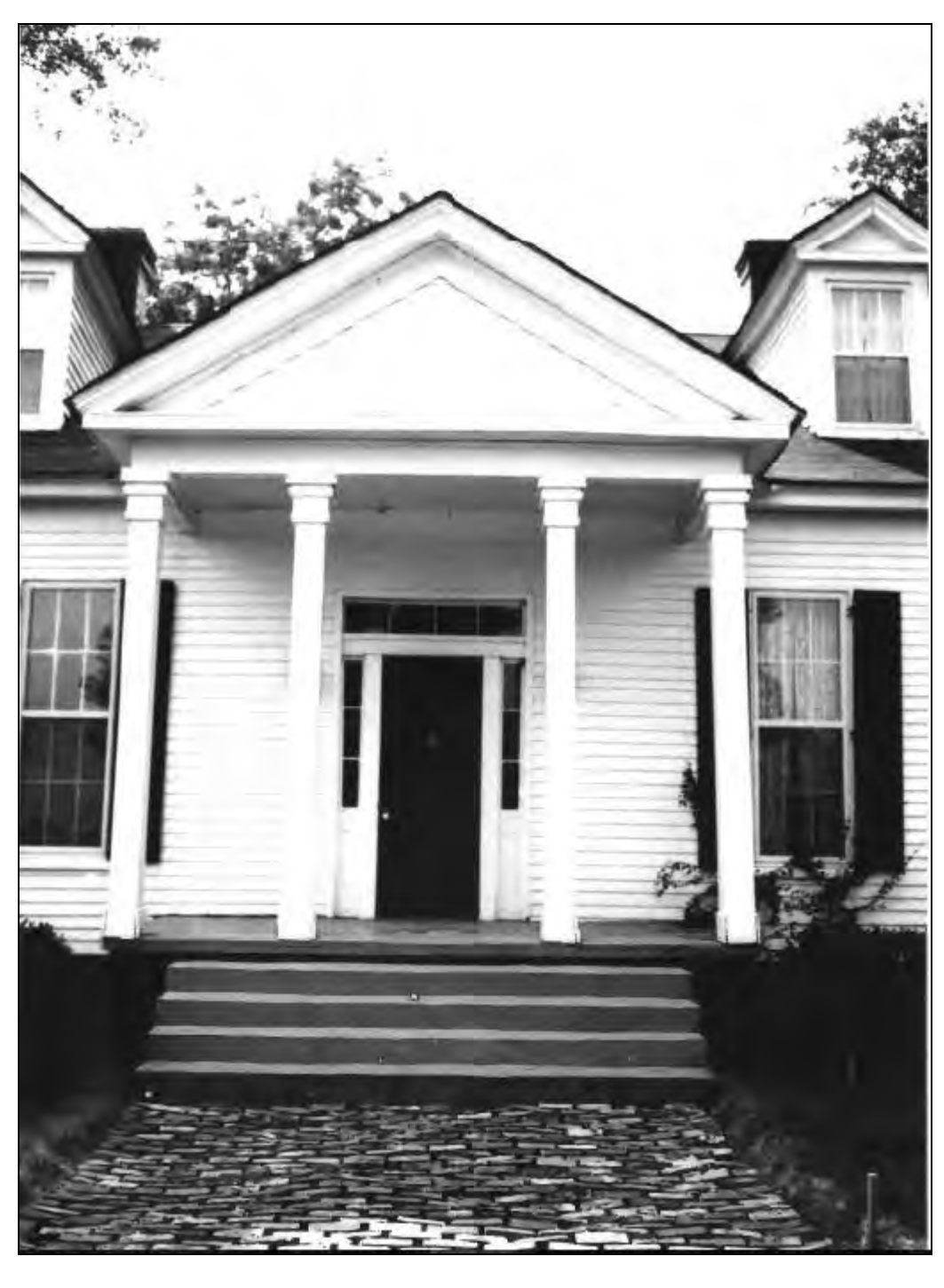
Figure 2: Cedar Grove Front Porch and Door Detail, August 1979. From Cedar Grove National Register Nomination, 1980.