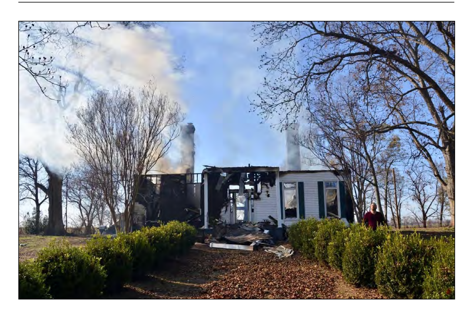
Figure 3: Cedar Grove after a fire, view to the west.