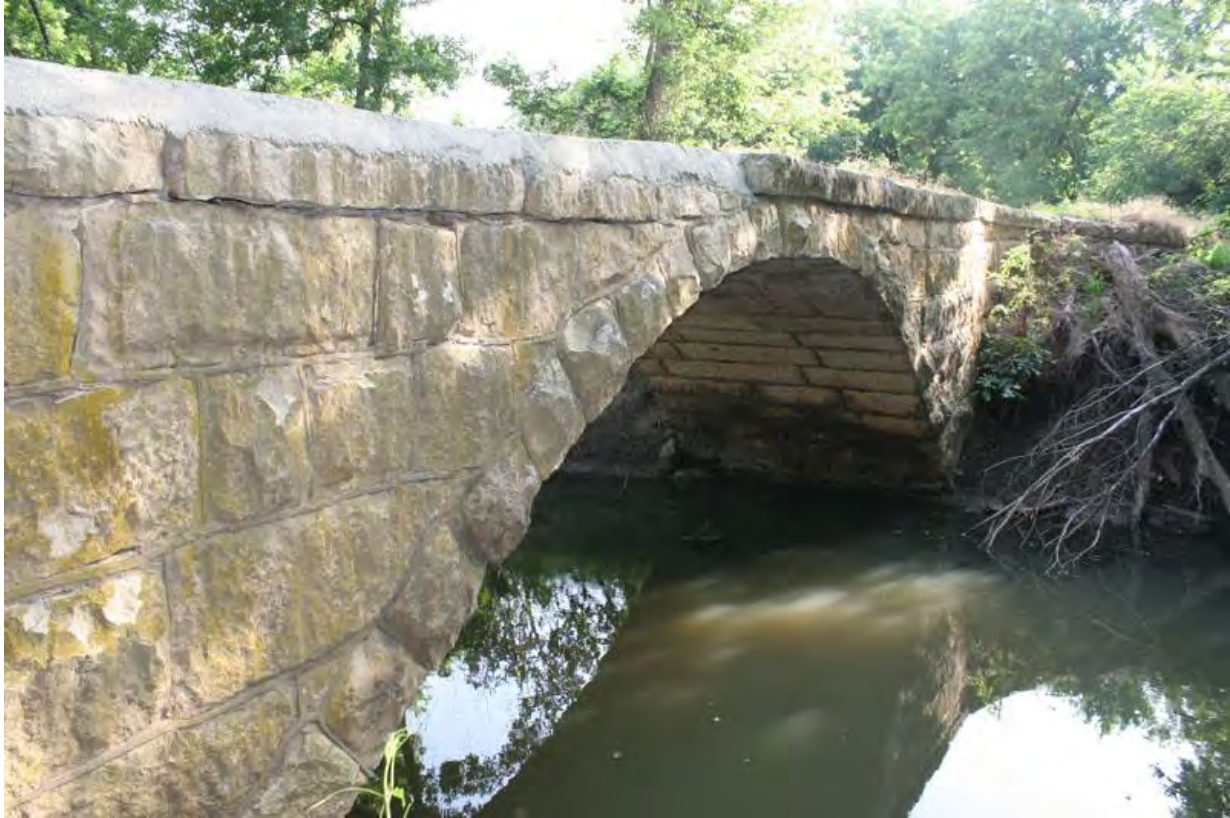
Figure 4. Timber Creek/Floral Bridge (Susan Jezak Ford)