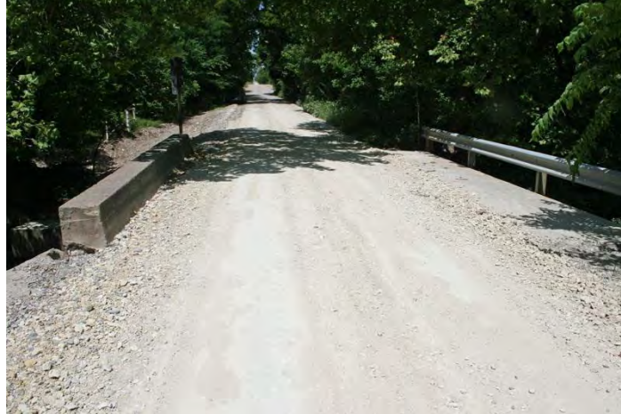
Photograph 5. Deck.

The culvert is maintained by Cowley County. In 1994, it was widened and stem walls were added to support the addition. It is in good condition and retains its architectural integrity in form, placement and materials despite these alterations. It retains its original combination of limestone arch rings and limestone spandrel walls. 5 The culvert's configuration is a smaller version of the MPDF's description of the stone arch bridge property type: "The stone arch bridges included in this nomination consist of limestone arch rings which spring from and are disposed between abutments and piers. Limestone spandrel walls rest on these arch rings and are used to retain the earthen fill, which loads the arch. This earth loading allows for even distribution of the live loads and helps to strengthen the arch." 6