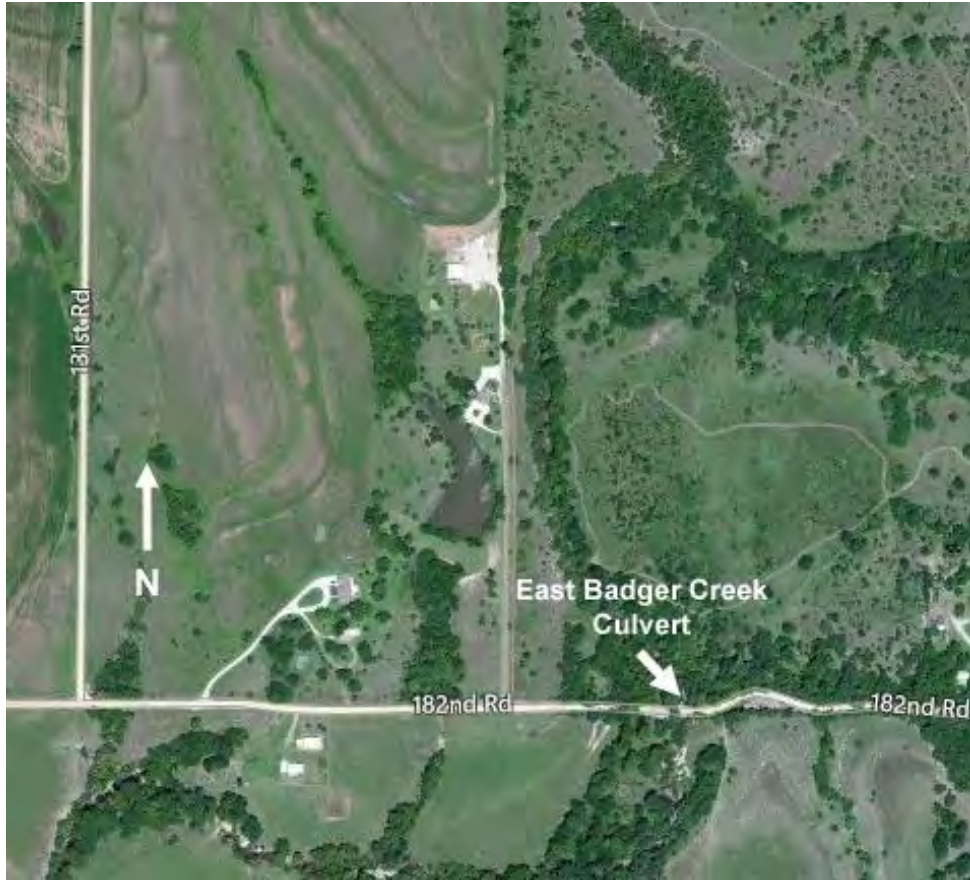
Figure 2. Culvert site plan. ( www.bing.com/maps accessed 7 July 2015)