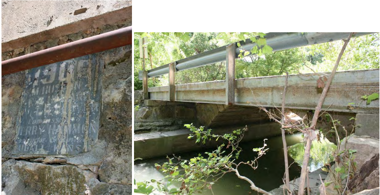
Photographs 3 & 4. South plaque and north side of the culvert.

A carved stone plaque is located on the southeast wall (photograph 3.) It reads: