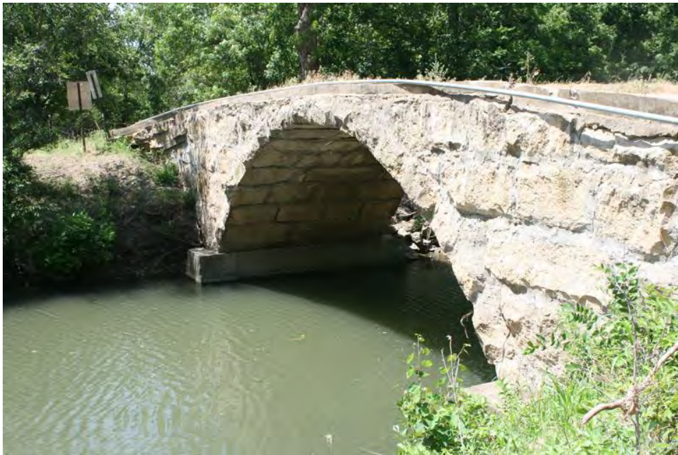
Figure 3. Badger Creek Bridge (Susan Jezak Ford)