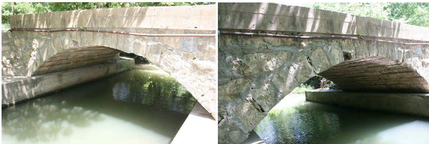
Photographs 1 & 2. South side of the culvert.

The East Badger Creek Culvert runs east to west on 182 nd Road, spanning East Badger Creek. The deck of the culvert is approximately 29 feet long and 20 feet wide. 1 The span is supported by a single wide stone arch that is 20 feet long and 14 feet wide. The top of the arch is approximately nine feet above the water line. The arch rises from springer blocks reinforced with concrete pads set within East Badger Creek (photographs 1 & 2.) The concrete pads, likely added after initial construction, extend north and south of the width of the culvert. The springer rings, spandrel and most of the north and south walls are composed of limestone blocks. 2 A metal and concrete deck, added to the north side in 1994 to expand the width of the culvert, extends over the north wall, partially obscuring the stonework (photograph 4.) North stone stem walls, also built in 1994, support the new north deck. Modern concrete approaches are present on the culvert's south side. The east approach measures approximately 90 feet and the west approach measures approximately 36 feet.