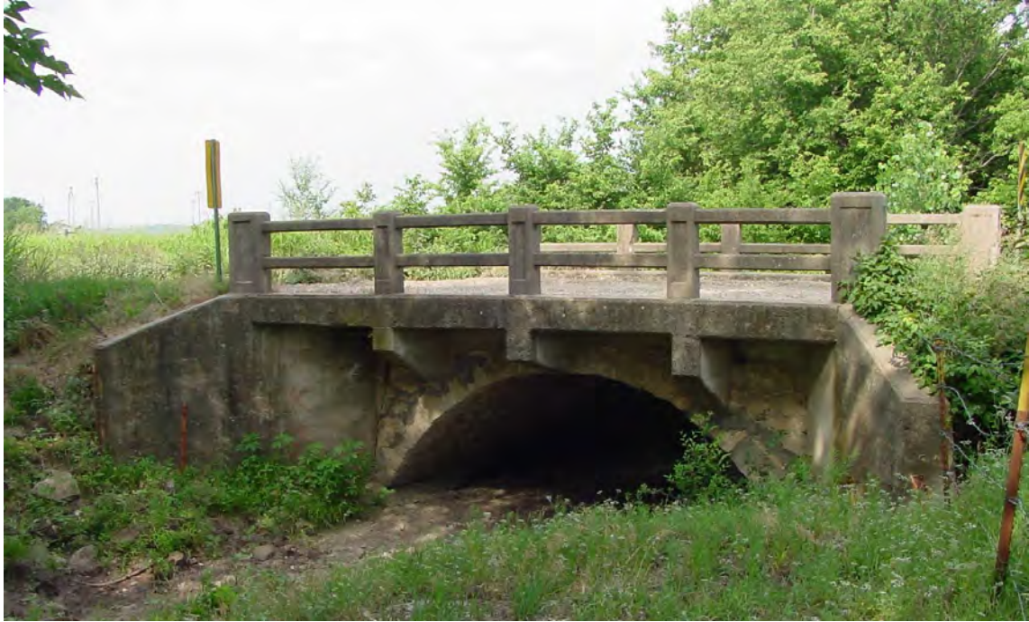
Figure 6. Cowley County culvert north of Dexter