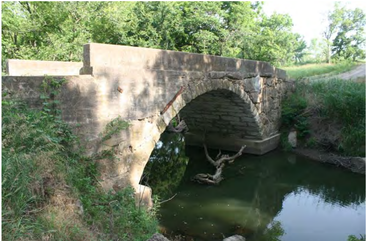
Figure 5. Stewart Bridge (Susan Jezak Ford)