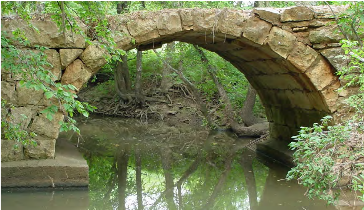
Figure 7. Stalter Creek culvert east of Rock in Cowley County (KDOT)