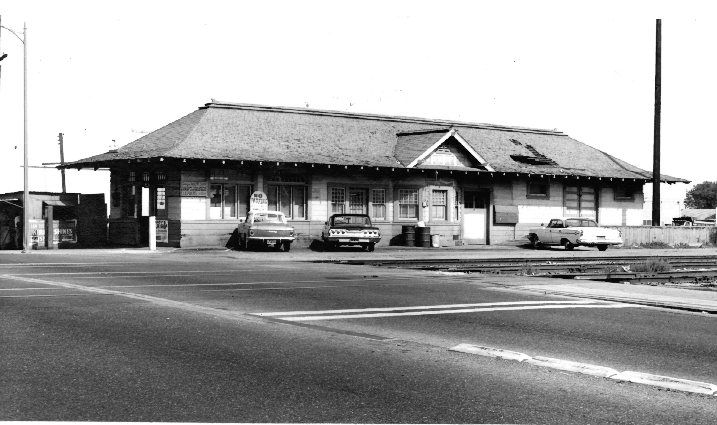
WATTS STATION - 1966