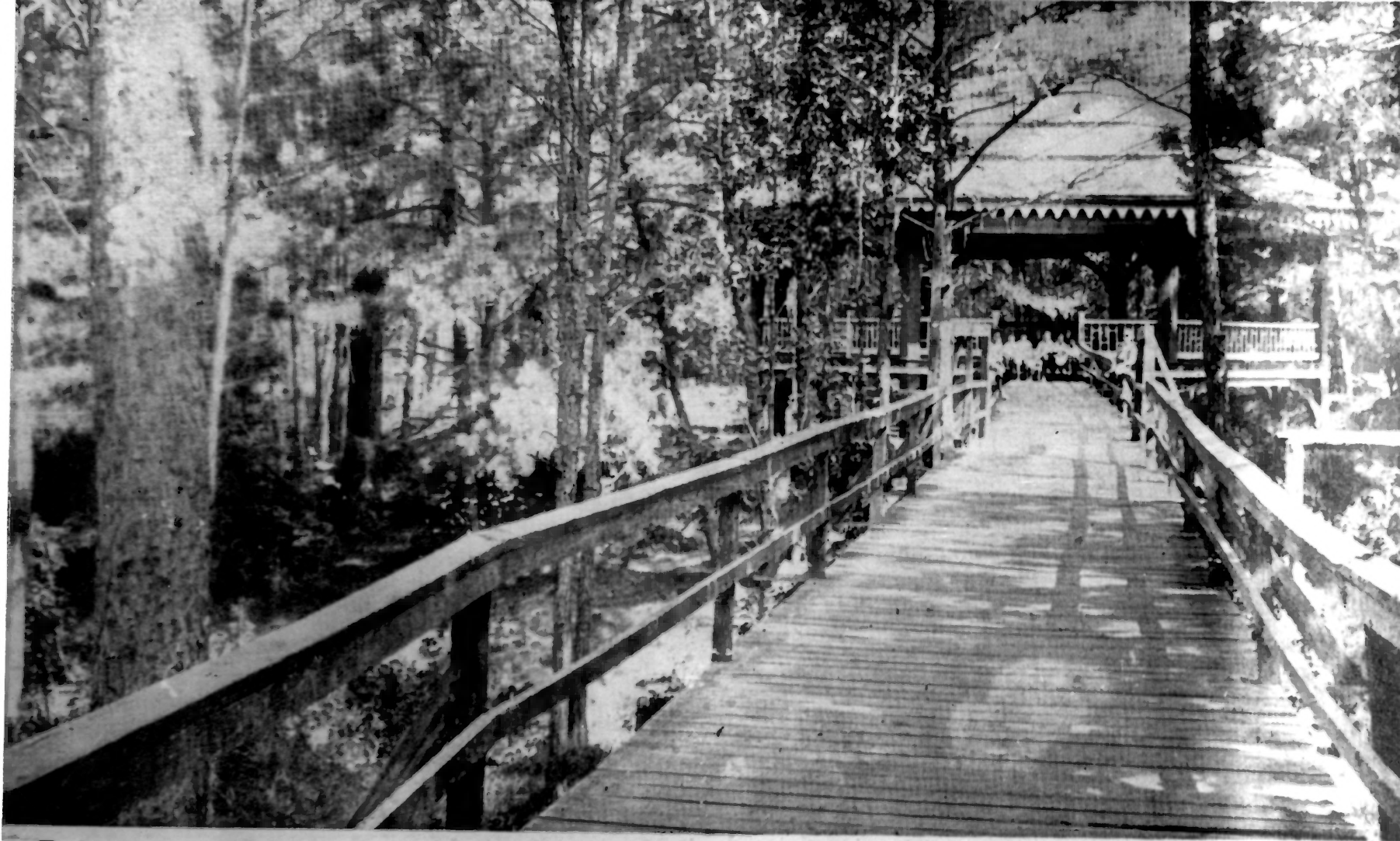
Entrance to Natural Springs, Abita Springs, La. The Land of Fresh Air, Pure Water and Pines.