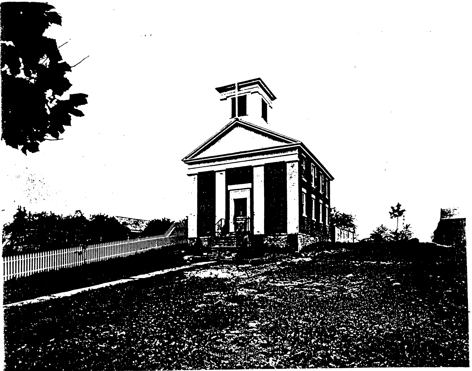
From a Photograph Hill's Academy, c late 1800's EXHIBIT II