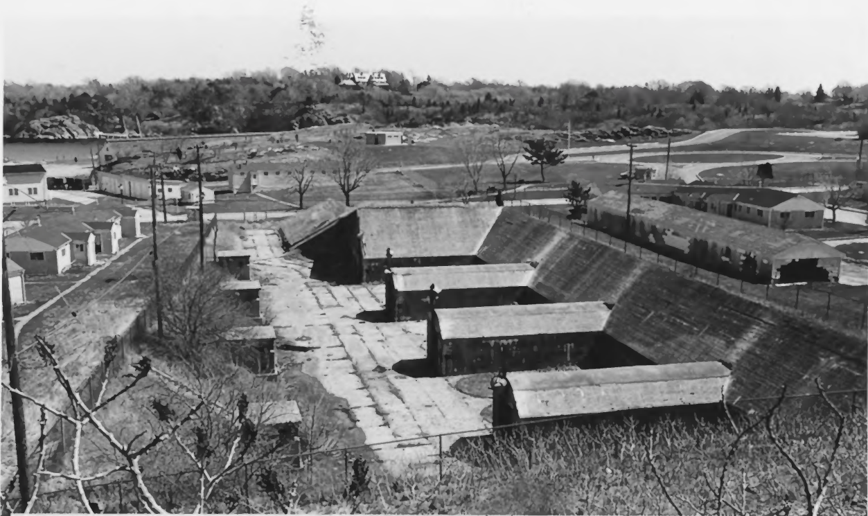
Batteries, Fort Adams Historic District Newport, Rhode Island