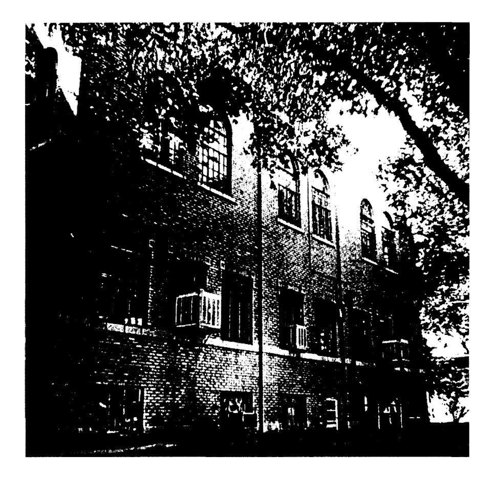
Figure 3: c.1970 Photograph Showing Original Windows

Historic County Courthouses of Kansas Grant County Courthouse District Ulysses, Kansas