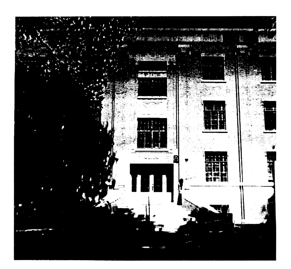
Figure 4: c.1970 Photograph Showing Original Doors

Historic County Courthouses of Kansas Grant County Courthouse District Ulysses, Kansas