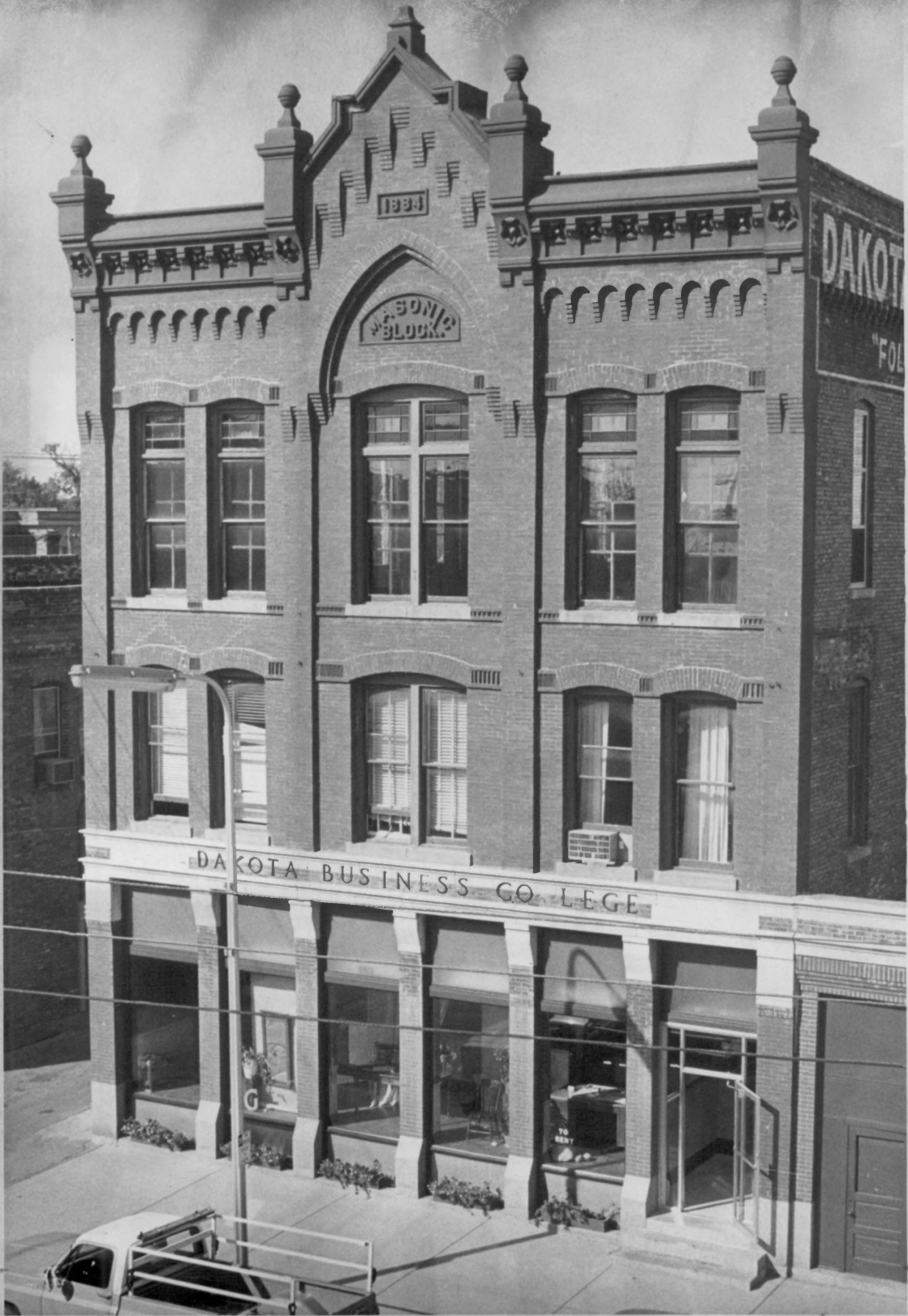
September 9, 1978