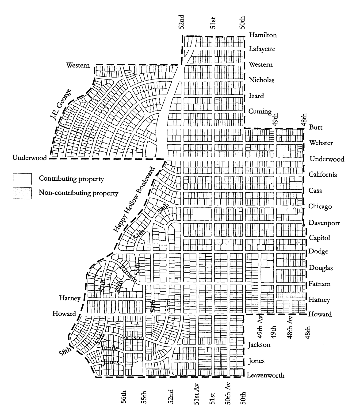
Dundee-Happy Hollow National Register Historic District — — Boundary