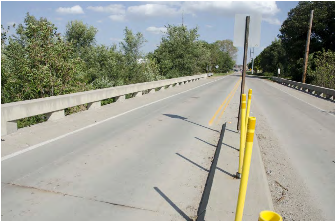
Image 1: Replacement decking and concrete railing of replacement bridge; view east.