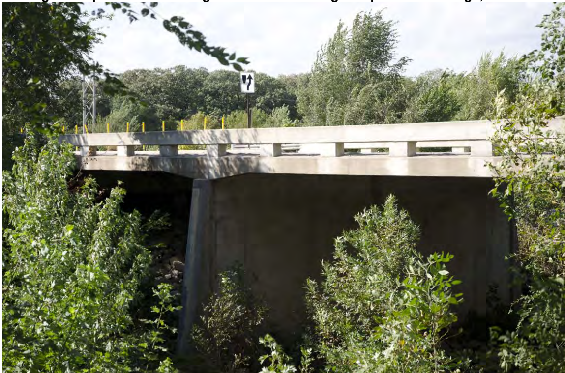
Image 2: Piers and concrete railing of replacement bridge; view northwest.