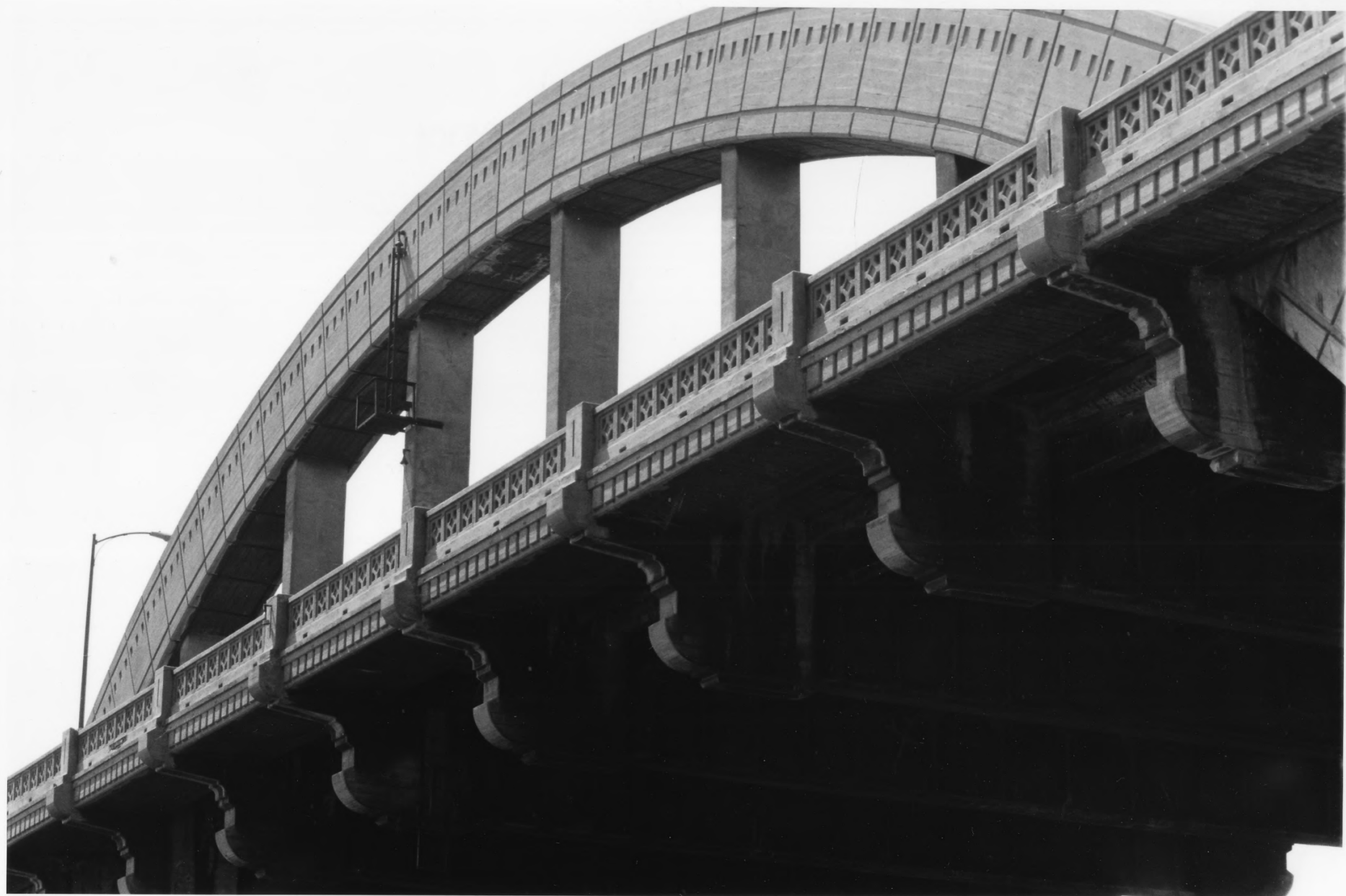
ROBERT STREET BRIDGE, NO. 9036 RAMSEY CO., MN PHOTO I.P. 09970 #14