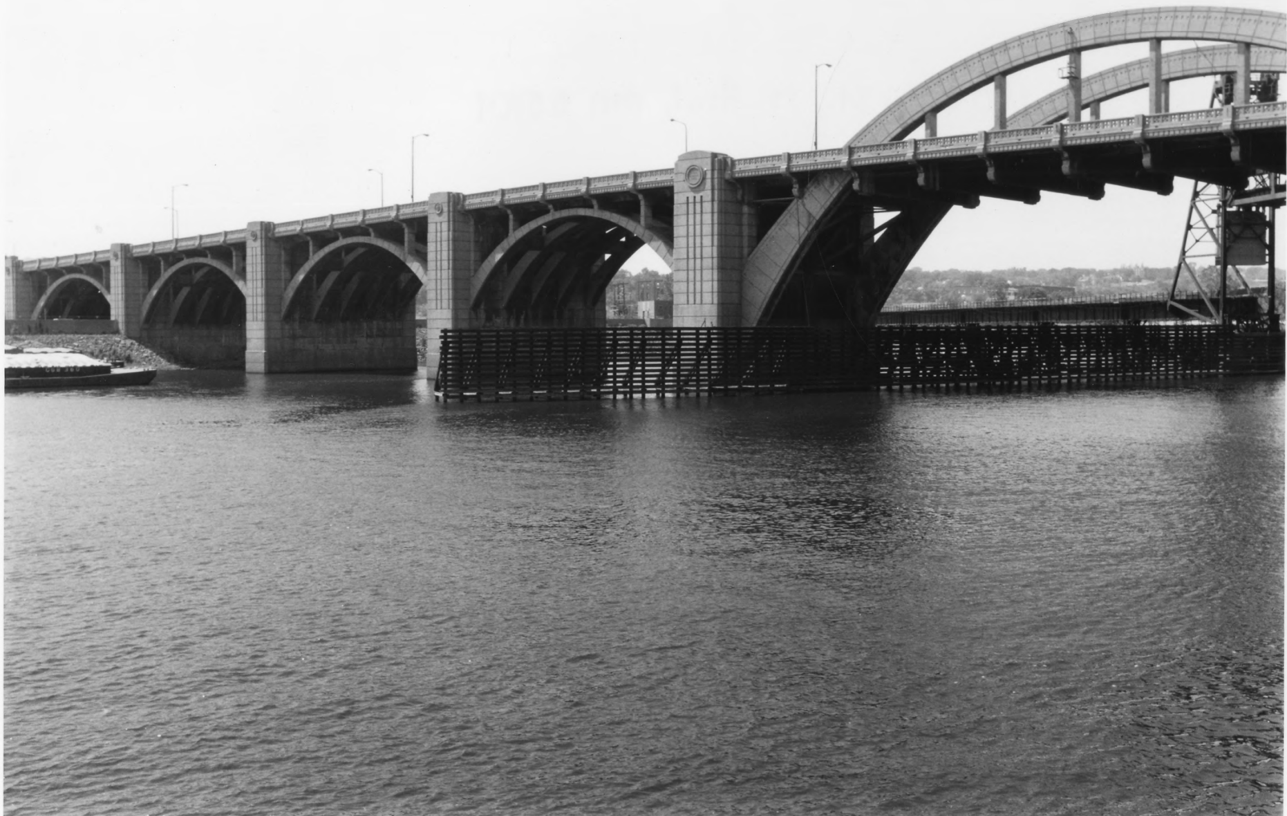
ROBERT STREET BRIDGE, NO. 9036 RAMSEY CO., MN PHOTO I.D. 09970 #4