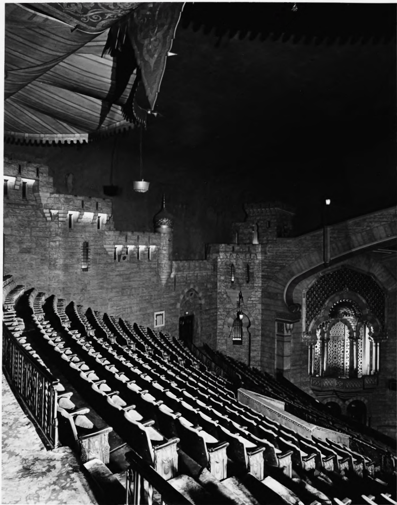
Fox Theatre, Atlanta, Ga.