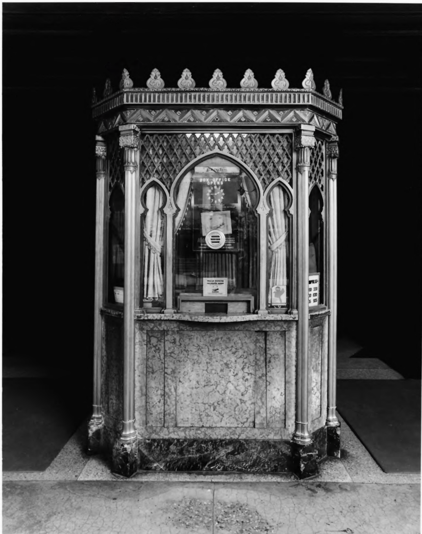
Fox theatre, Atlanta, Ga.