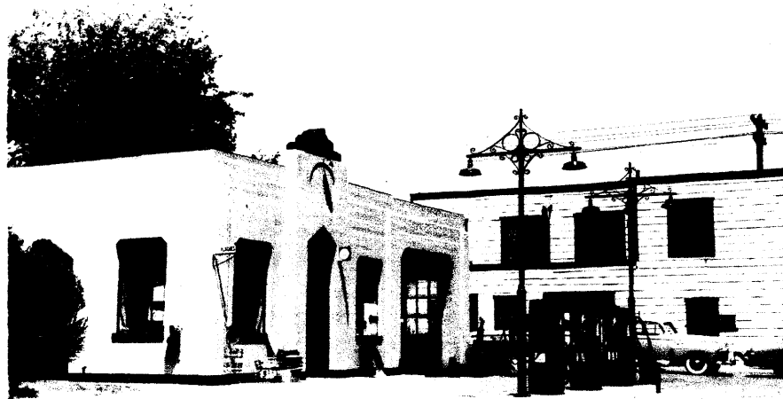
Avant's Cities Service Station

The drive of the station on the east is concrete with a pump island directly east of the station that no longer holds gasoline pumps but does continue to support a canopy which was added at an unknown date. The island and canopy are noncontributing features.