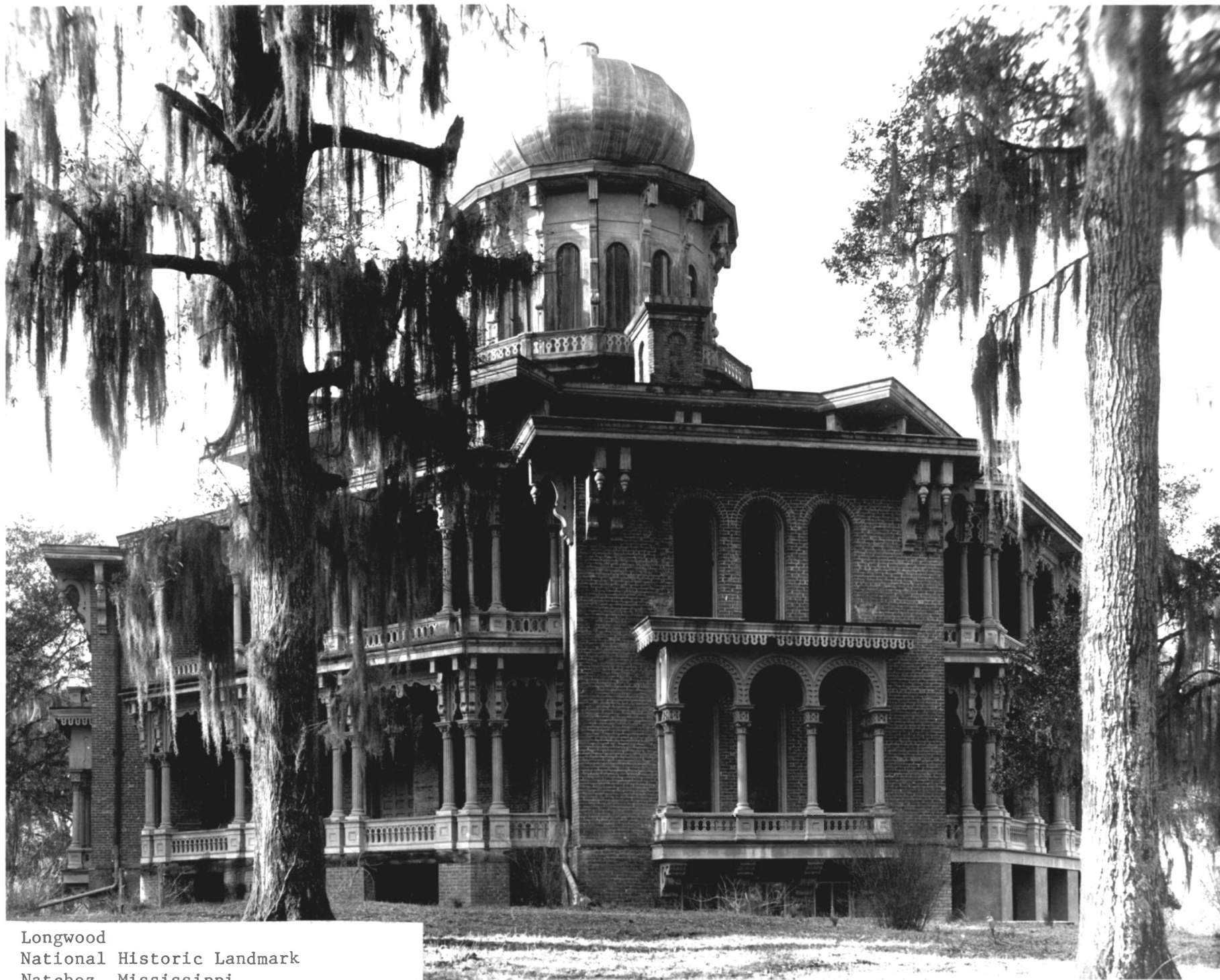
Longwood National Historic Landmark Natchez, Mississippi