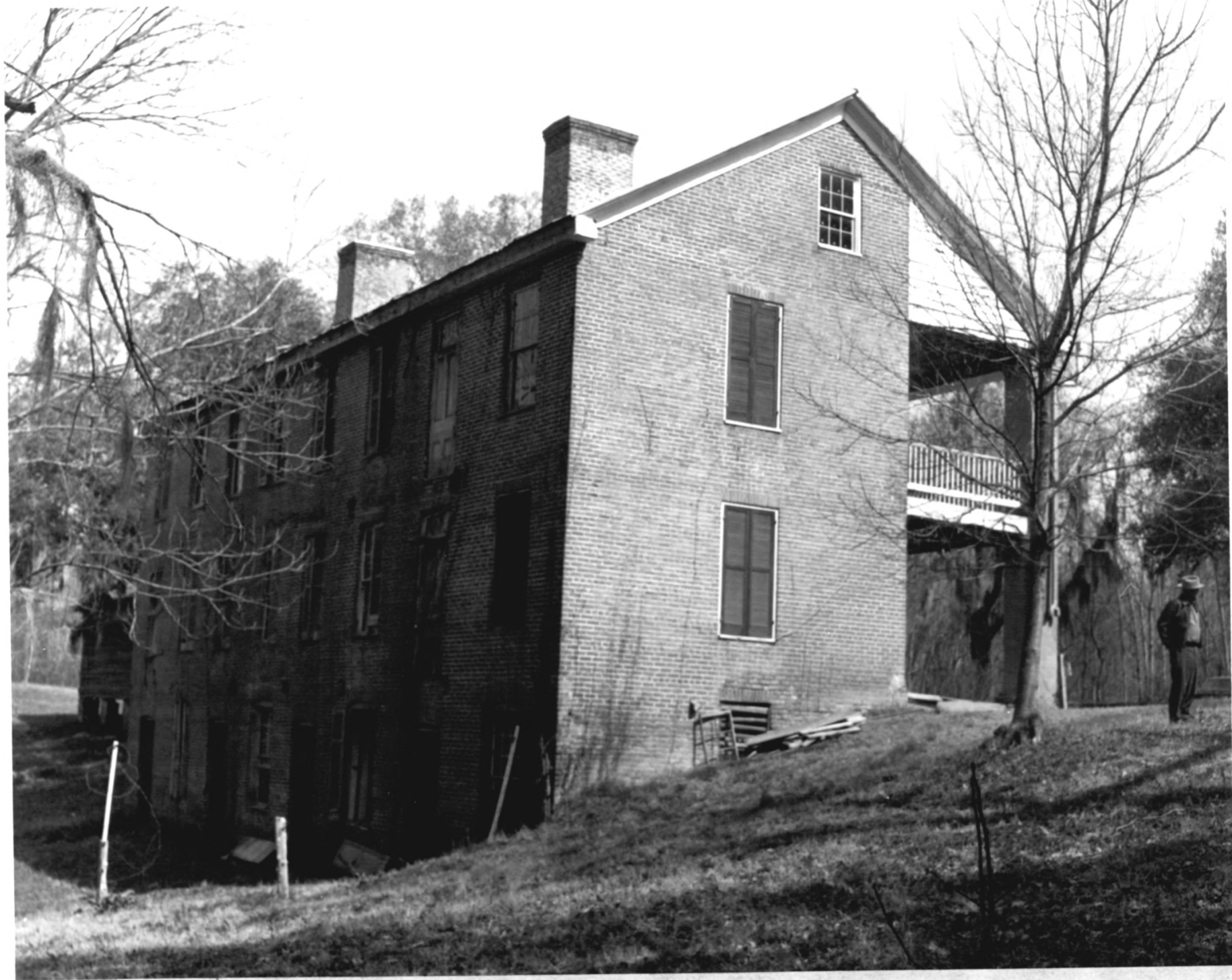
Servants' Quarters, Longwood, Natchez, Mississippi