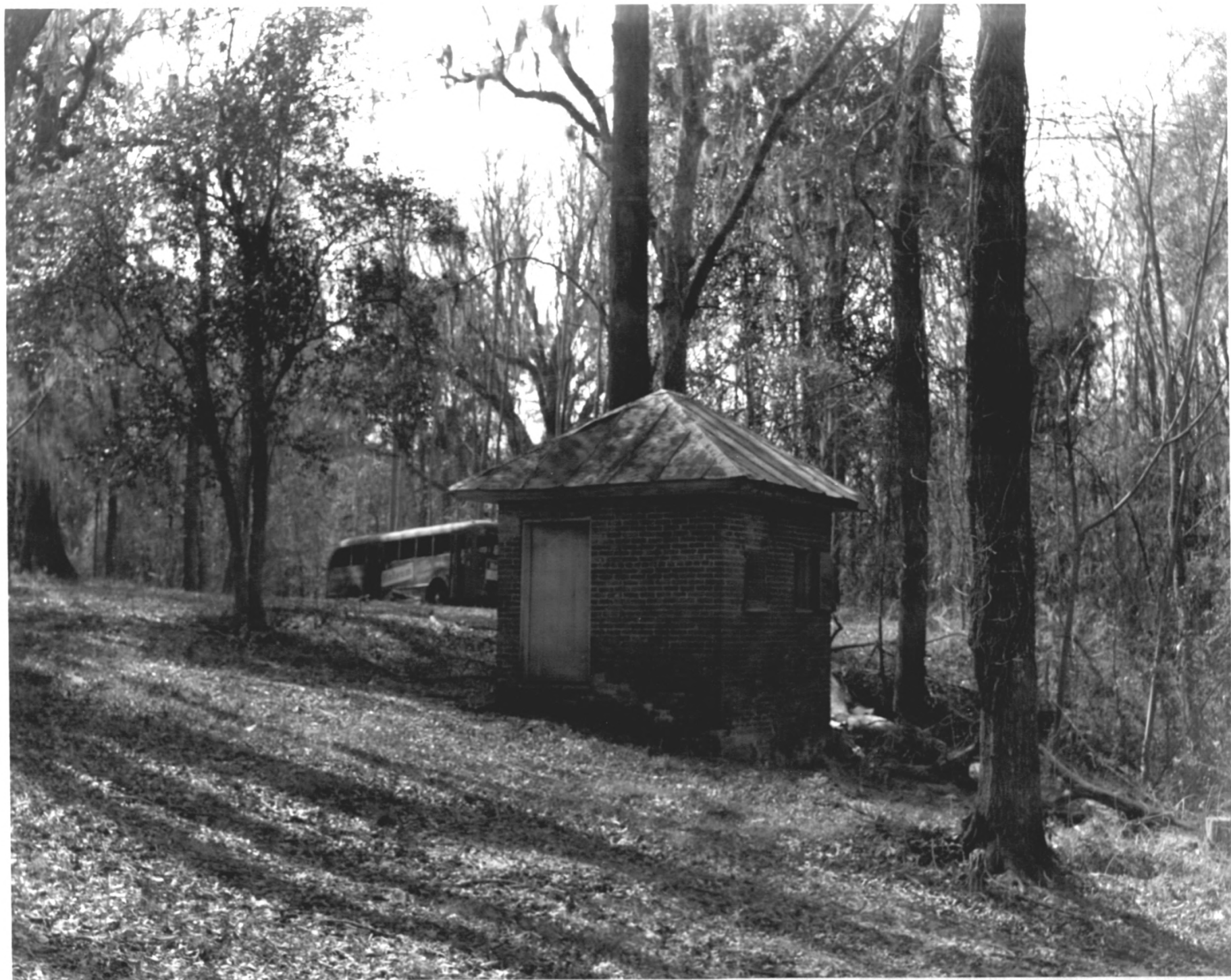
Necessary of Longwood, Natchez, Mississippi