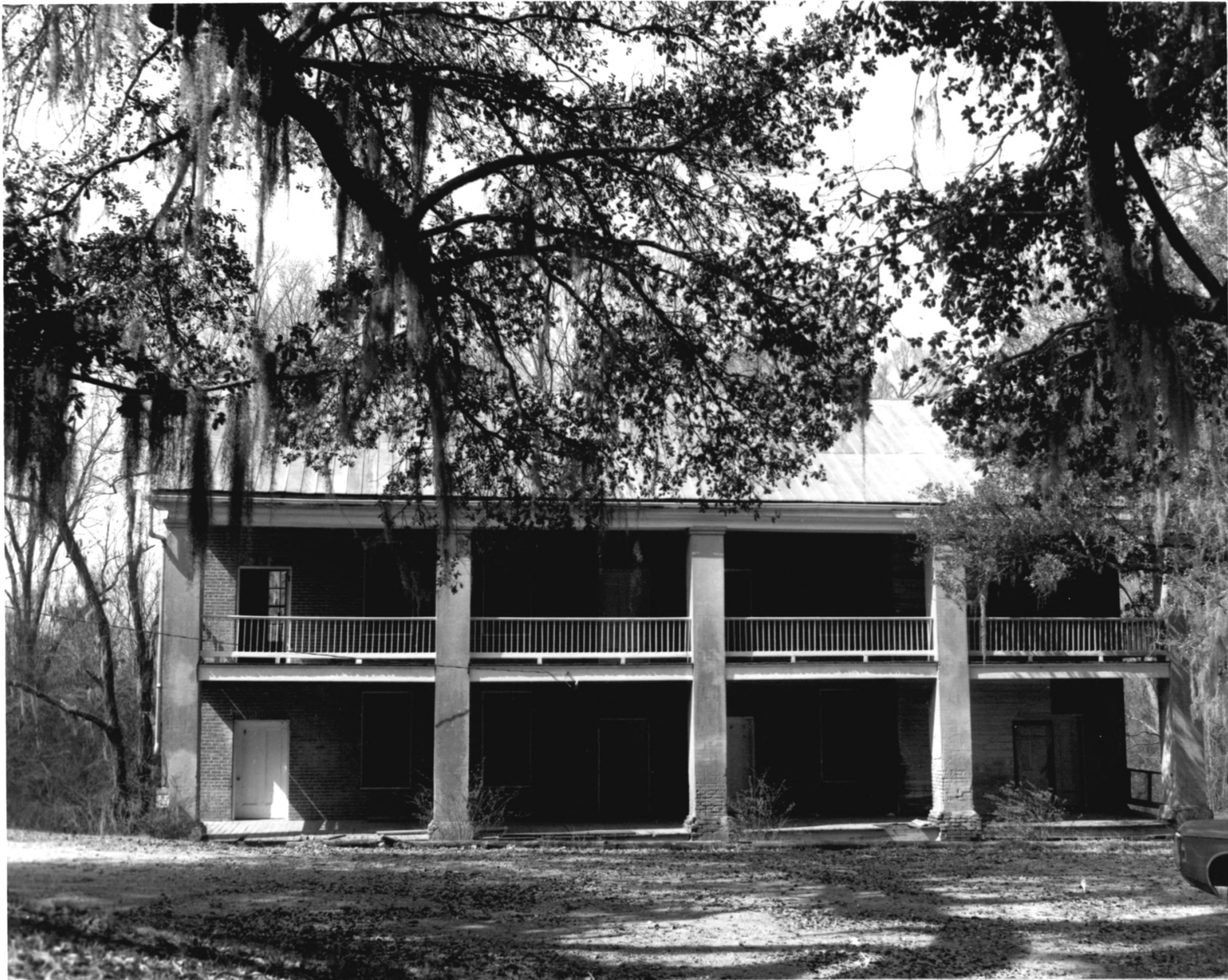
Servants' Quarters, Longwood, Natchez, Mississippi