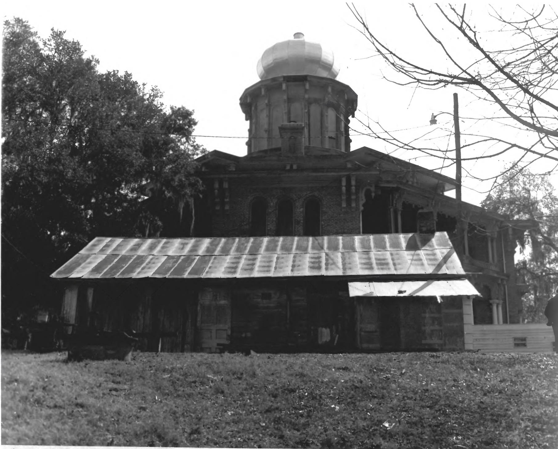
Original Kitchen of Longwood, Natchez, Mississippi.