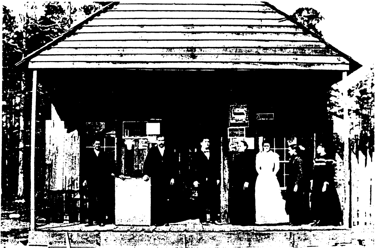
Miller Store as it appeared before early addition of side wings.