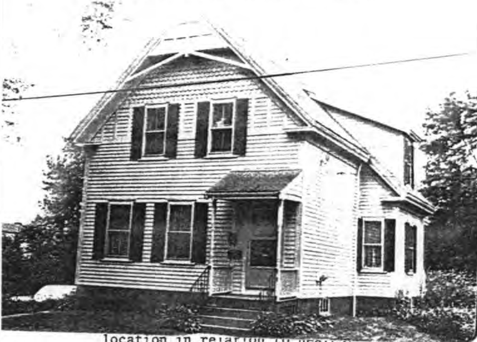
Location in relation to nearest cross streets and other buildings or geographical features. Indicate north.

MASSACHUSETTS HISTORICAL COMMISSION 294 Washington Street, Boston, MA 02108