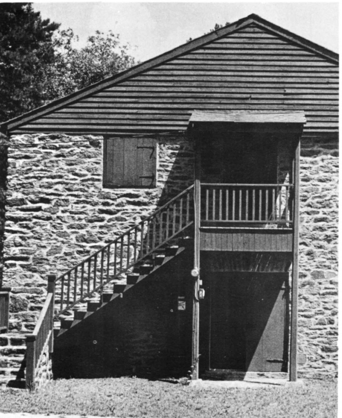
"These Walls Have Tales To Tell"