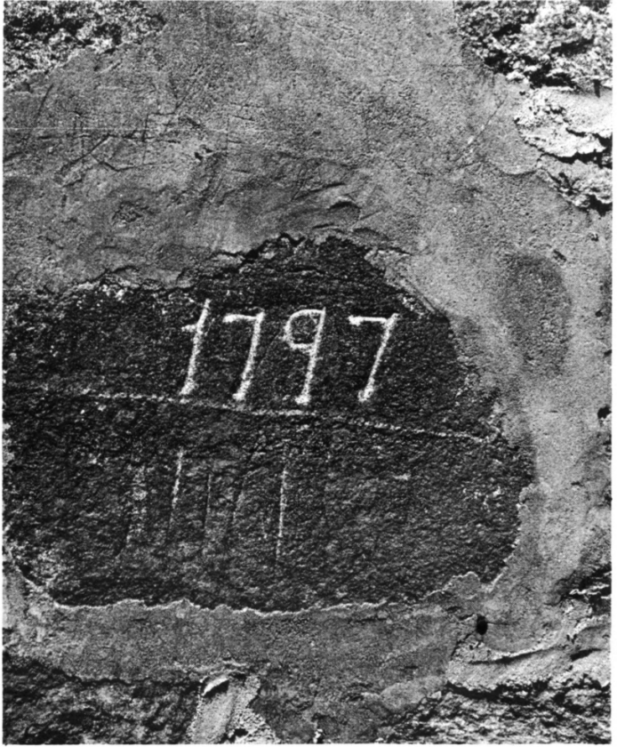
SOUTH CAROLINA MAGAZINE, FEBRUARY 1970