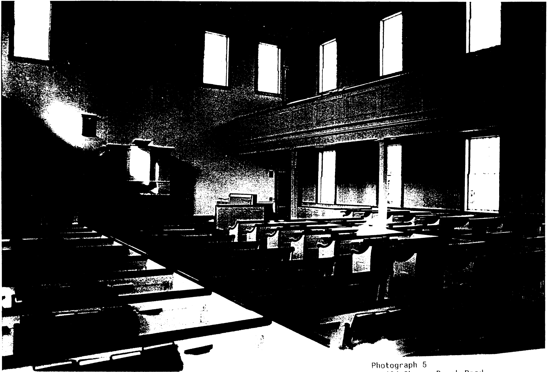
Photograph 5 184 Cherry Brook Road Congregational Church, interior View northwest