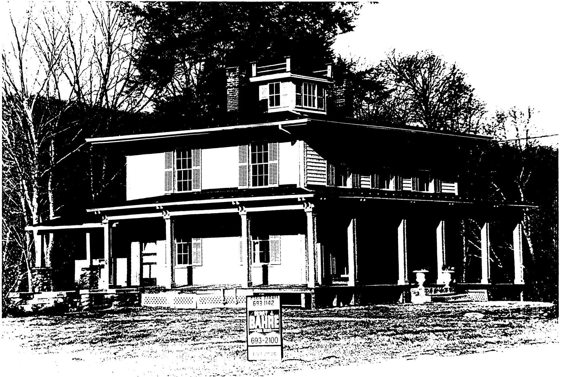
Photograph 1 144 Cherry Brook Road View northwest