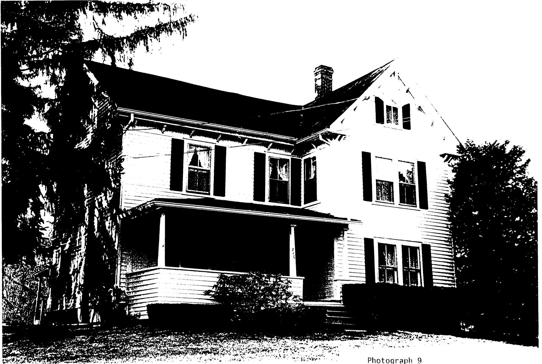
Photograph 9 210 Cherry Brook Road Congregational Church Parsonage View northwest