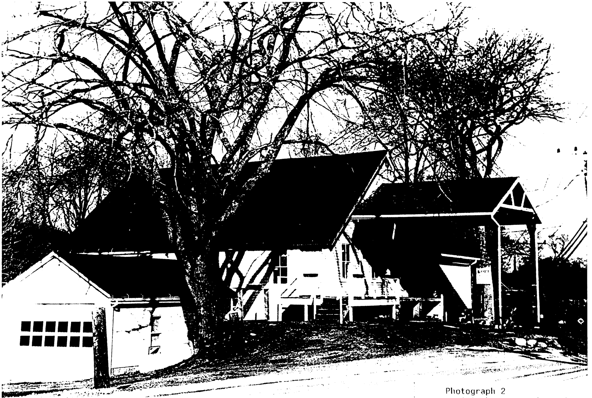
Photograph 2 150 Cherry Brook Road Canton Creamery View northwest