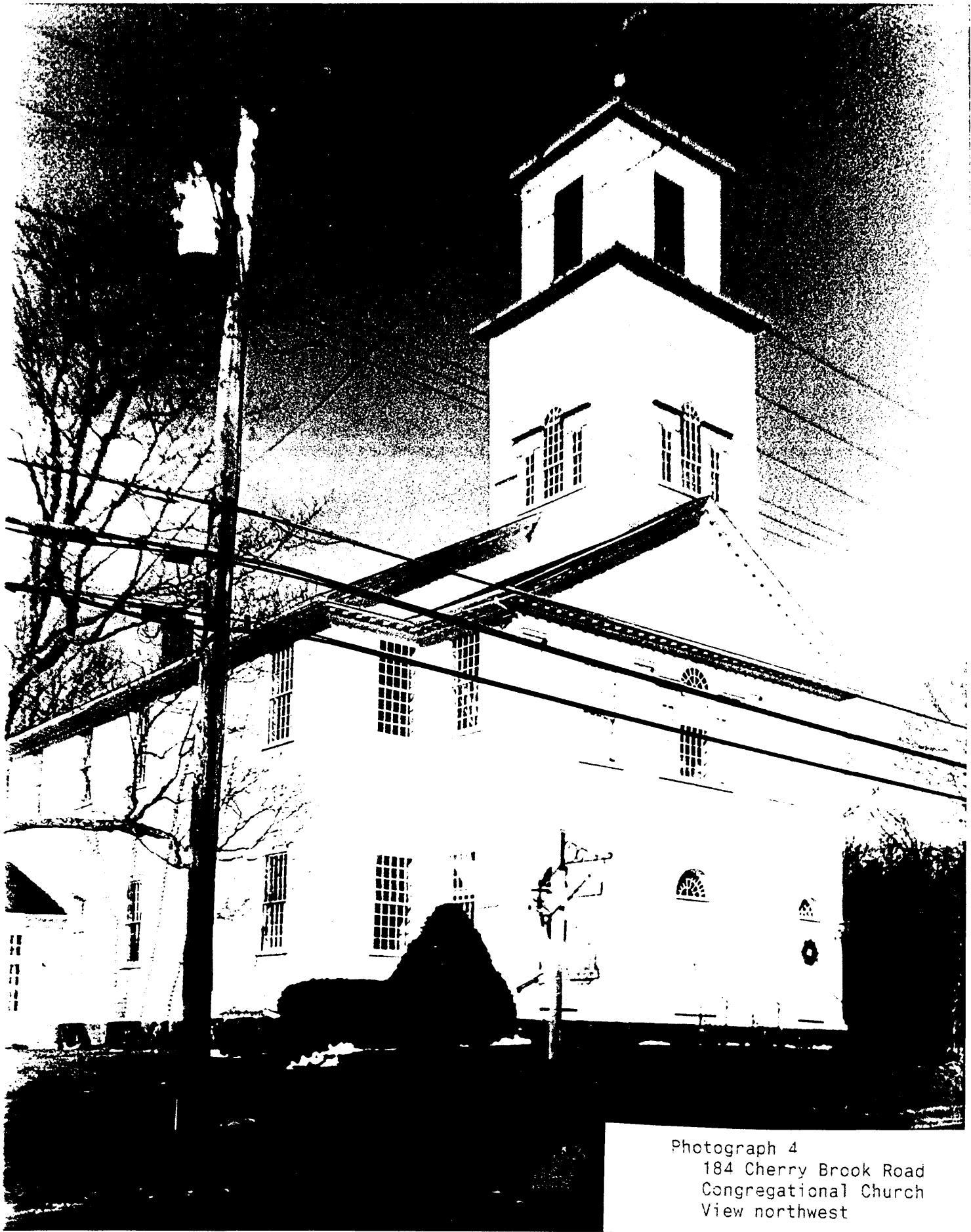
Photograph 4 184 Cherry Brook Road Congregational Church View northwest