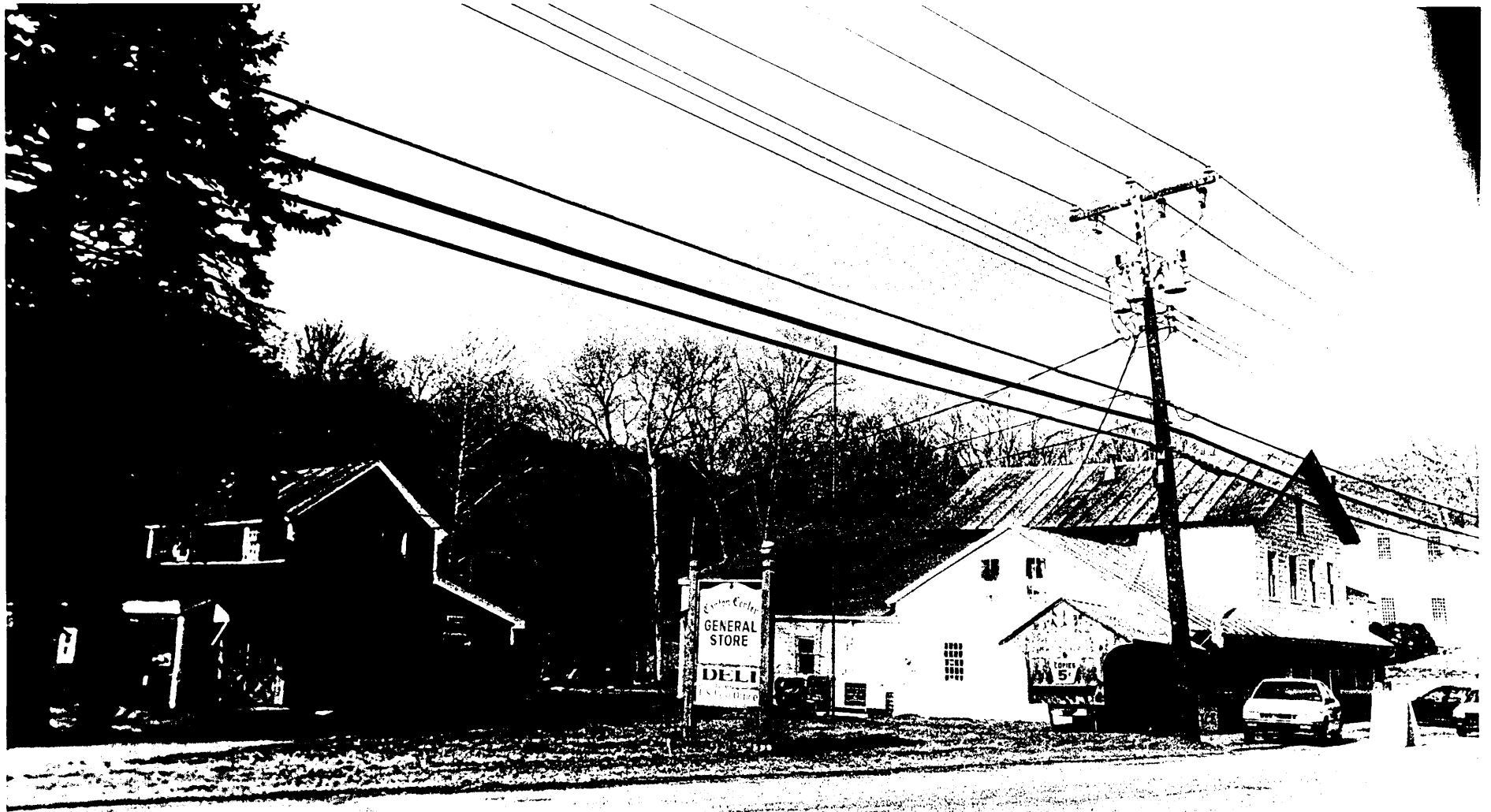
Photograph 3 180 Cherry Brook Road Post Office and Store View northwest