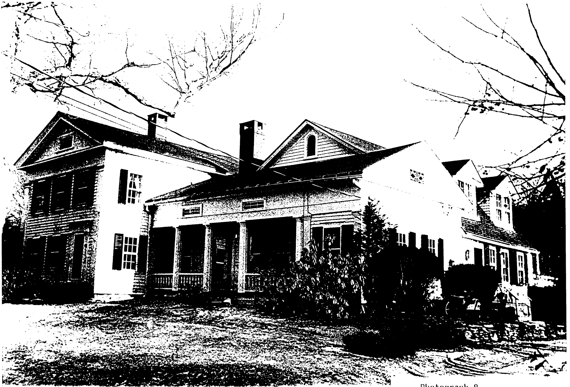
Photograph 8 193 Cherry Brook Road View northeast