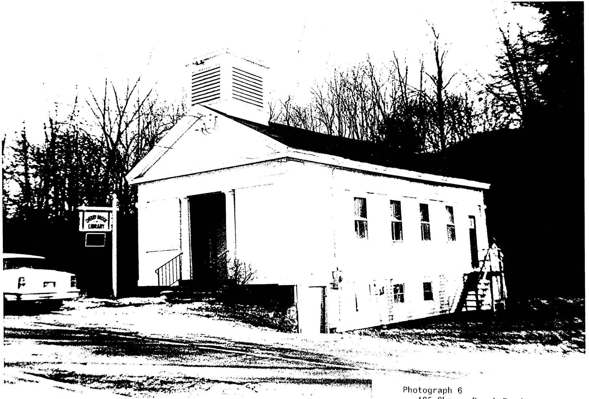
Photograph 6 185 Cherry Brook Road South Center School View northeast