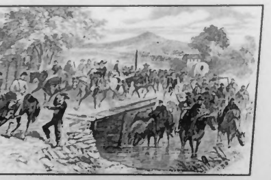
cavalry on their way to the Potomac River.

You are looking at Sugarloaf Mountain, where the running eavalry fight that began in the late afternoon on September 9, 1862, in Barnesville came to a halt. By the next morning, the 7th and 9th Virginia Cavalry had been brought to bay here at the southern base of the mountain by the 8th Illinois and 3rd Indiana Cavalry. Both sides had been reinforced, and each had brought up artillery. Dismounted sharpshooters of the 2nd Virginia Cavalry looked down on the Federals can among the trees and rocks on the slopes of