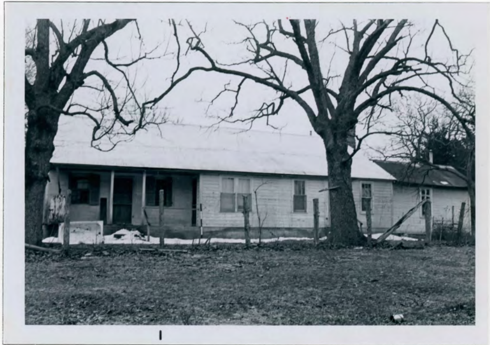
Historic Resources of Stone County Samuel Brown House, ST-123 West Richwoods Viewed from the east