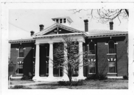
WEBSTER COUNTY COURTHOUSE