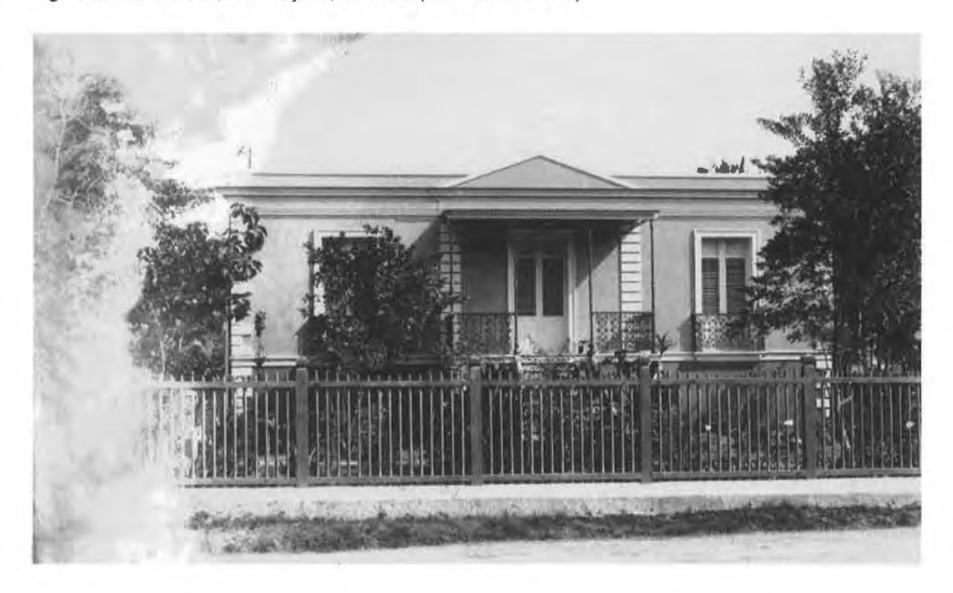
Figure 2. Villa Victoria, main façade, 1910 ca.