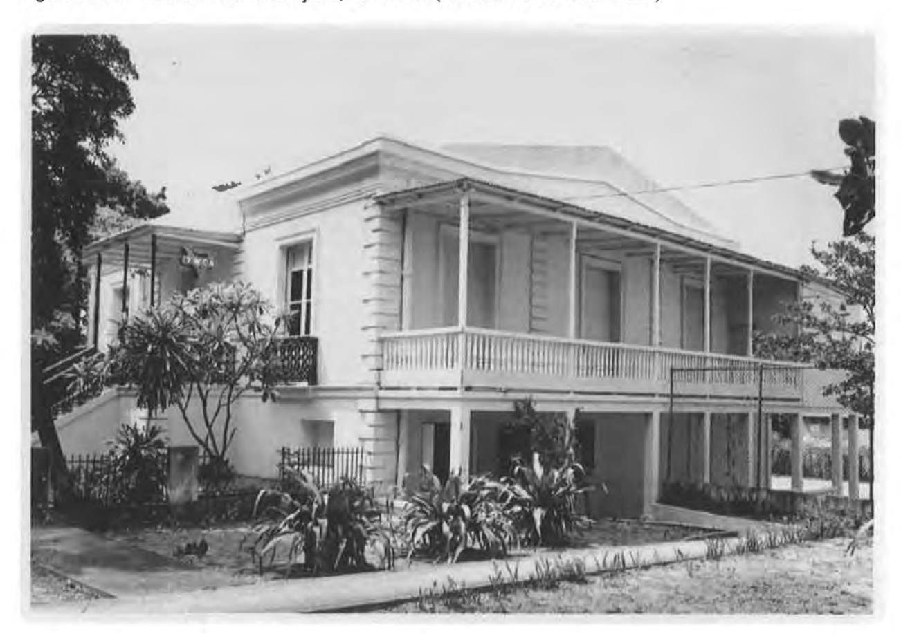
Figure 4. Villa Victoria's eastern façade, 1960s ca.