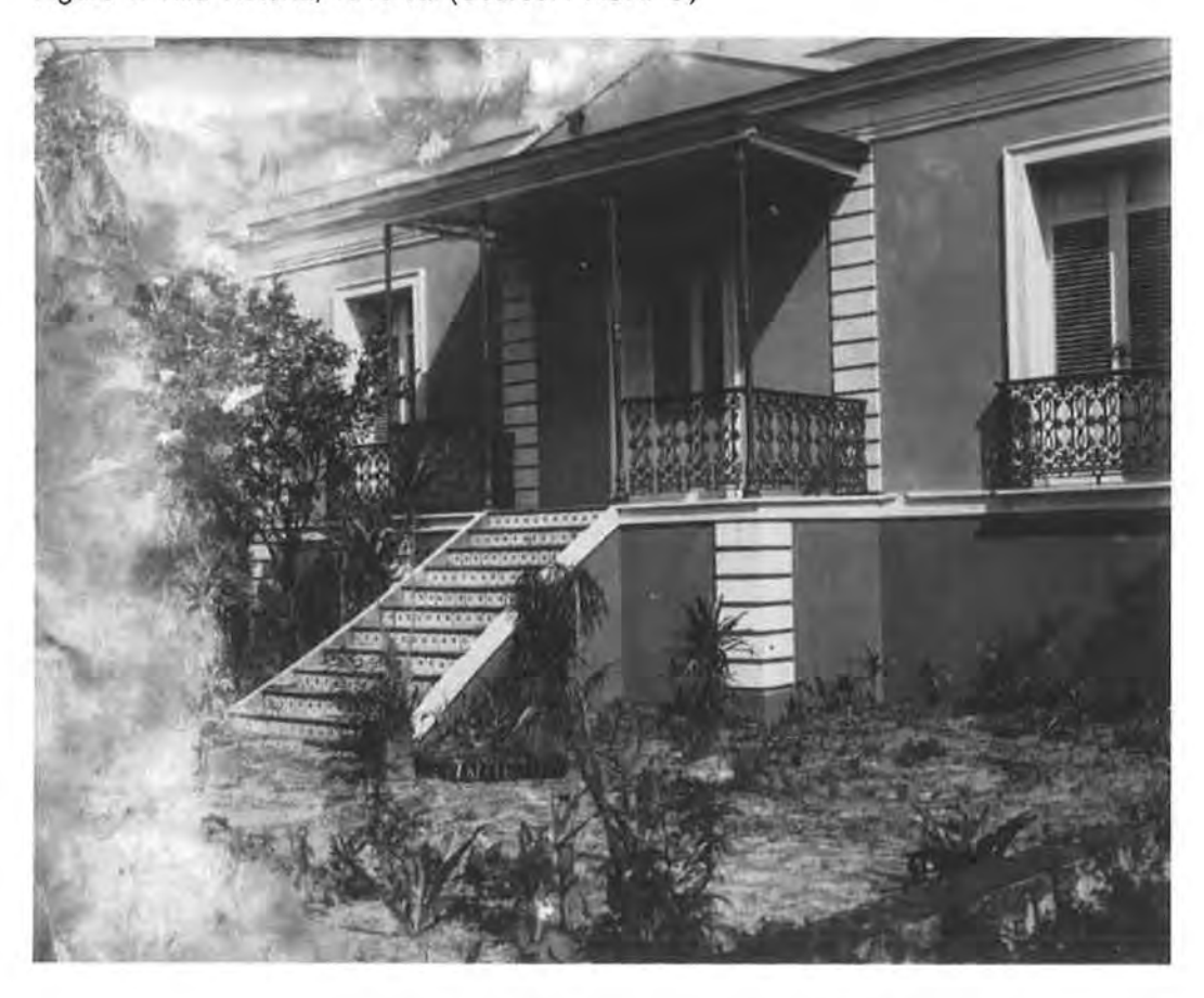
Figure 1. Villa Victoria, 1910 ca.