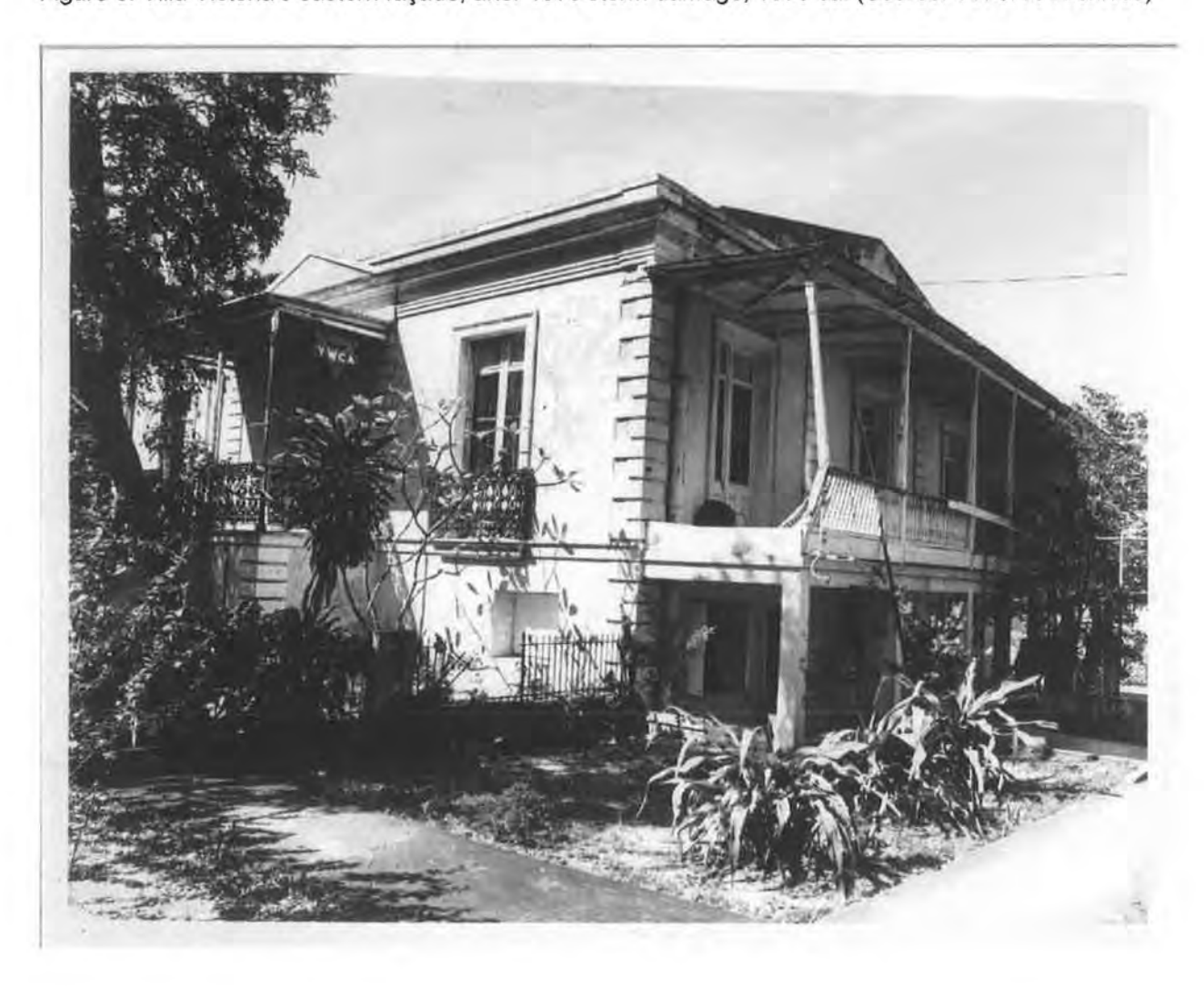
Figure 5. Villa Victoria's eastern façade, after 1979'storm damage; 1979 ca.