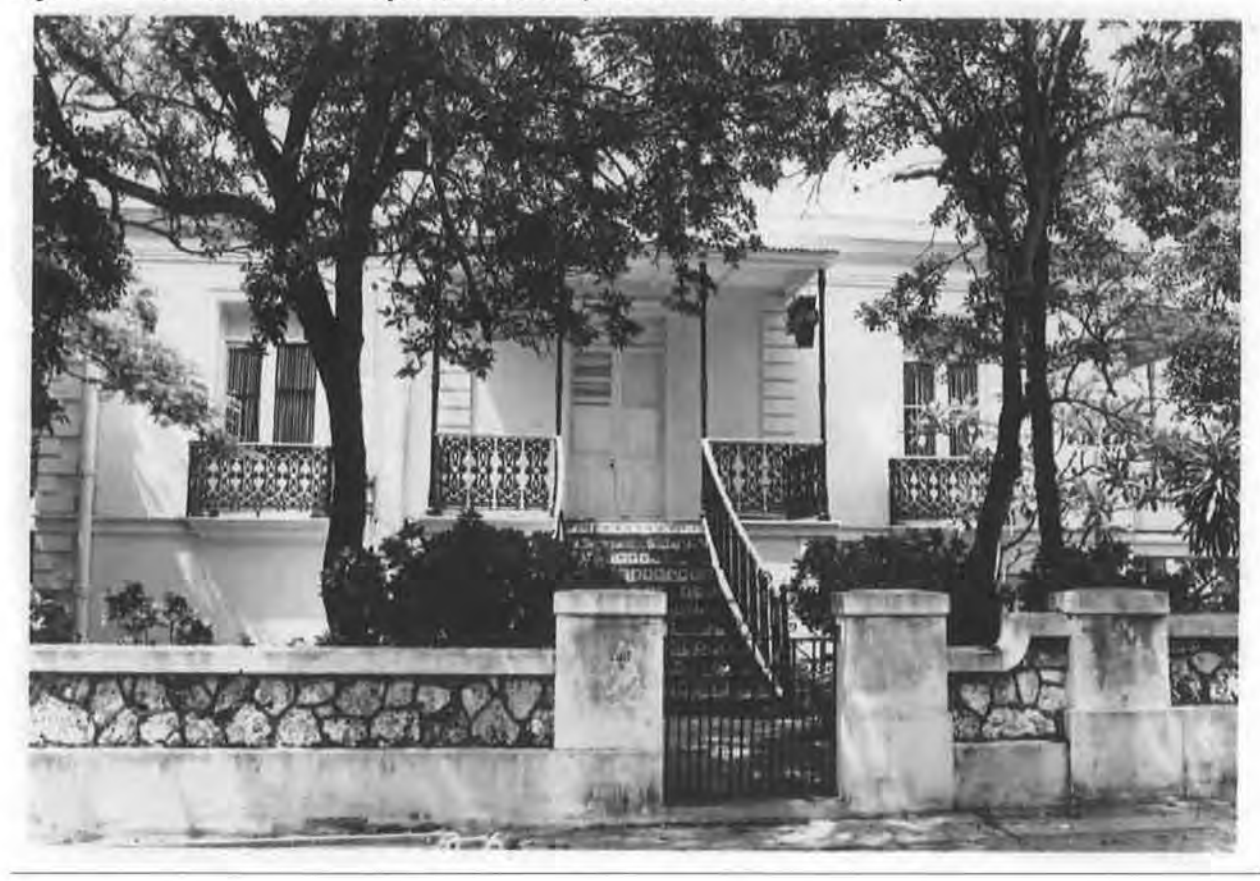
Figure 3. Villa Victoria's main façade, 1960s ca.