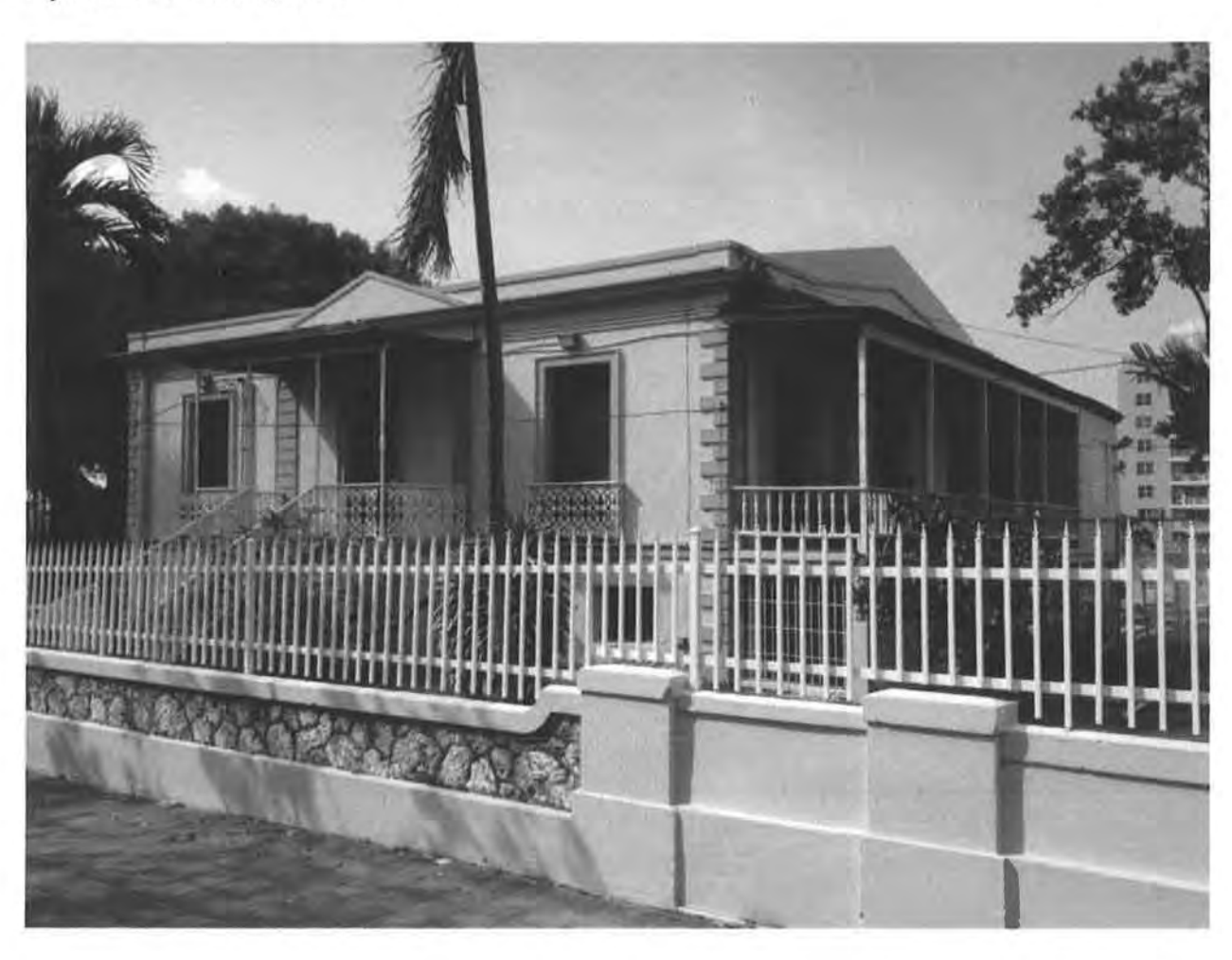
Figure 6. Villa Victoria, 2014.