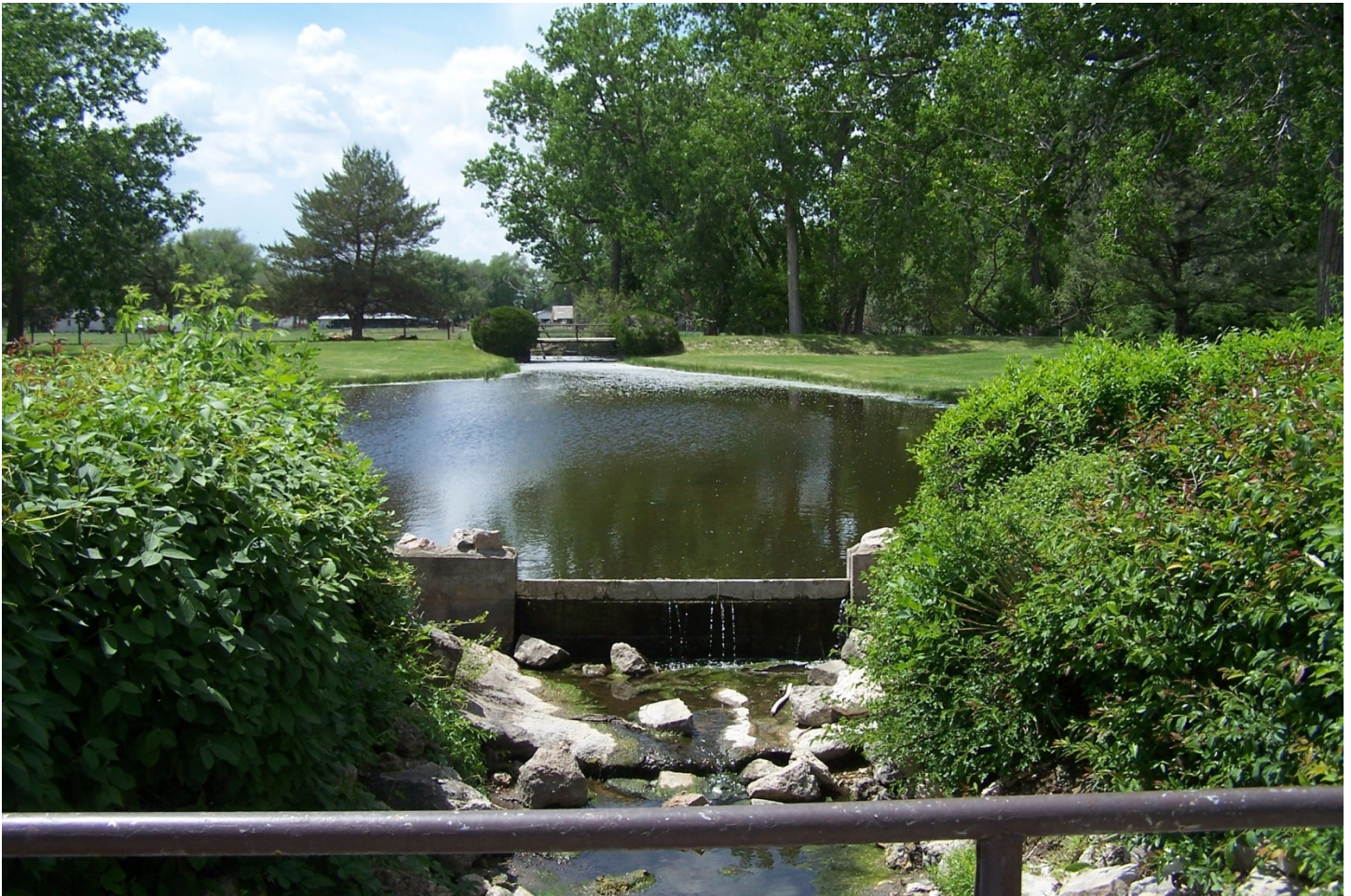
SCOUT'S REST RANCH HEADQUARTERS, North Platte, Nebraska Diversion Dam and Diversion Pond

National Register of Historic Places Registration Form