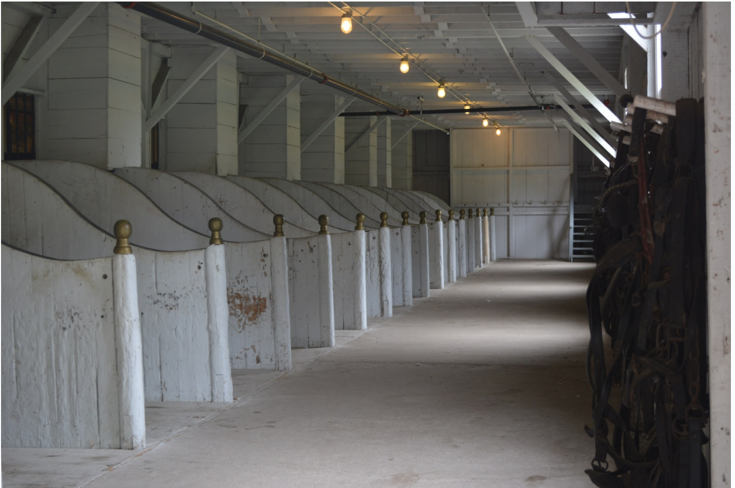
SCOUT'S REST RANCH HEADQUARTERS, North Platte, Nebraska Horse Barn first floor interior, horse stalls

National Register of Historic Places Registration Form