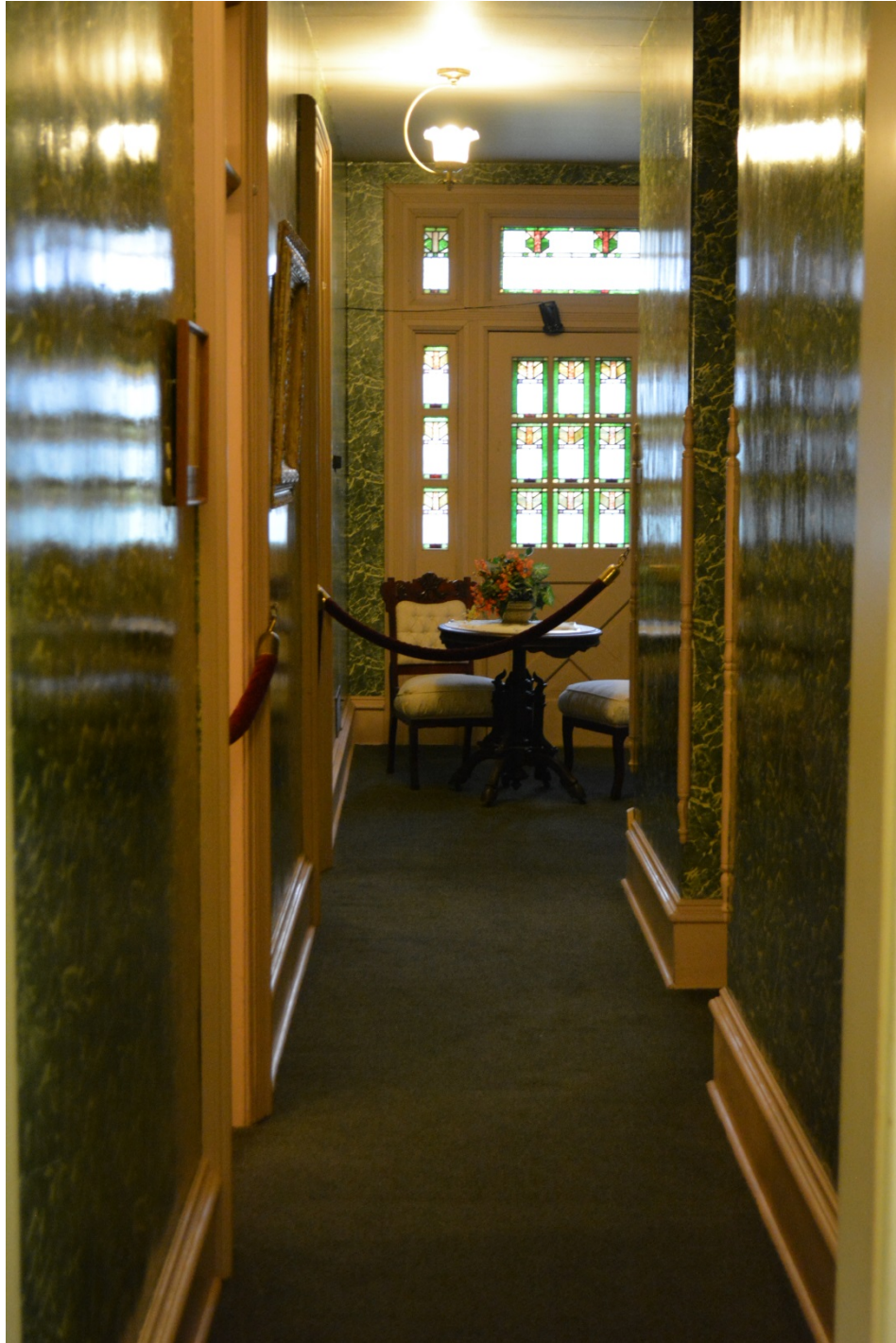
SCOUT'S REST RANCH HEADQUARTERS, North Platte, Nebraska Upstairs hall looking south towards door onto second story porch.

National Register of Historic Places Registration Form