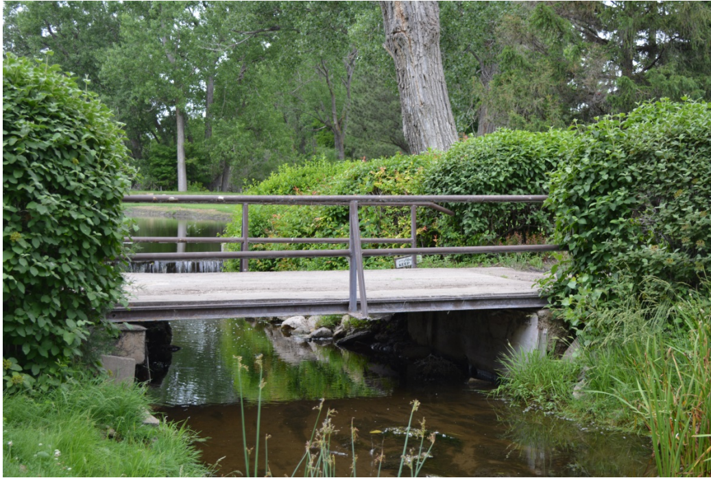
SCOUT'S REST RANCH HEADQUARTERS, North Platte, Nebraska

National Register of Historic Places Registration Form