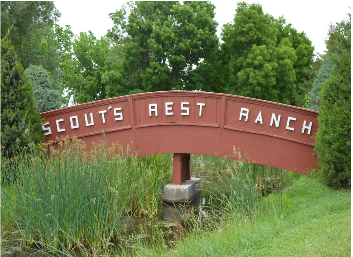
SCOUT'S REST RANCH HEADQUARTERS, North Platte, Nebraska Wooden Arch Footbridge Photo by Hannah Braun, June 2015

National Register of Historic Places Registration Form