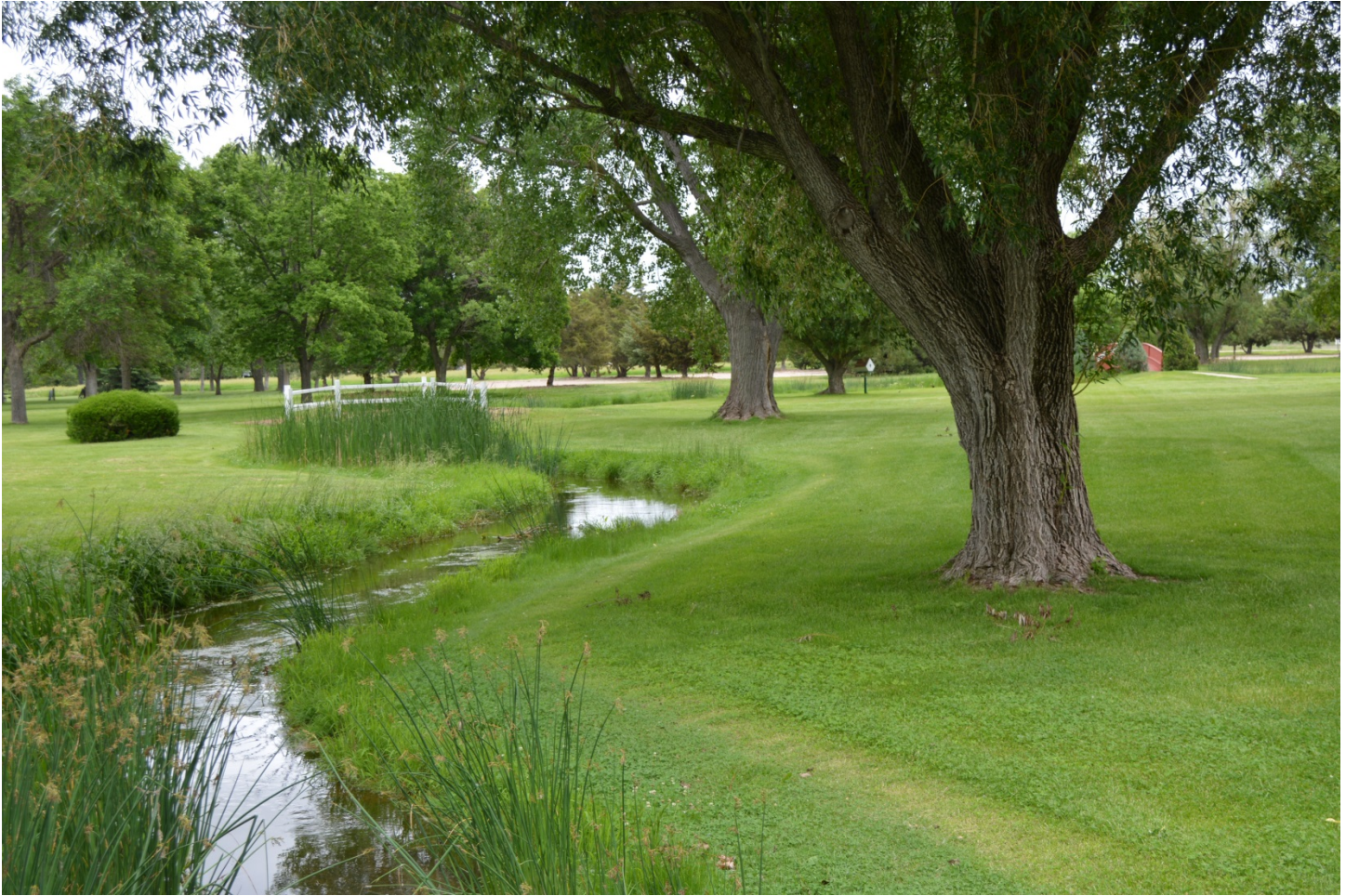
SCOUT'S REST RANCH HEADQUARTERS, North Platte, Nebraska Scout Creek with Concrete/Earthen Footbridge in distance Photo by Hannah Braun, June 2015

National Register of Historic Places Registration Form