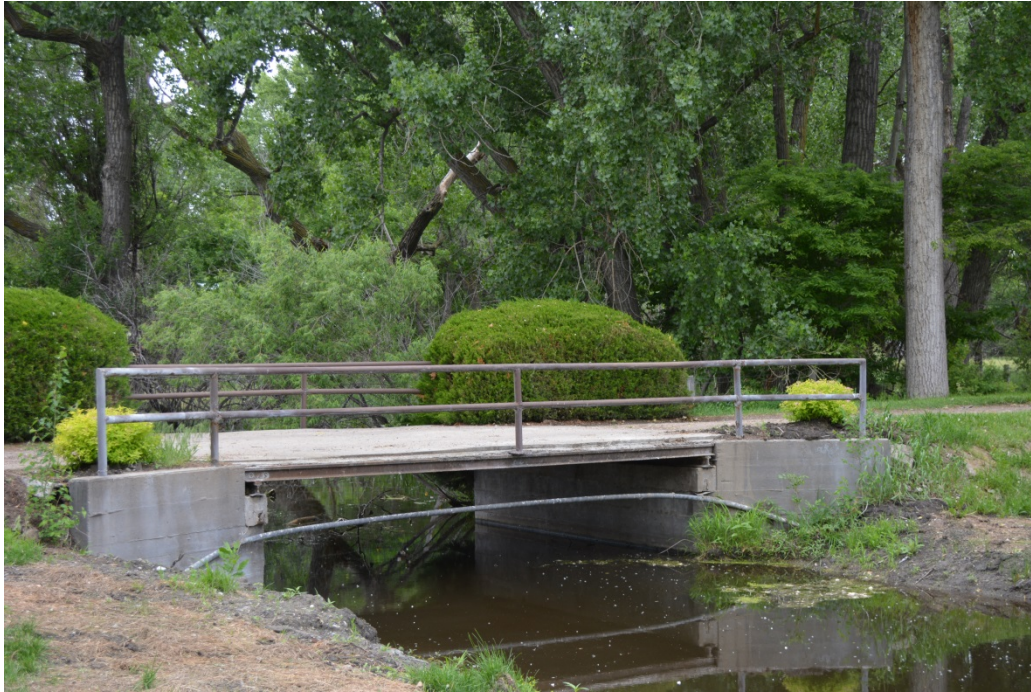
SCOUT'S REST RANCH HEADQUARTERS, North Platte, Nebraska West End Pond Bridge Photo by Hannah Braun, June 2015

National Register of Historic Places Registration Form