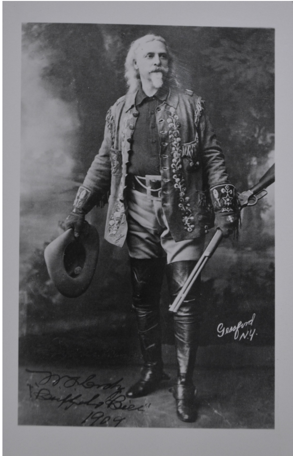
Figure 5: SCOUT'S REST RANCH HEADQUARTERS, North Platte, Nebraska William F. "Buffalo Bill" Cody, ca. 1909.

National Register of Historic Places Registration Form