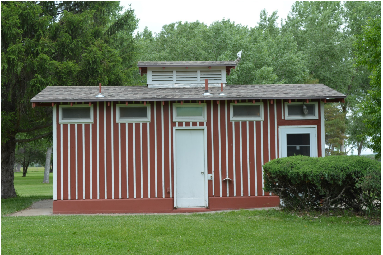
SCOUT'S REST RANCH HEADQUARTERS, North Platte, Nebraska Comfort Station, south façade Photo by Hannah Braun, June 2015

National Register of Historic Places Registration Form