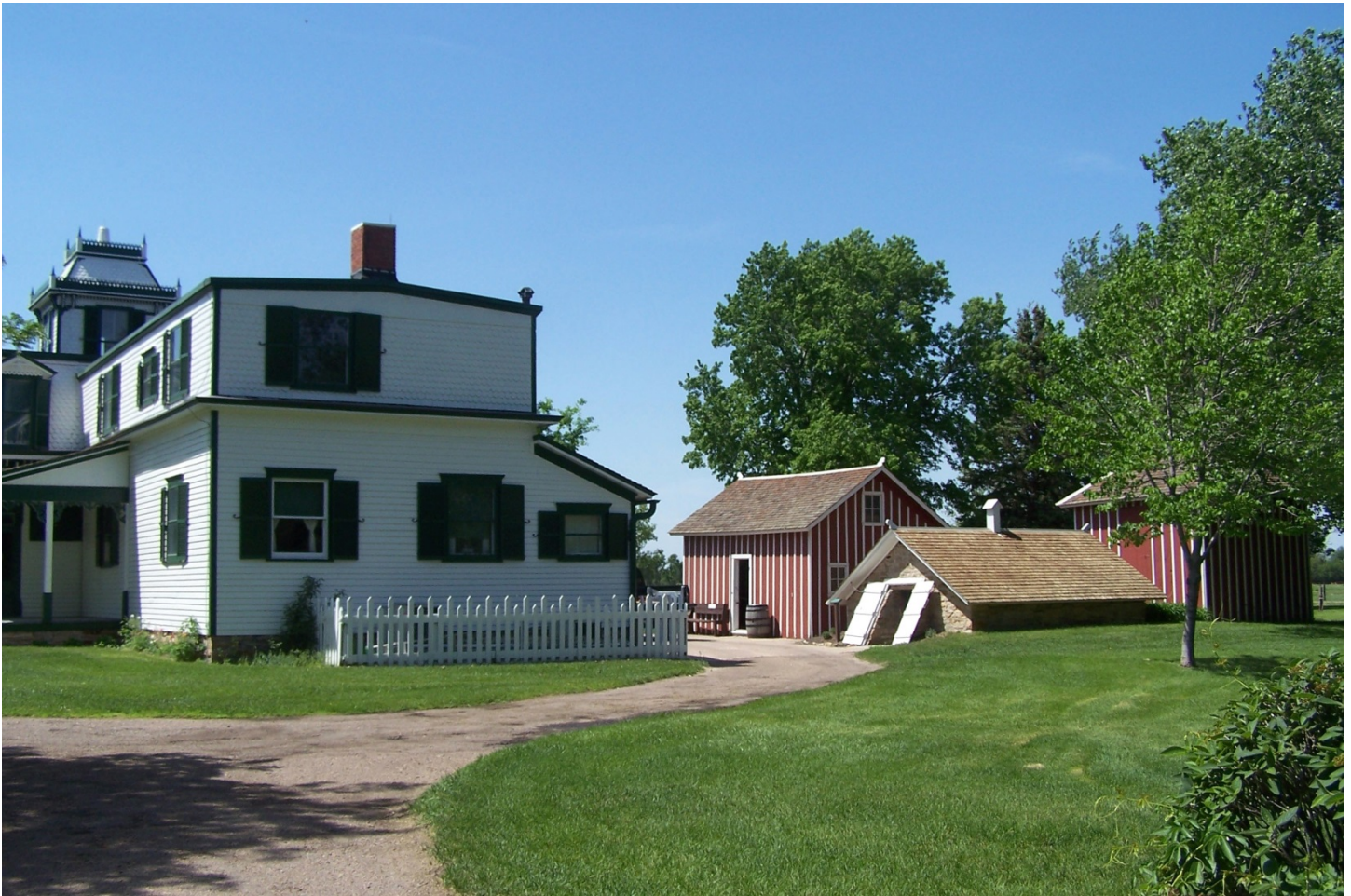
SCOUT'S REST RANCH HEADQUARTERS, North Platte, Nebraska Left to right: Ranch House north (rear) elevation; Cob House; Springhouse/Cellar and Ice House

National Register of Historic Places Registration Form