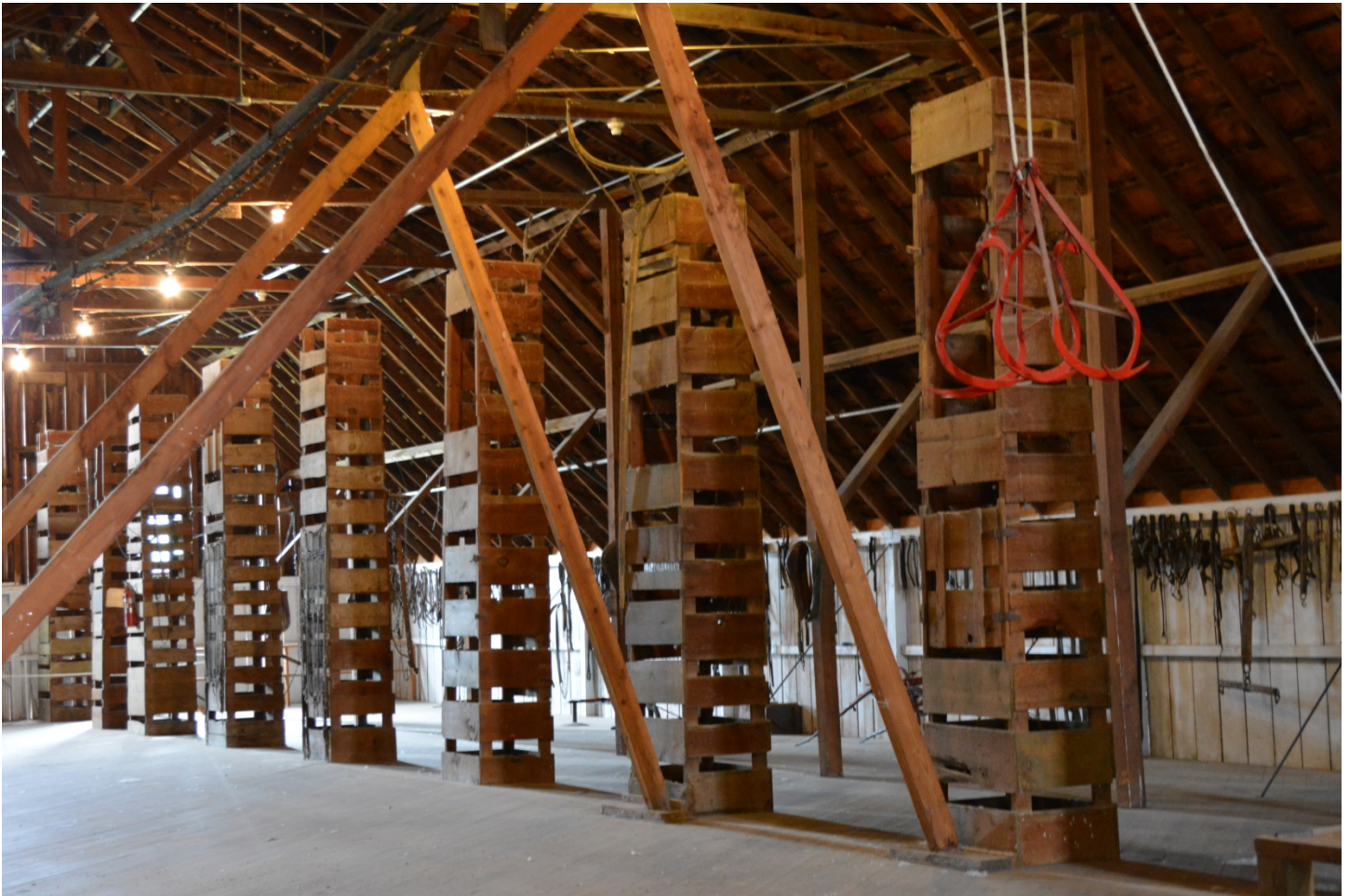
SCOUT'S REST RANCH HEADQUARTERS, North Platte, Nebraska Horse Barn second floor interior, hay storage and chutes Photo by Hannah Braun, June 2015

National Register of Historic Places Registration Form