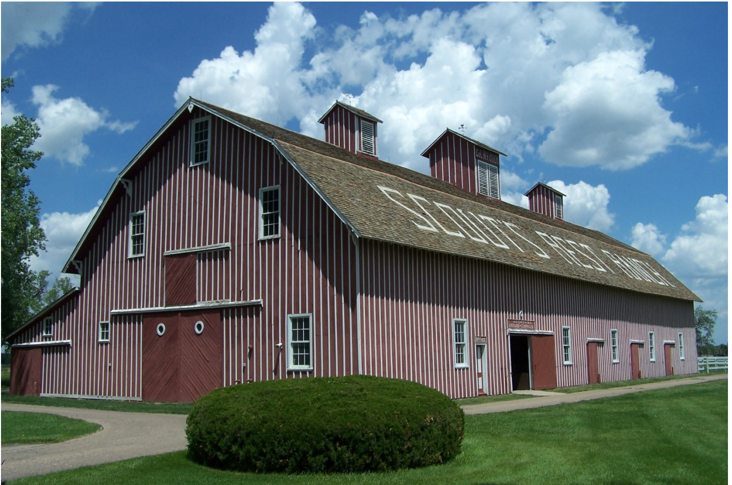
SCOUT'S REST RANCH HEADQUARTERS, North Platte, Nebraska Horse barn, west (main) façade and south elevation Photo by Hannah Braun, May 2014

National Register of Historic Places Registration Form