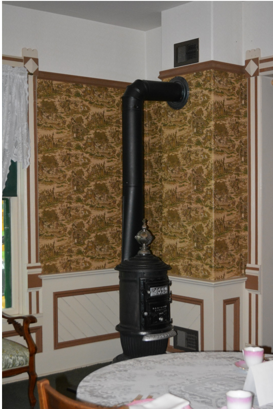
SCOUT'S REST RANCH HEADQUARTERS, North Platte, Nebraska Dining Room Photo by Hannah Braun, June 2015

National Register of Historic Places Registration Form