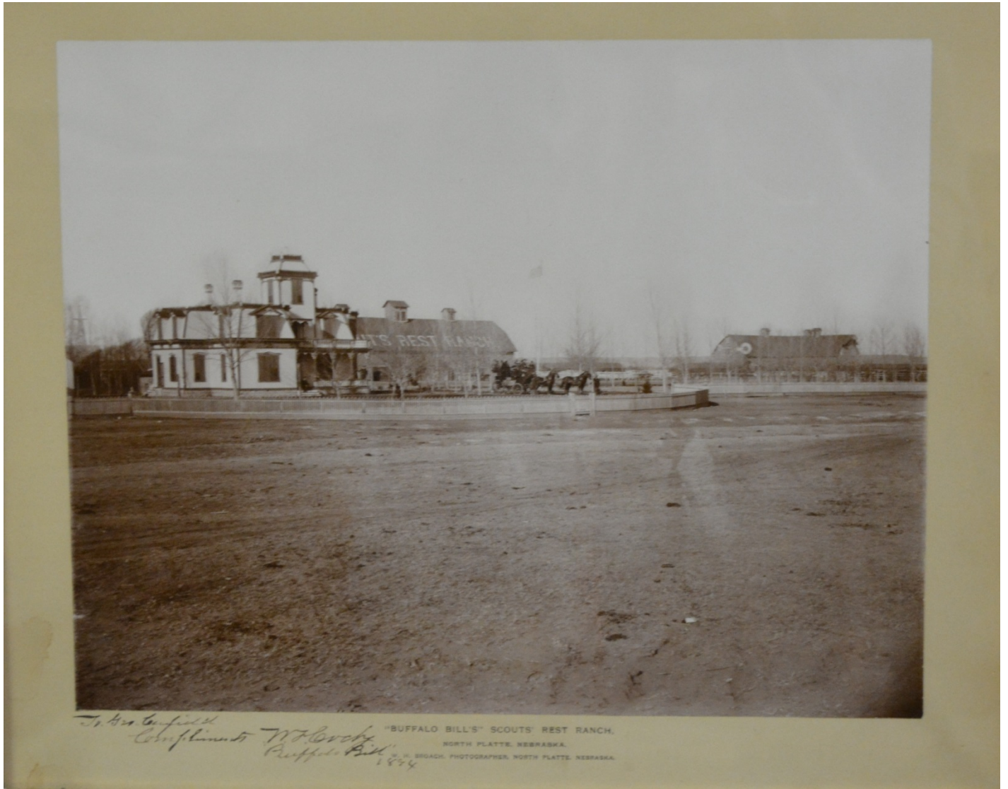
Figure 2: SCOUT'S REST RANCH HEADQUARTERS, North Platte, Nebraska Ranch house, horse barn, T barn, and yard, ca. 1894.

National Register of Historic Places Registration Form