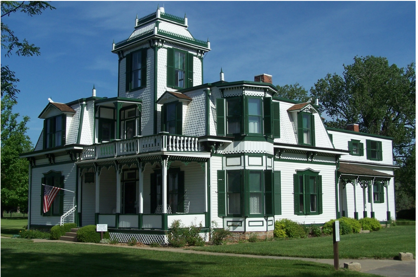
SCOUT'S REST RANCH HEADQUARTERS, North Platte, Nebraska Ranch House, south (main) façade and east elevation Photo by Hannah Braun, May 2014

National Register of Historic Places Registration Form