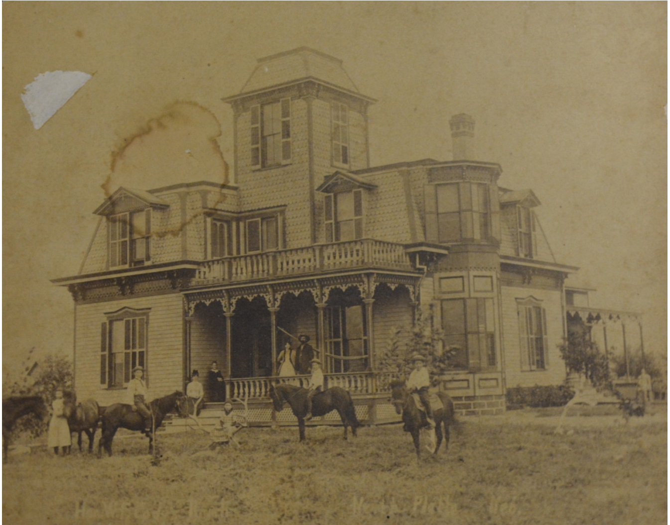
Figure 1: SCOUT'S REST RANCH HEADQUARTERS, North Platte, Nebraska Main ranch house, front (south) elevation, ca. 1887–1900.

National Register of Historic Places Registration Form