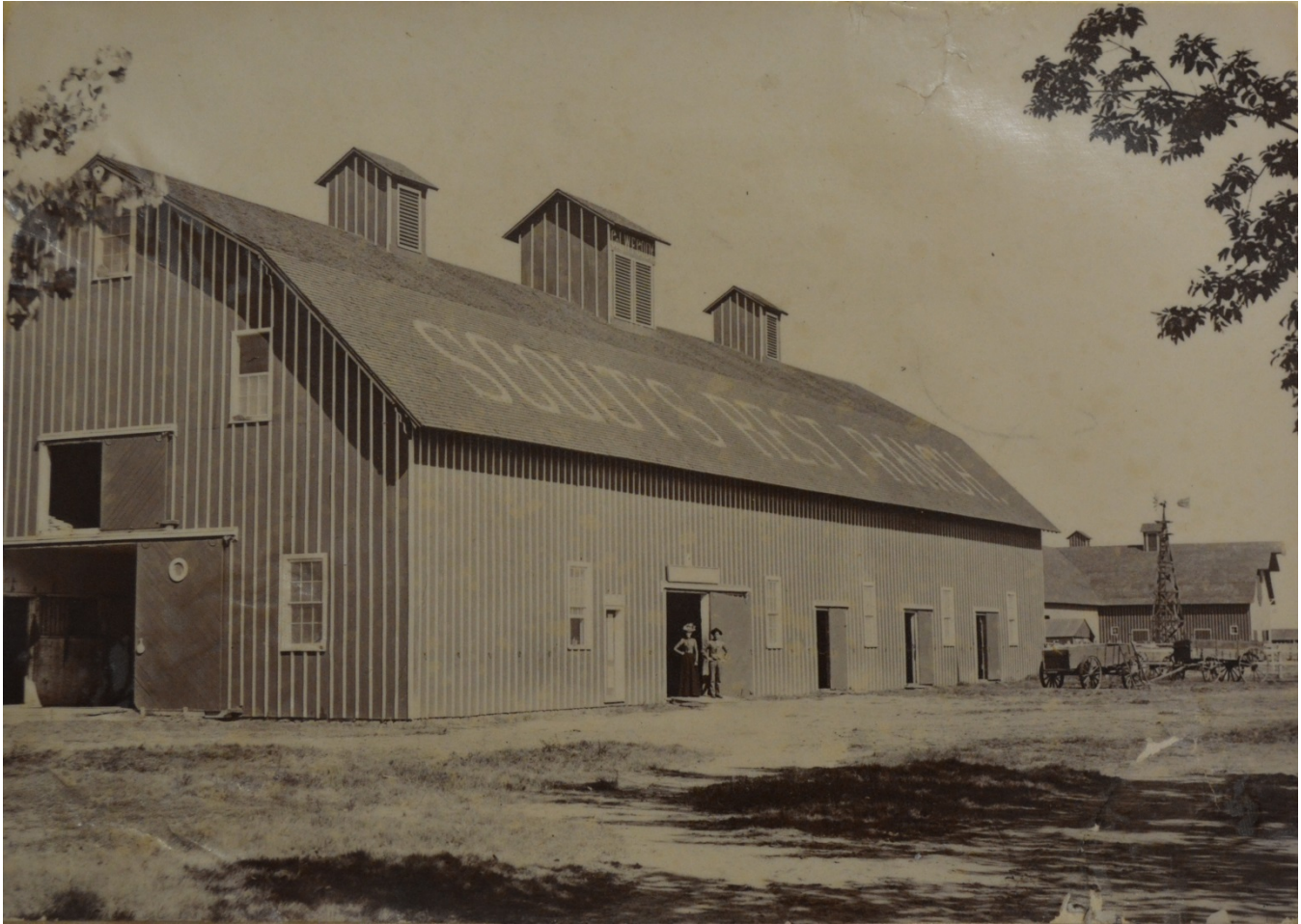
Figure 3: SCOUT'S REST RANCH HEADQUARTERS, North Platte, Nebraska West and south elevations of the horse barn with T barn and windmill beyond, ca. 1891–1904.

National Register of Historic Places Registration Form