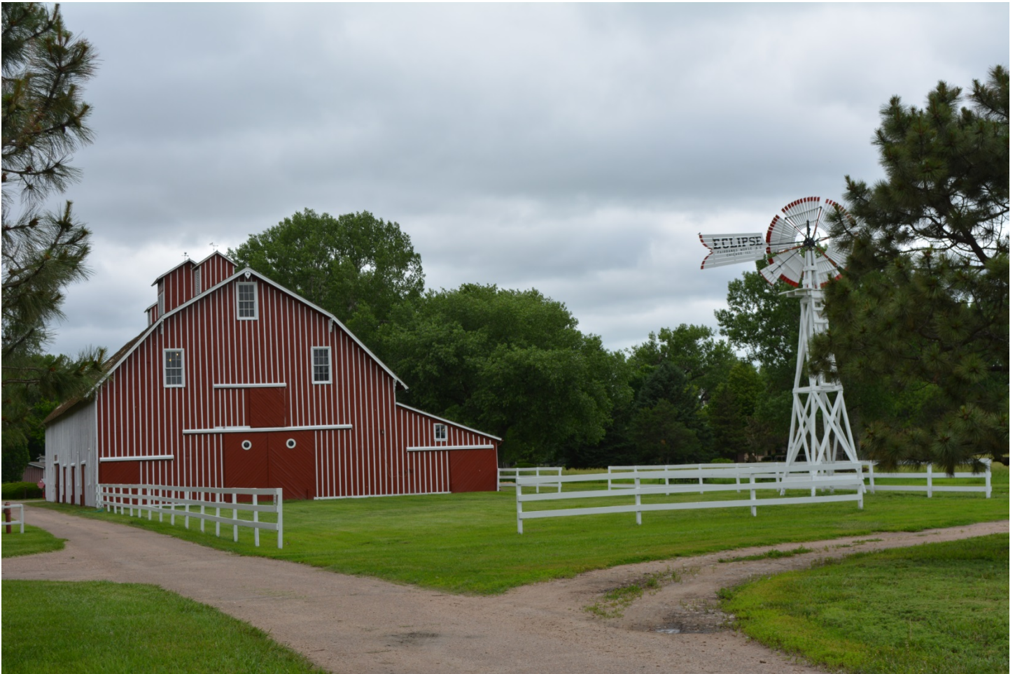
SCOUT'S REST RANCH HEADQUARTERS, North Platte, Nebraska Horse Barn, east elevation, with corral and windmill

National Register of Historic Places Registration Form