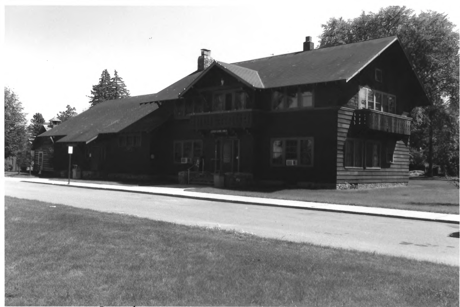
Conservation Building Cass Co., Mn 014393-21