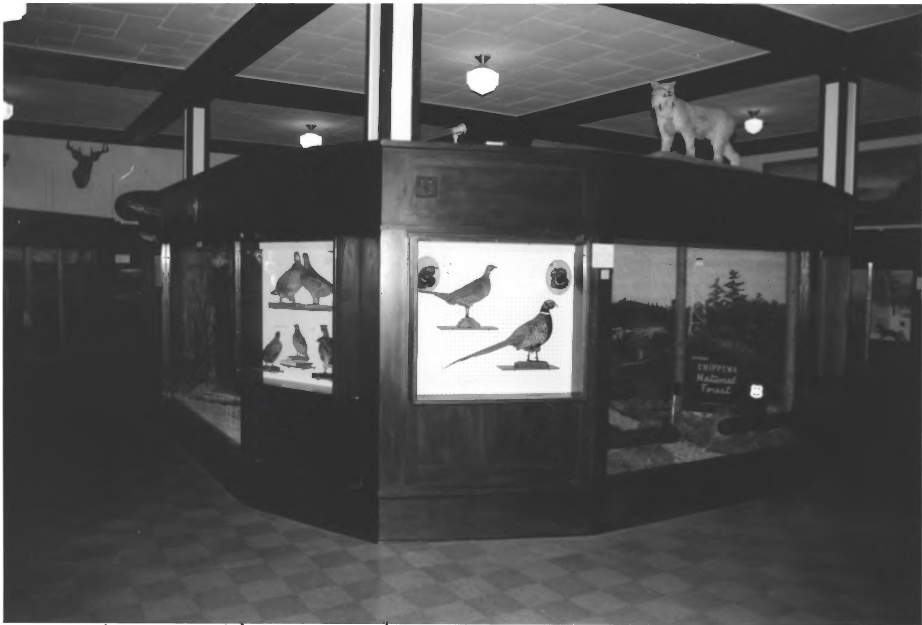
Conservation Building Exhibits Cass Co., MN 014238-11