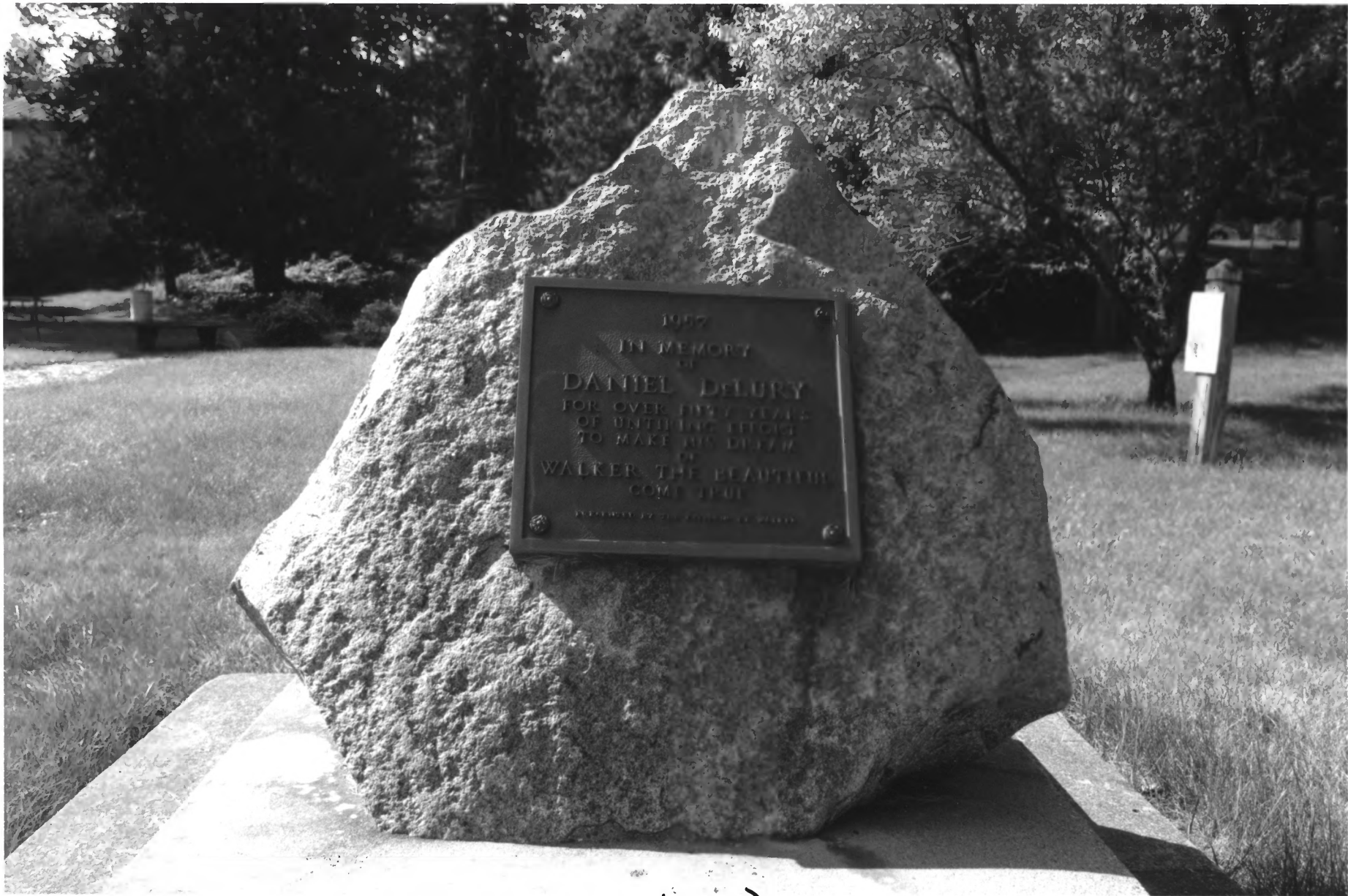
DeLury Monument (non-Contributing), WEST OF CONSERVATION BUILDING CASS CO., MN