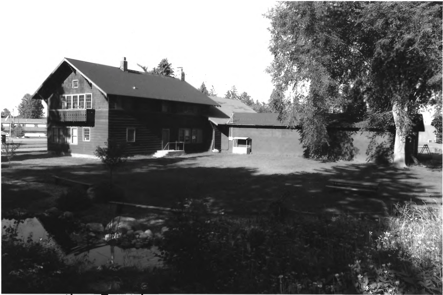
Conservation Building Cass Co., MN 014391-14