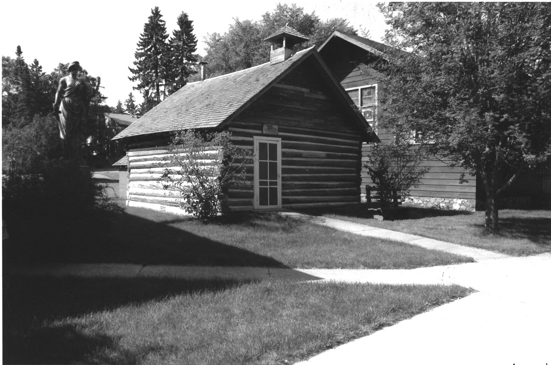
Left-Statue of Justice, Middle-Huset School (both non-contributing) Right- Conservation Building Cass Co., MN 014393-12