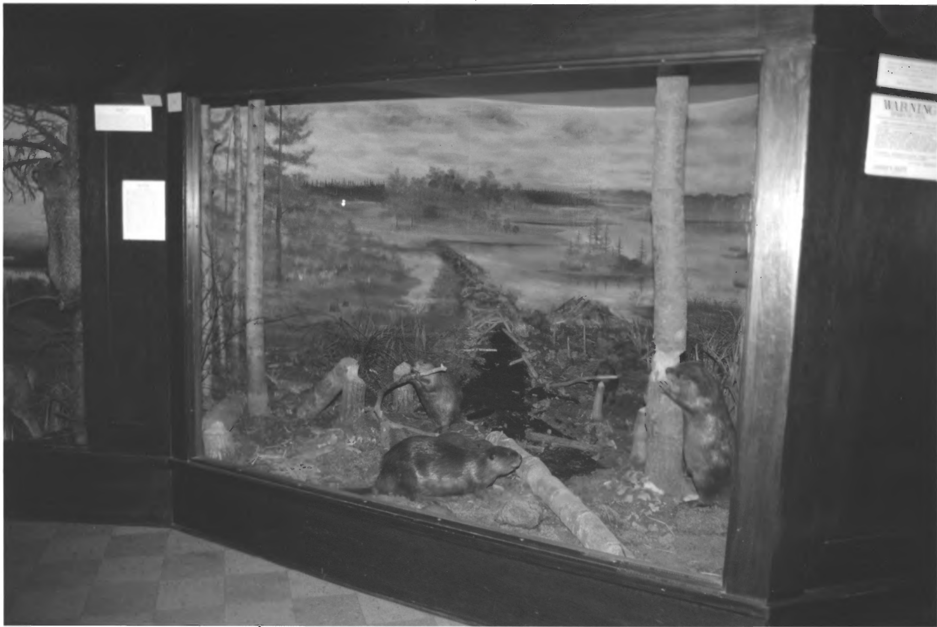
Conservation Building Exhibits Cass Co., Mn 014391-9