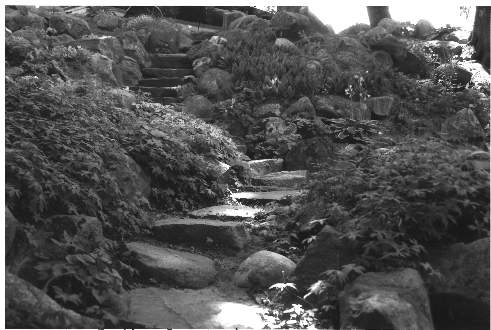
Conservation Building, Rock Garden Cass Co., MN