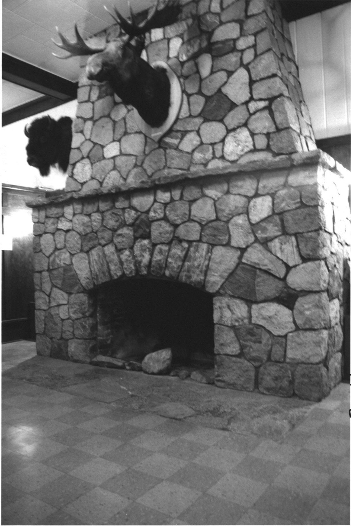
Conservation Building Cass Co., Mn 014391-2