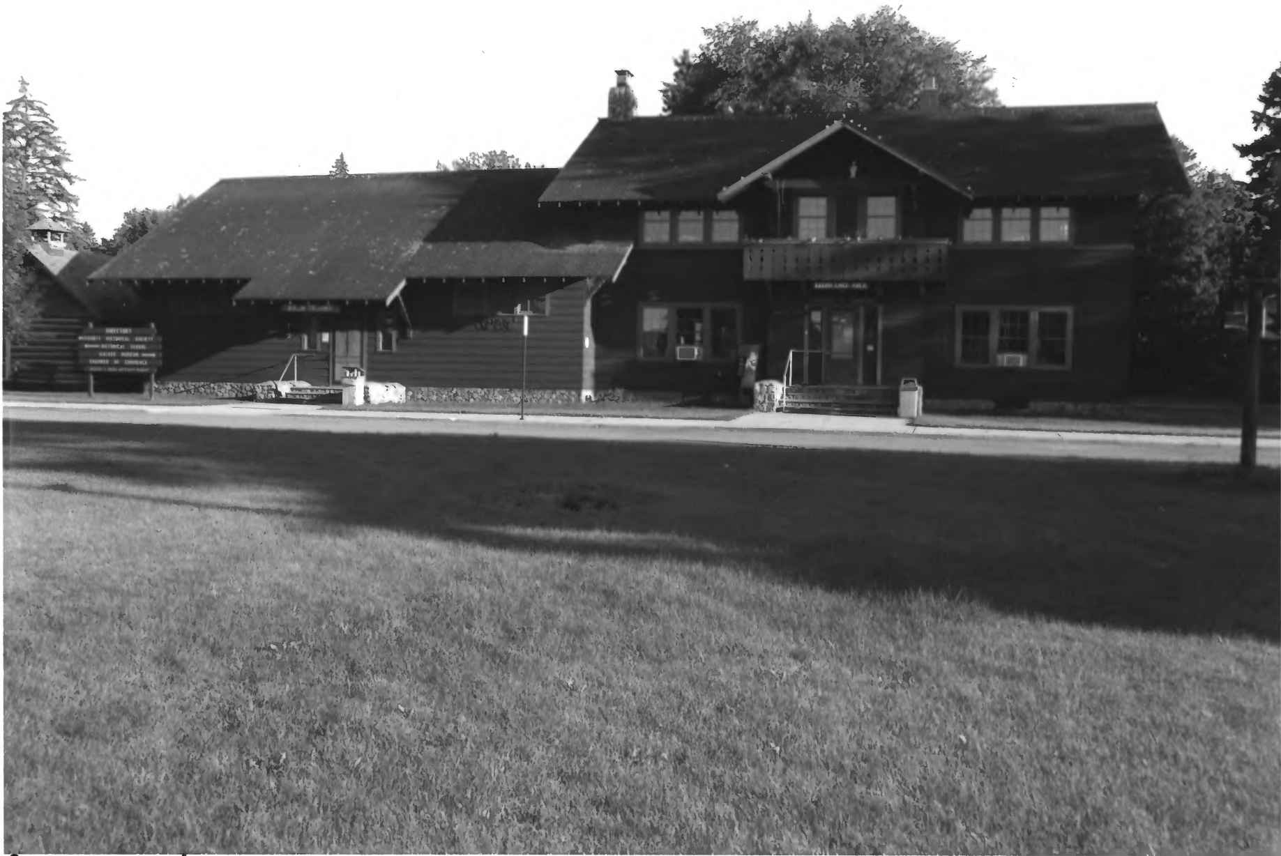
Conservation Building Cass Co., Mn 014391-18