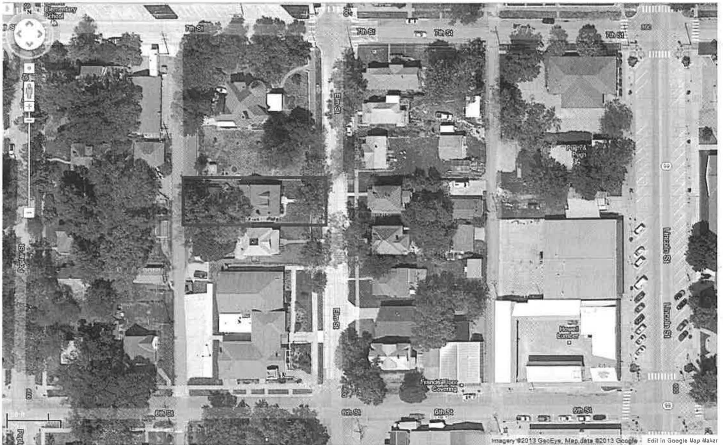
Figure 1: Aerial Image, Google.com (2013).

Baker, Cassius & Adelia, House 609 Elm Street Latitude / Longitude: 39.20406 -96.30676 Datum: WGS84