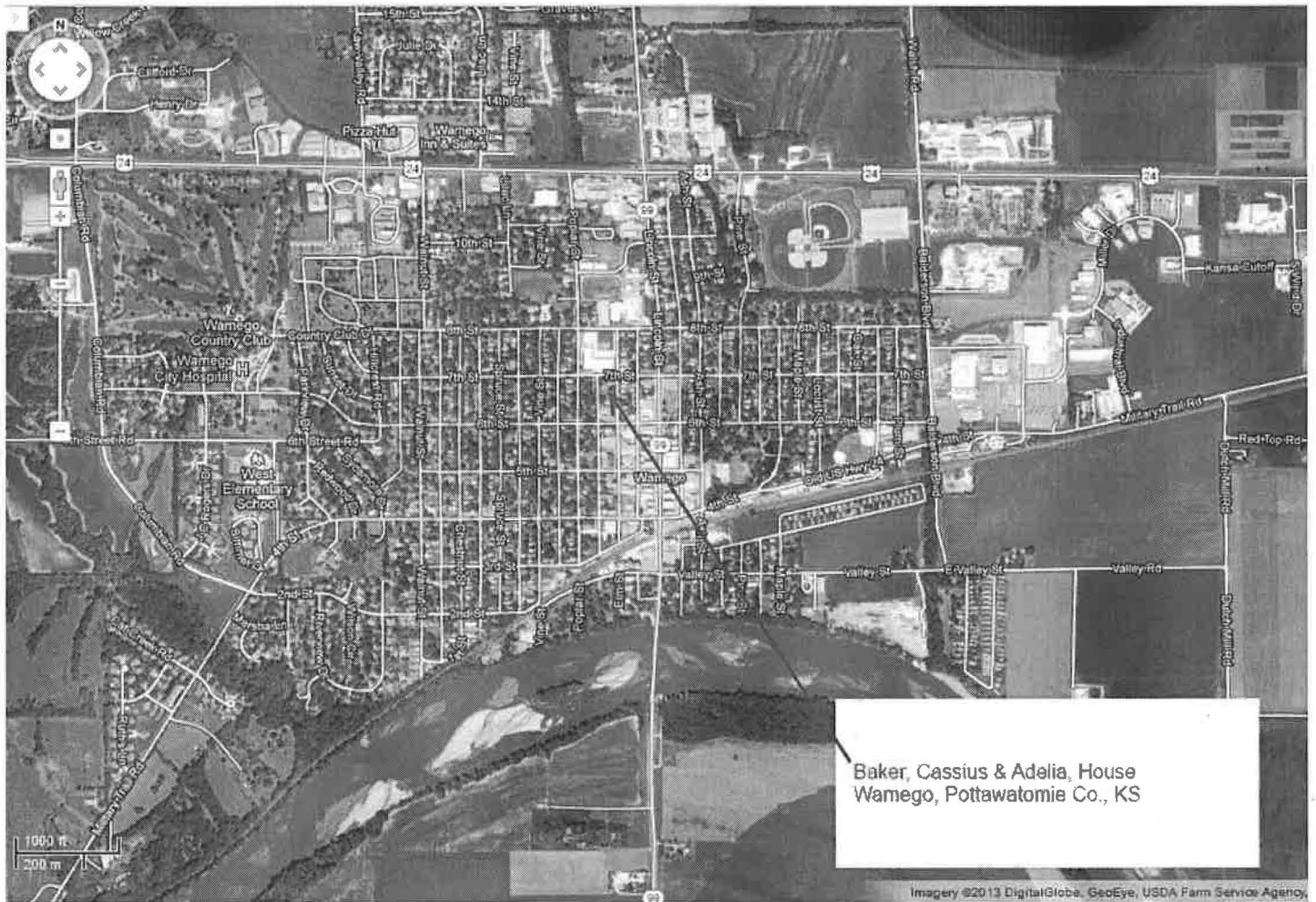
Figure 2: Contextual Aerial Image.