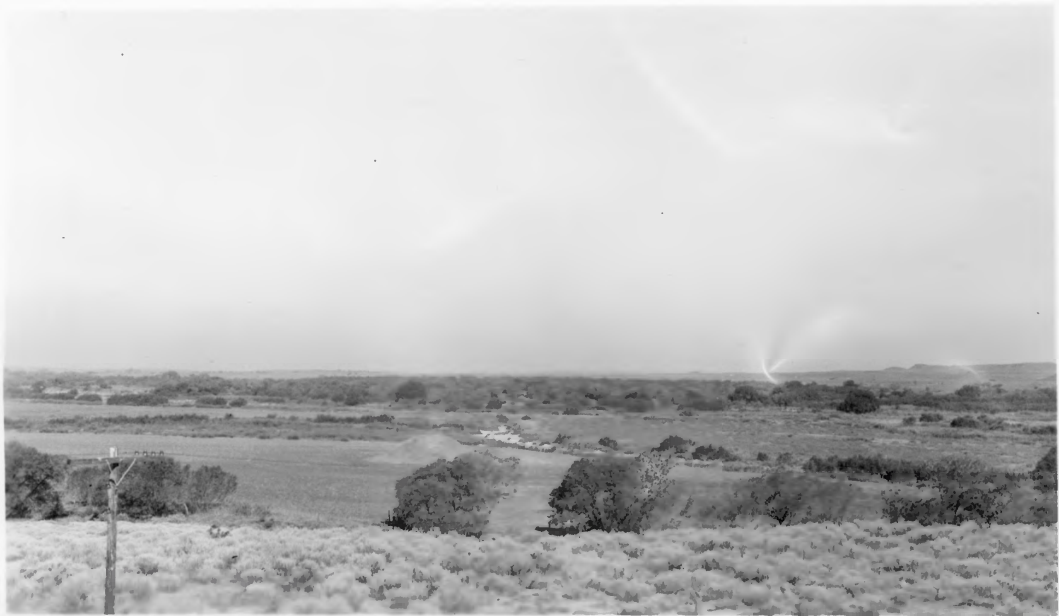
Washita Battlefield.