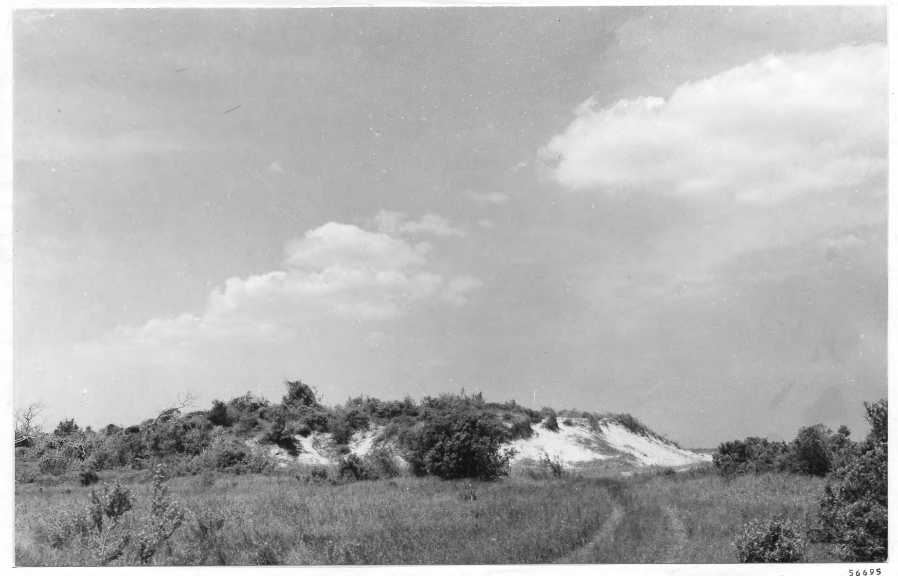
FORT FISHER, North Carolina - The remains of Battery Buchanan, at the southern tip of Federal Point. Here the garrison of Fort Fisher surrendered on the night of January 15, 1865.