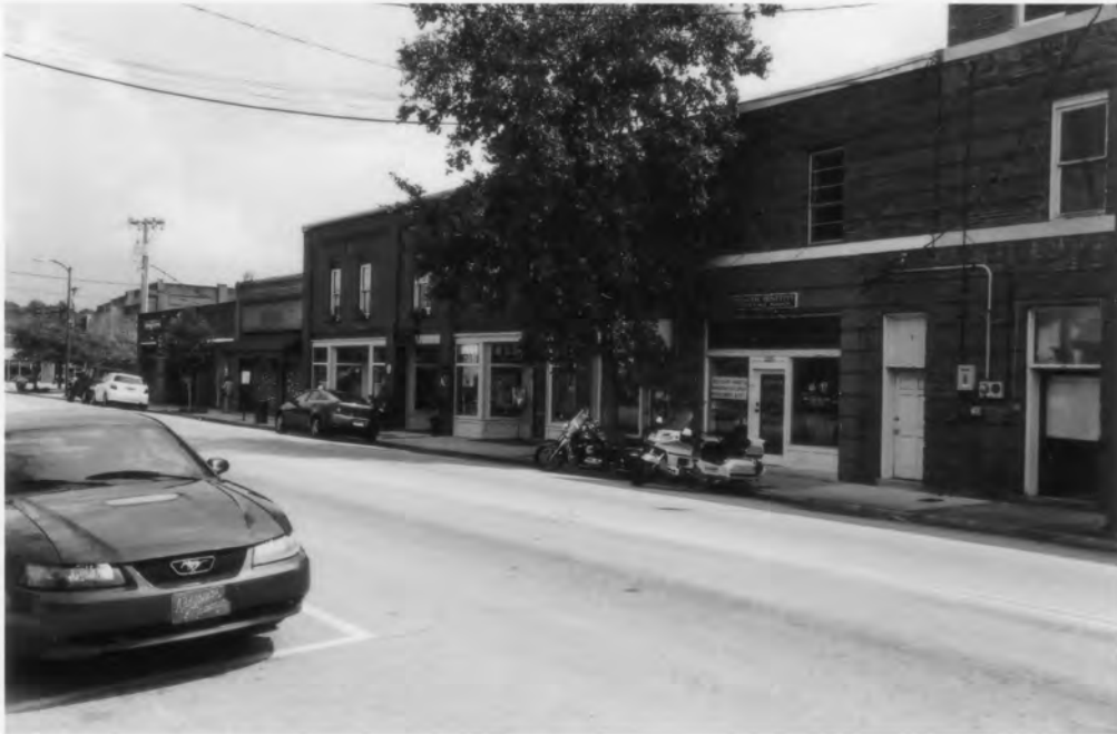
7. Conway Downtown Historic District (Boundary Increase) 1011/1013/1015 Fourth Street, Conway Horry County, South Carolina