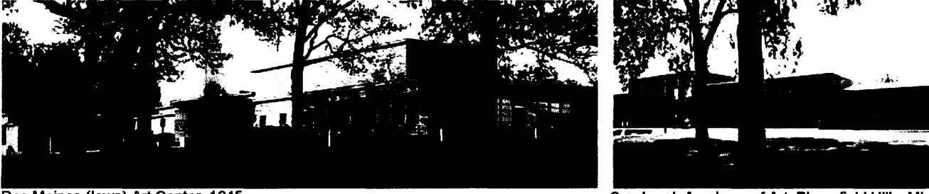
Des Moines (Iowa) Art Center, 1945 Online: desmoinesartcenter.org/saarinen