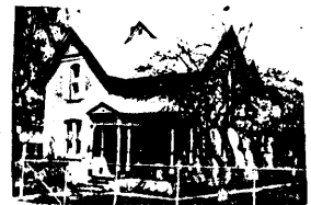
Roll #11 Frame #11A-12