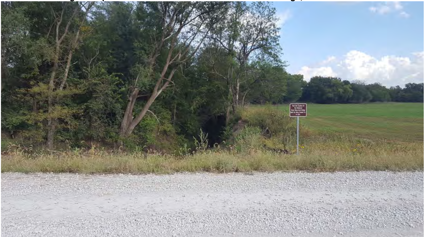
Image 2: Sign indicating previous location of Keim Stone Arch Bridge; view east.