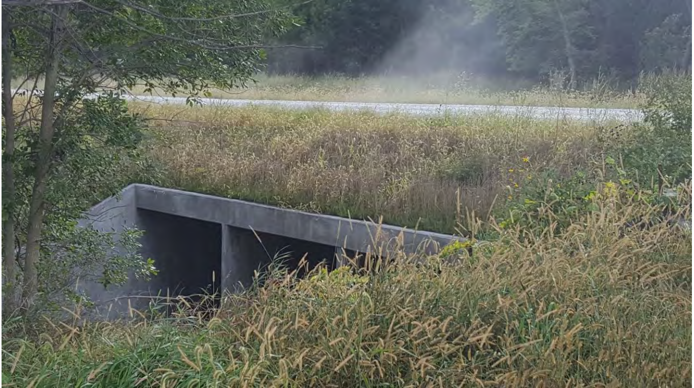
Image 1: Replacement culvert for the Keim Stone Arch Bridge; view southwest.