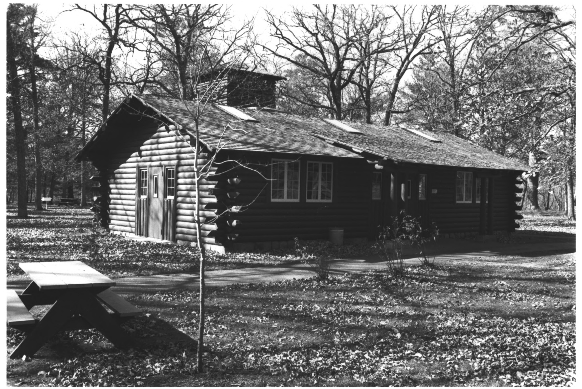
CHAS. A. LINDBERG STATE PARK MORRISON CO., MN BLDG # 1 PHOTO 1.D. 09340 # //