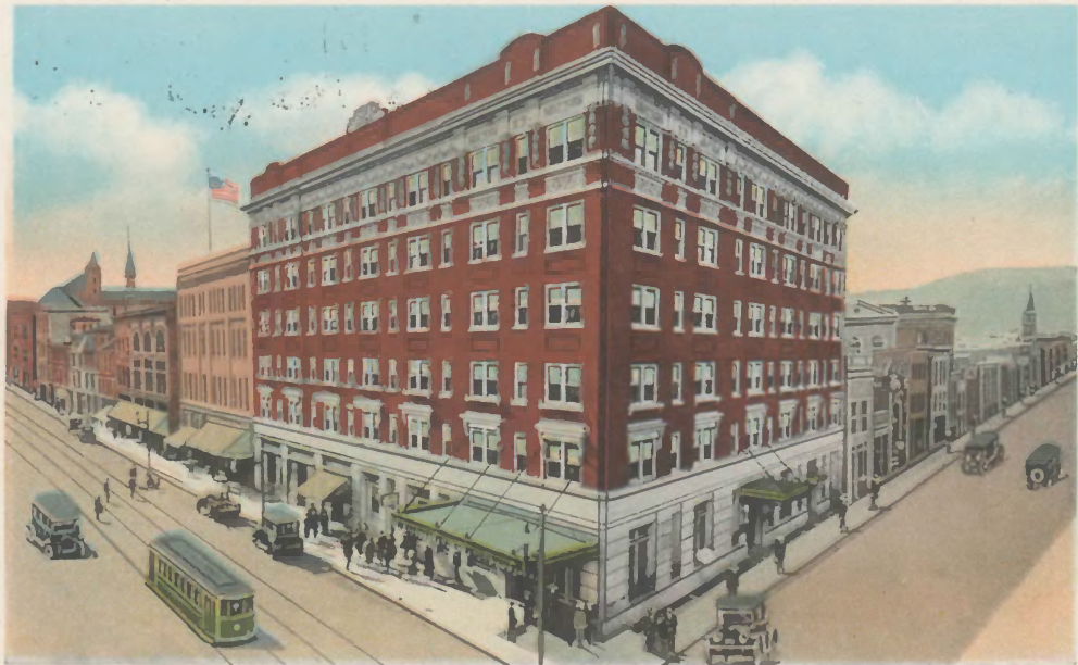
FORT CUMBERLAND HOTEL.