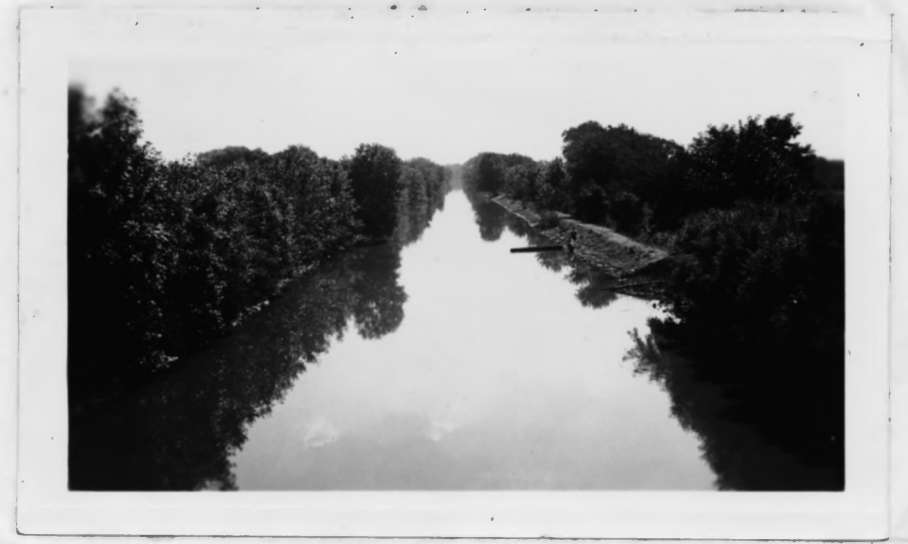
The Canal Last of Seneca (Contributed by SP-4)