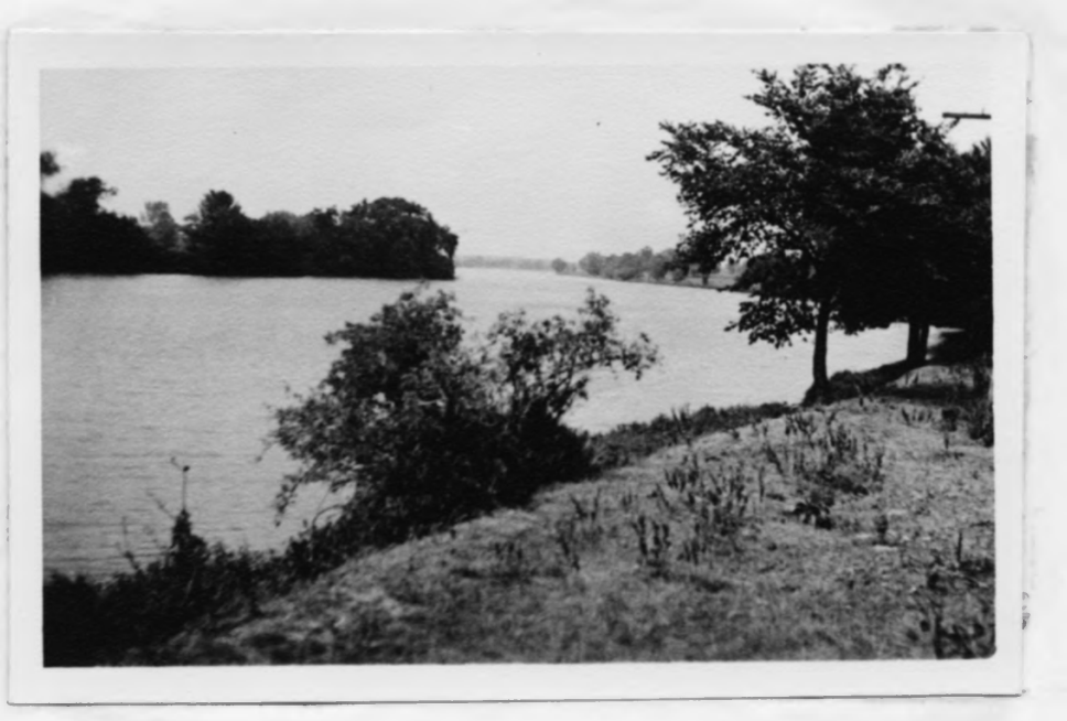
Wide Water Above Channahon