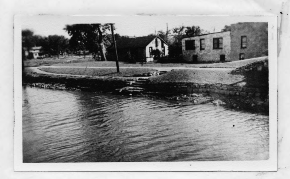
(Contributed by SP-4)