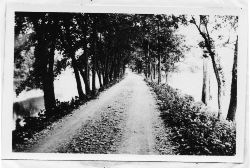
Tow Path Between Channahon and McKinley Woods