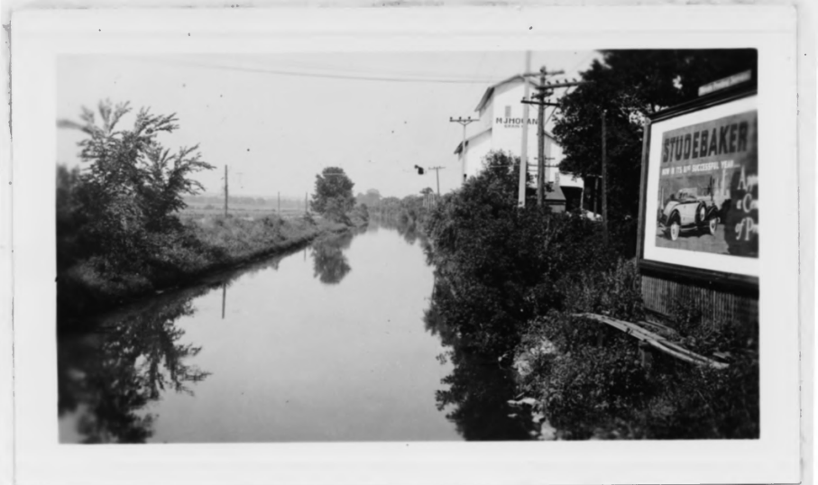
A Scene at Seneca (Contributed by SP-4)