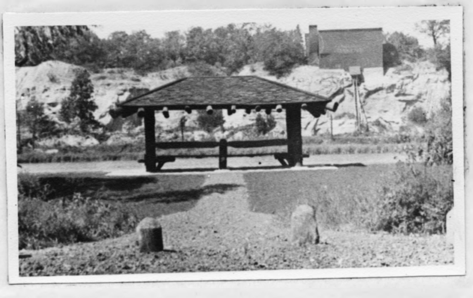
Typical Trailside and Picnic Shelter