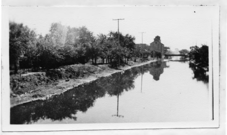
Elevators at Marseilles