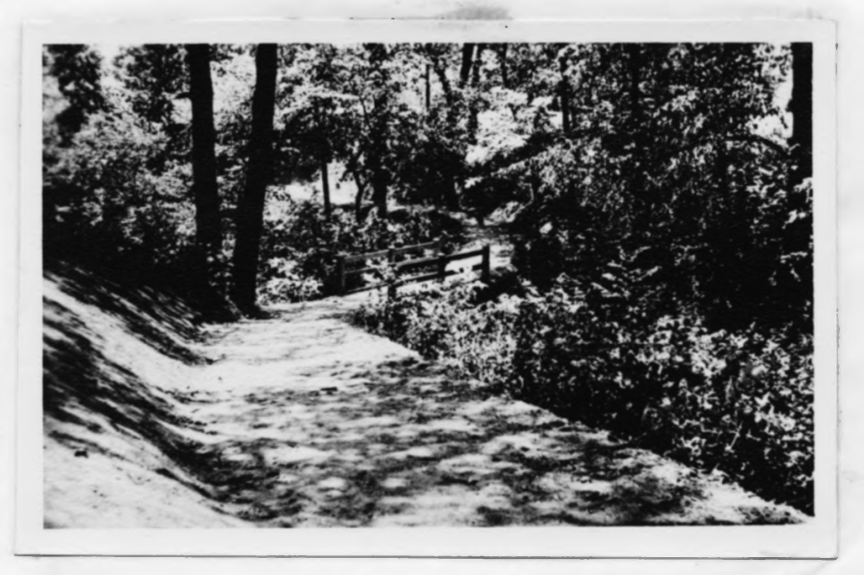
A Typical Section of Trail