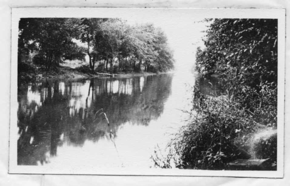
A Scenic Spot Below Channahon (Contributed by SP-3)