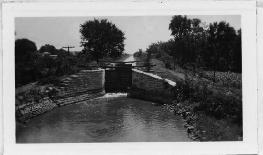
Lock No. 9 at Marseilles