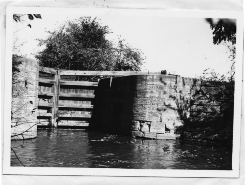
Gate of Lower Lock (Leica negatives filed at Regional Office)