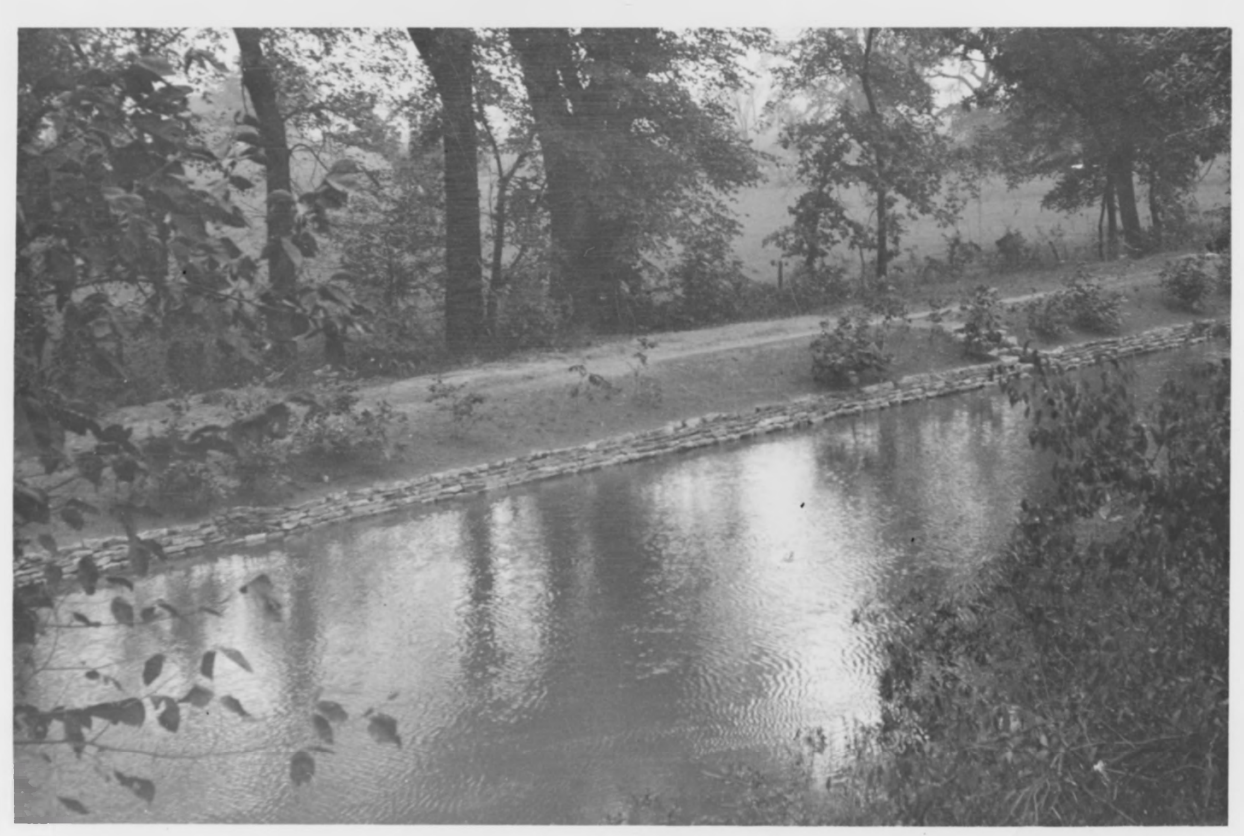
(contributed by SP-5)