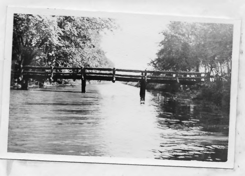
Foot Bridge Opposite Buffalo Rock