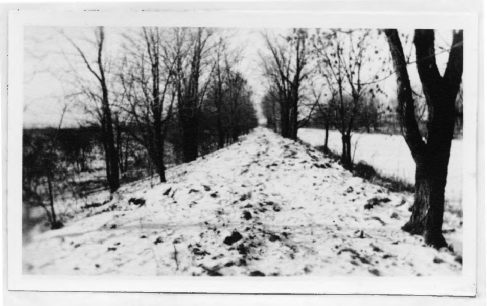
Snow View of Trail Along Canal (Contributed by SP-4)