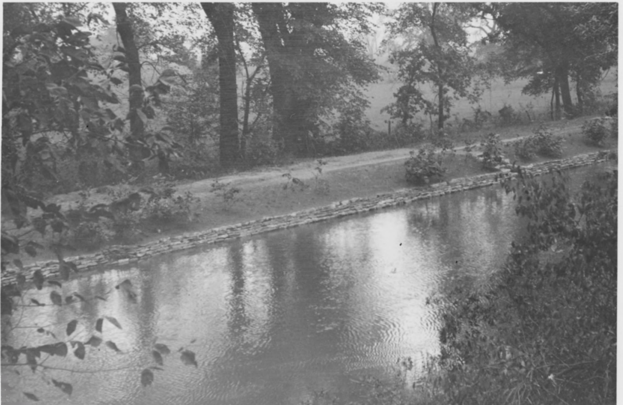
(Contributed by SP-5)