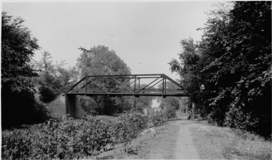
Twin Bluffs Showing Lock 12