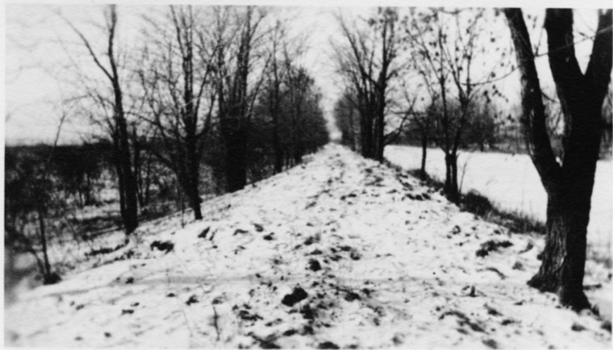
Snow View of Trail Along Canal