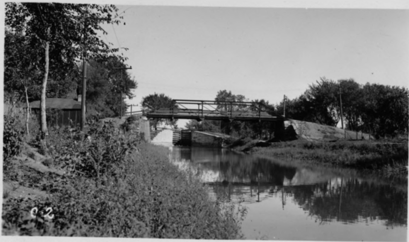
Lock No. 10 at Marseilles