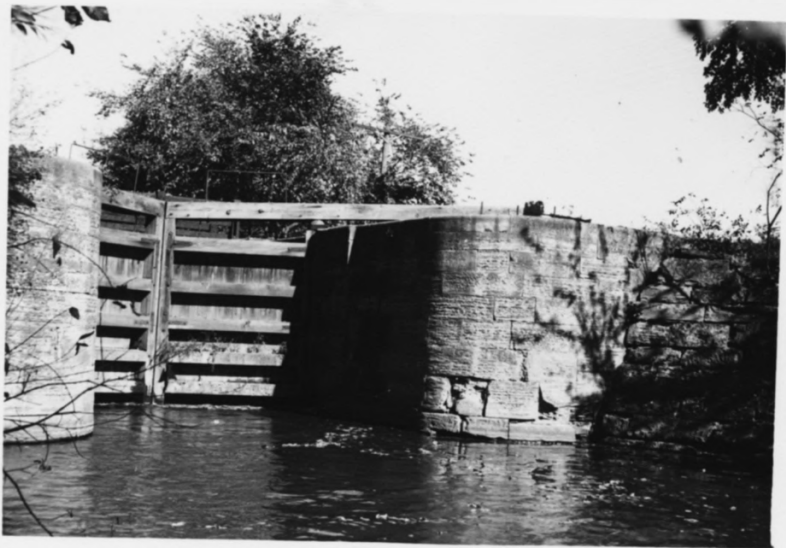
Gate of Lower Lock (Leica negatives filed at Regional Office)