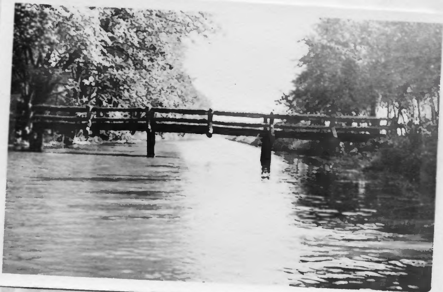
Foot Bridge Opposite Buffalo Rock (Contributed by SP-5)