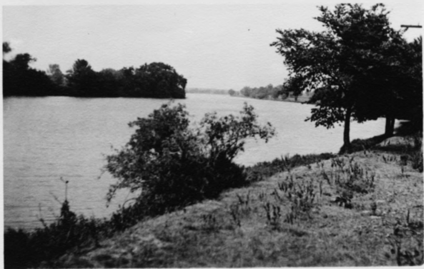
Wide Water Above Channahon