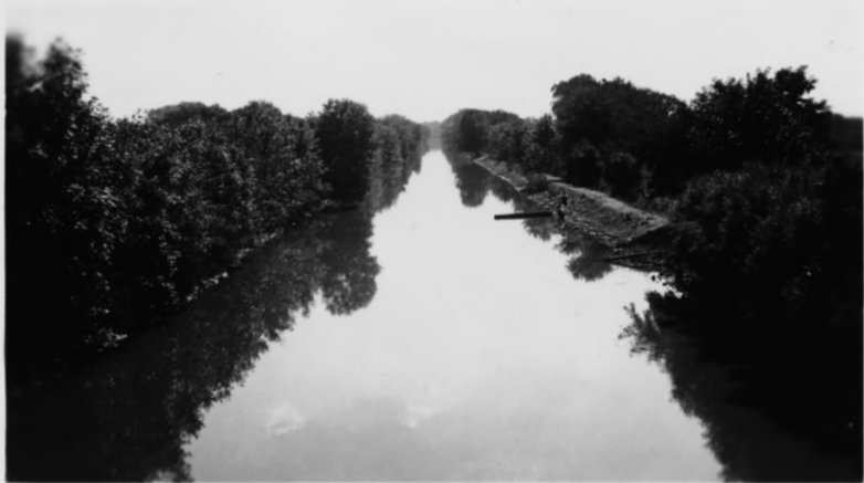
The Canal East of Seneca