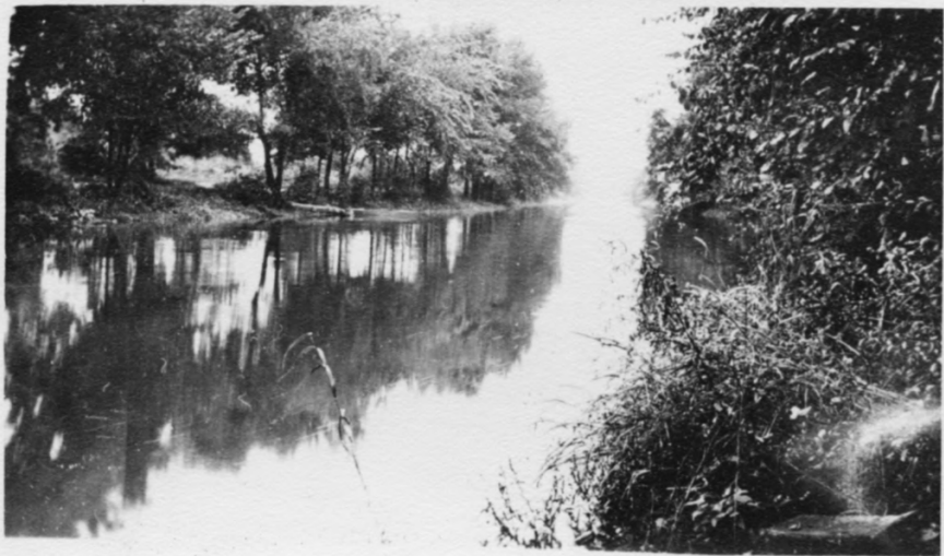
A Scenic Spot Below Channahon