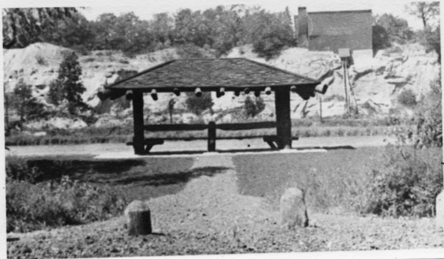
Typical Trailside and Picnic Shelter (Contributed by SP-5)