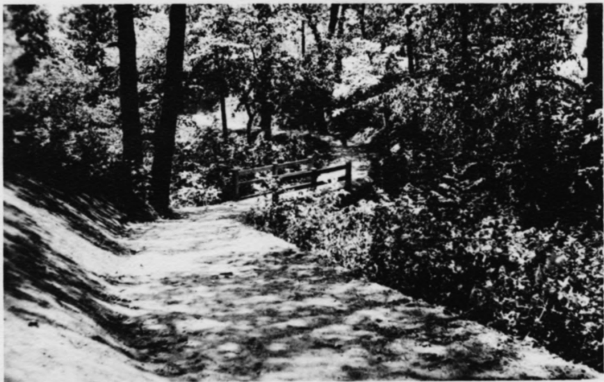
A Typical Section of Trail