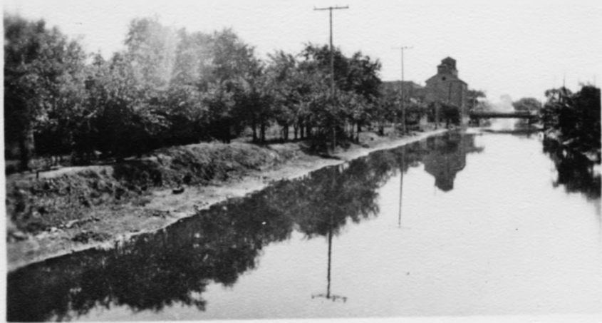
Elevators at Marseilles