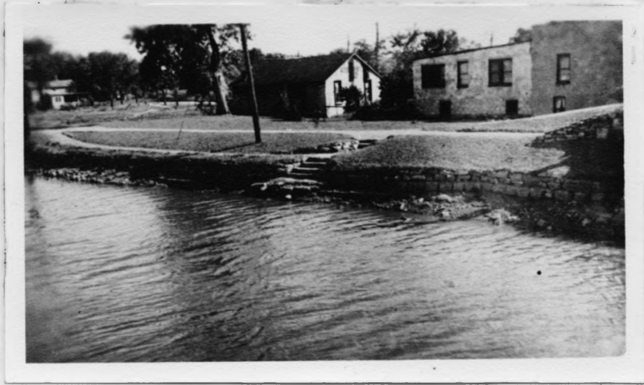
(Contributed by SP-4)