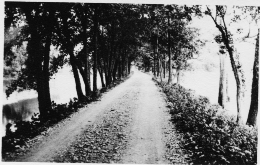
Tow Path Between Channahon and McKinley Woods