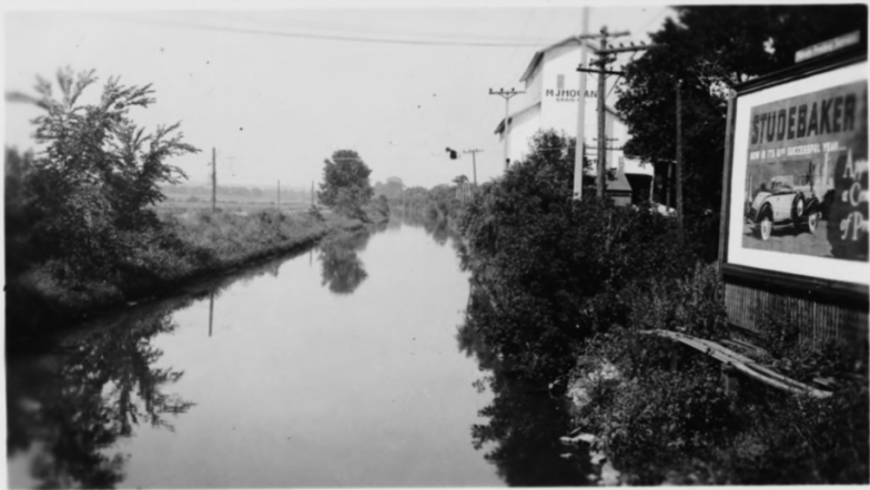
A Scene at Seneca (Contributed by SP-4)