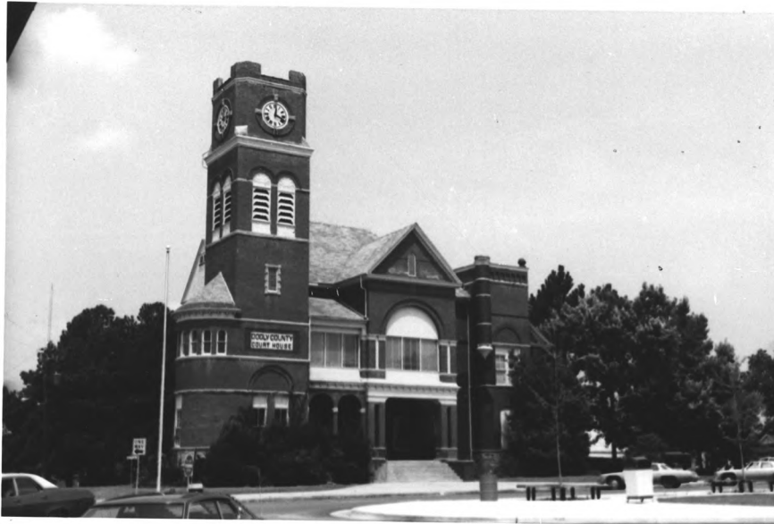
DOOLY COUNTY COURTHOUSE

This courthouse is an architectural focal point, but it is also a repository for official records, land transactions and road construction and therefore, chronicles the county and is a focal point in the life of every citizen.