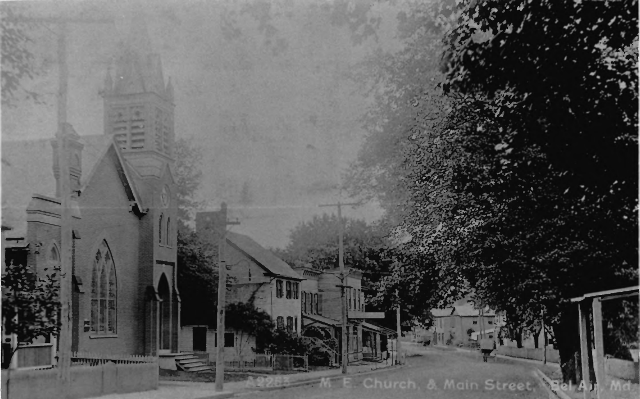
A2285 M. E. Church, & Main Street, Sel Air, Md.