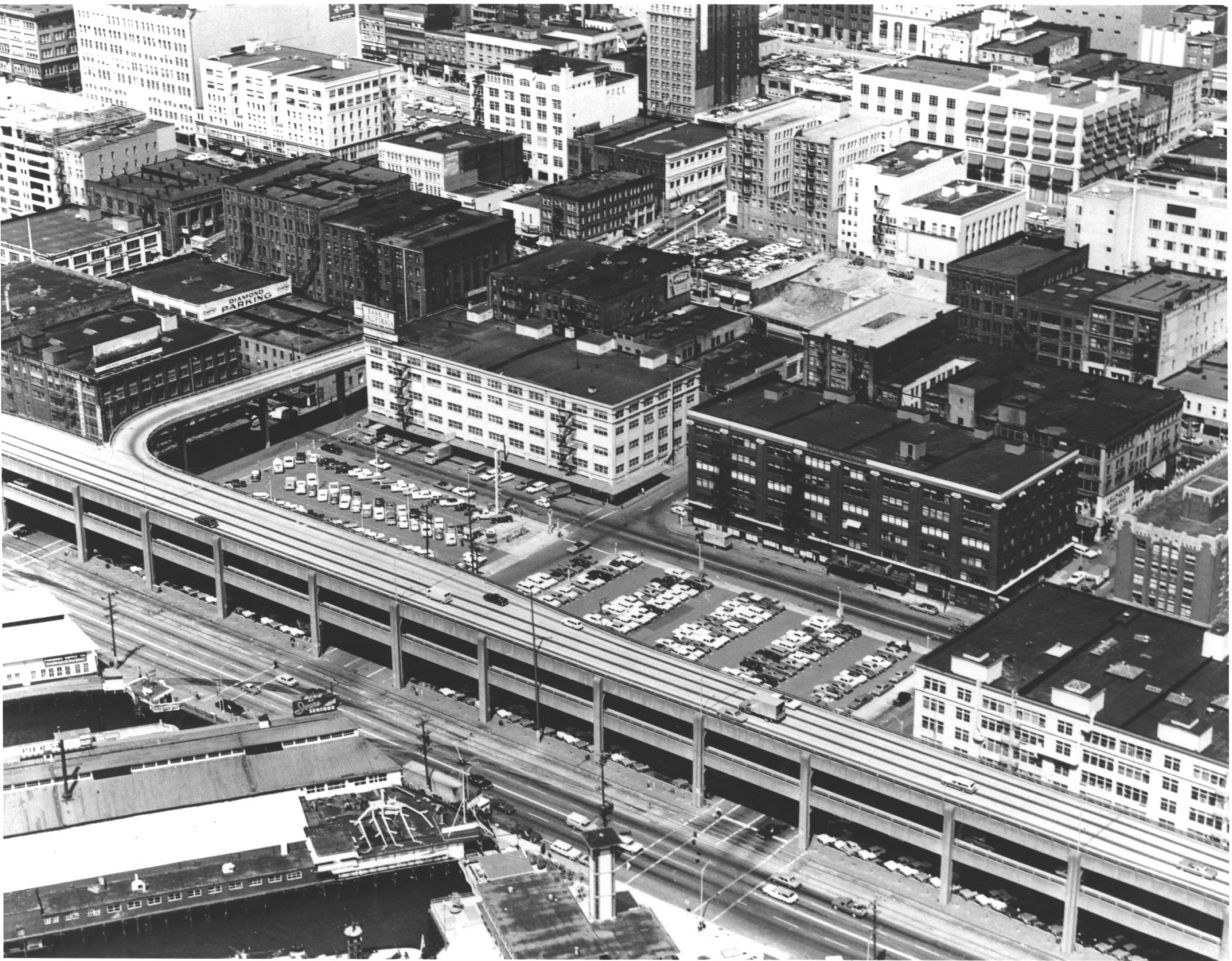
Aerial view of Alaskan Way viaduct and adjoining buildings and parking lots, c. 1960. Agen warehouse is at extreme left.