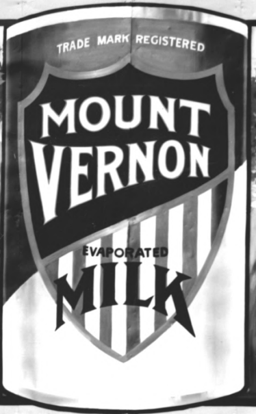
Billboard display advertisement for Mount Vernon Milk, 1914.