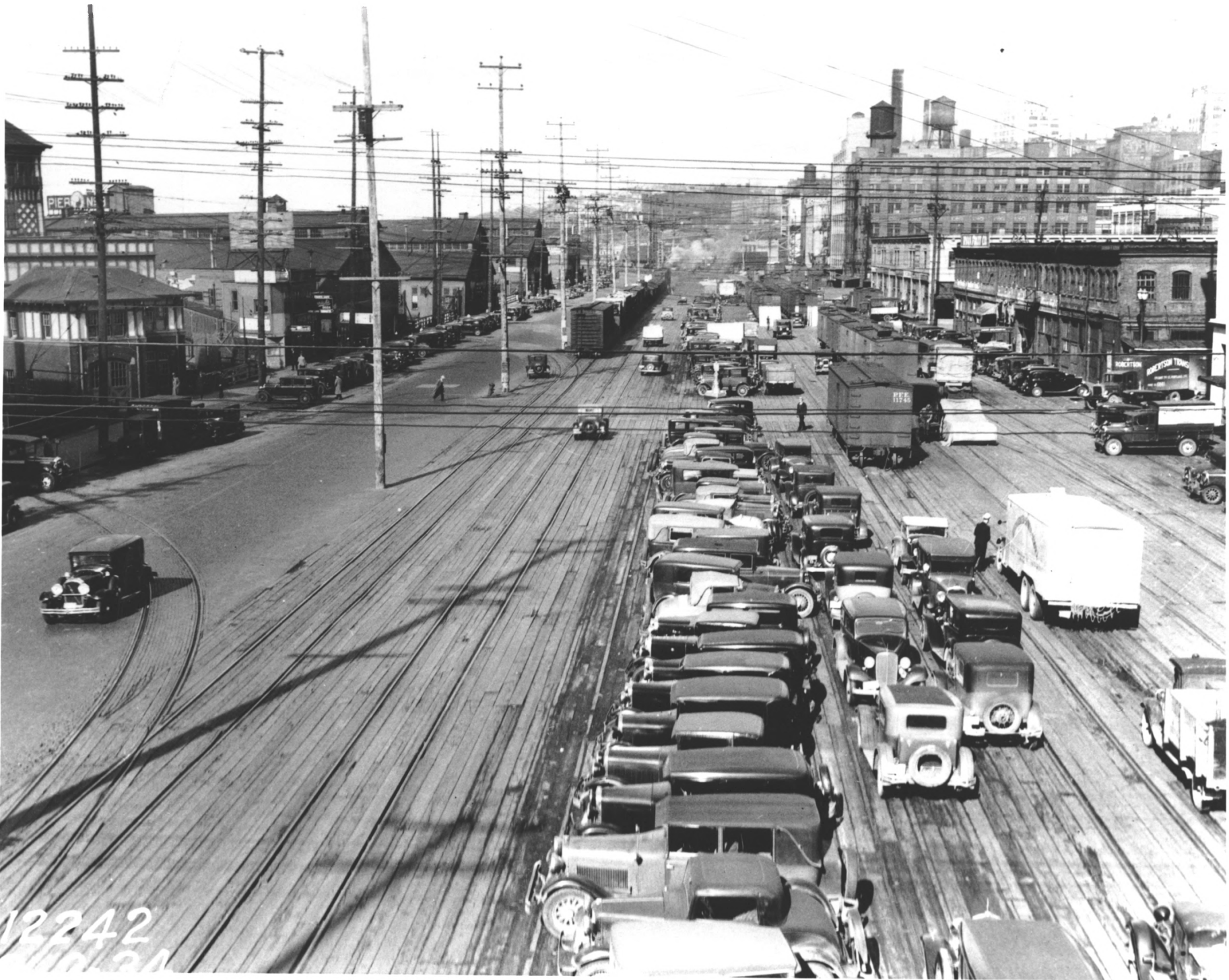
Railroad Avenue in the 1920's was a myriad of parking and tracks for the loading and movement of railroad freight cars. A large warehouse is at upper right in this photograph.