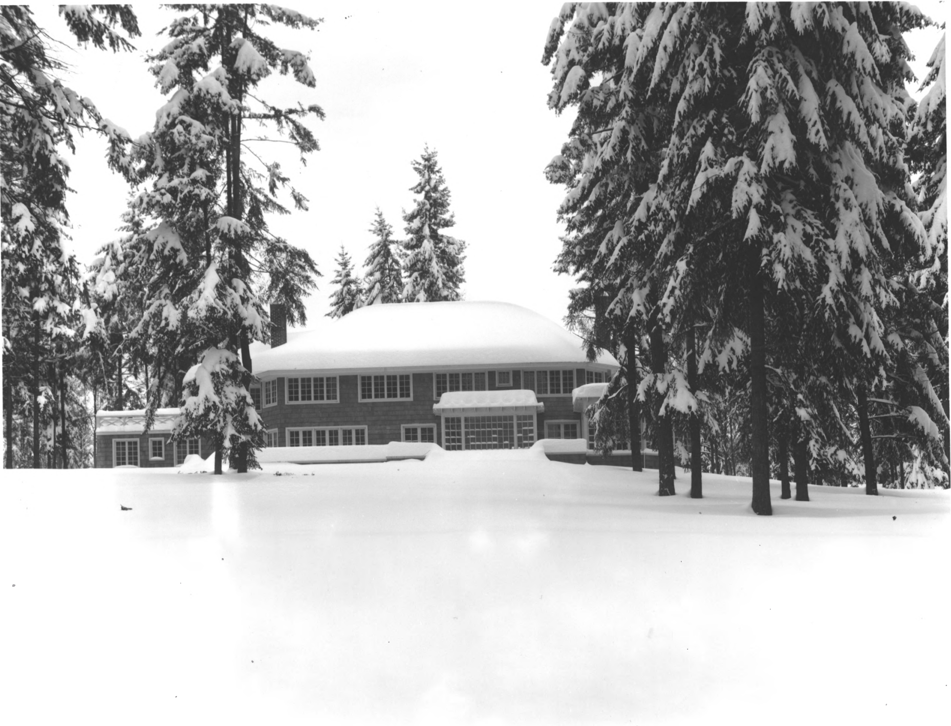
The Ager "summer estate" near the Highlands, c. 1915.