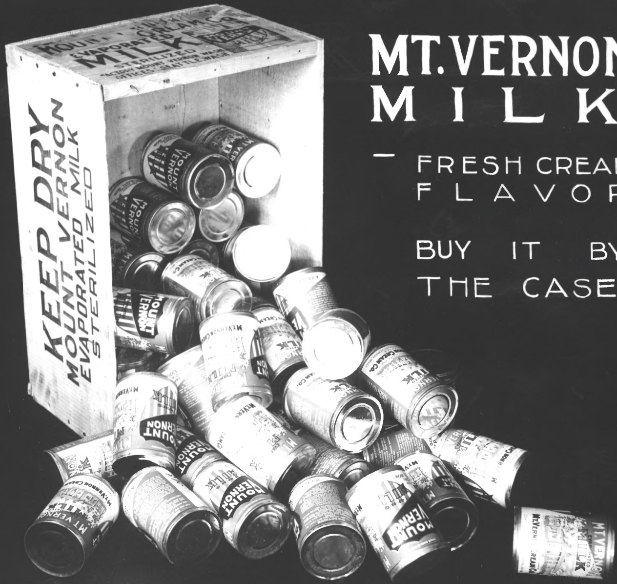
Publicity photograph from Mount Vernon Milk, 1914.