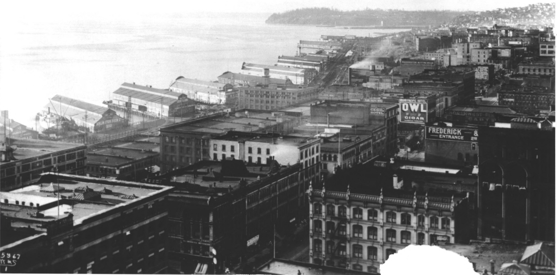
View northwest from top of the Alaska Building, c. 1911, showing lower First Avenue, Western Avenue, and Railroad Avenue. Colman Building at lower left. Agen warehouse is at center of photograph.