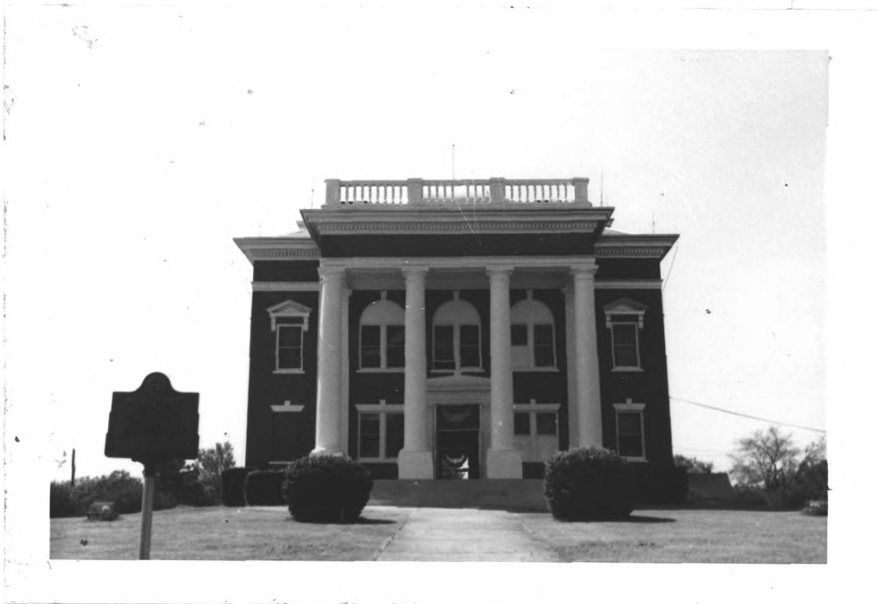
MURRAY COUNTY COURTHOUSE